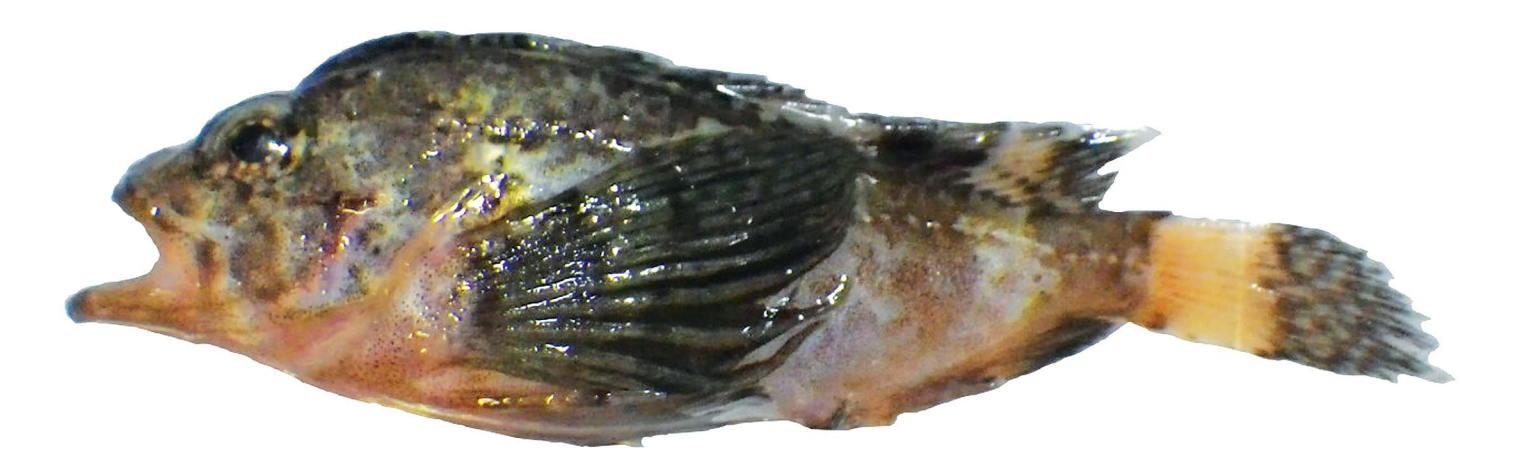
Figure 1. Ocosia sphex new species, fresh after collection, holotype, NTUM 11318, 38.6 mm SL, western Pacific Ocean, Papua New Guinea, New Ireland Province, northwest of New Hanover (J.-N. Chen).

Head length 41.2% SL. Snout obliquely upturned, in an angle of about 48° to horizontal midline of body. Snout length (preorbital length) 10.6% SL, 25.8% HL. Orbit diameter 12.2% SL, 29.6% HL. Postorbital length 17.4% SL, 42.1% HL. Interorbital with two weak ridges, each ending in a small lump near midline just before origin of dorsal fin. A small spine on supraocular ridge at upper rear margin of orbit. Two ridges (parietal and nuchal) in a row behind upper orbit, nearing two small spines. Two ridges (pterotic and posttemporal) in a row behind midorbit bearing a pterotic spine, followed by a small supracleithral spine. Opercle with two ridges. Lower jaw slightly protruding, bearing a small knob at symphysis, flanked by two small papillae. Frontal bone with a rhomboidal knob above premaxillary. Upper-jaw length 17.4% SL, 42.1% HL. No papillae on premaxillary. Lachrymal bone with two prominent spines, anterior spine about 1/3 length of second; first points down, not backward, second points backward. No small spine present on lateral face of lachrymal bone above base of second spine. No spine on second infraorbital bone. Preopercle with first spine prominent, second about 1/4 length of first, third to fifth smaller but present. First sensory pores of lower jaw separated; mandibular pores 3+2+3 (Fig. 2C). Position of