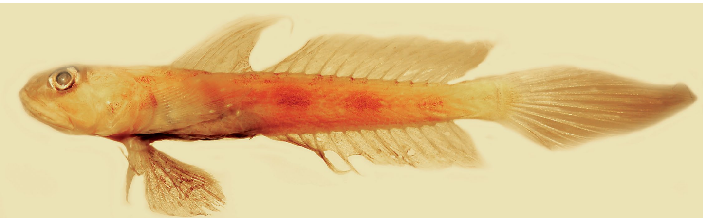
Figure 2. Tomiyamichthys reticulatus , preserved holotype, CAS243882, 54.6 mm SL, male, Rabi Island, Fiji (D.W. Greenfield).

Mouth oblique, forming an angle of about 55° to horizontal axis of body, upper jaw slightly longer than lower jaw; maxilla reaching a vertical just posterior to pupil, upper-jaw length 2.1 in HL (12.8); upper jaw with an outer row of 12 well-spaced, incurved, canine teeth on each side, all about same size; lower jaw with about 25 smaller, incurved, canine teeth on each side; front of lower jaw with an inside row of six larger, incurved, canine teeth; tongue rounded; posterior naris adjacent to upper part of front of orbit, a small slit; anterior naris longer than wide with no raised edges, about midway between orbit and upper jaw.