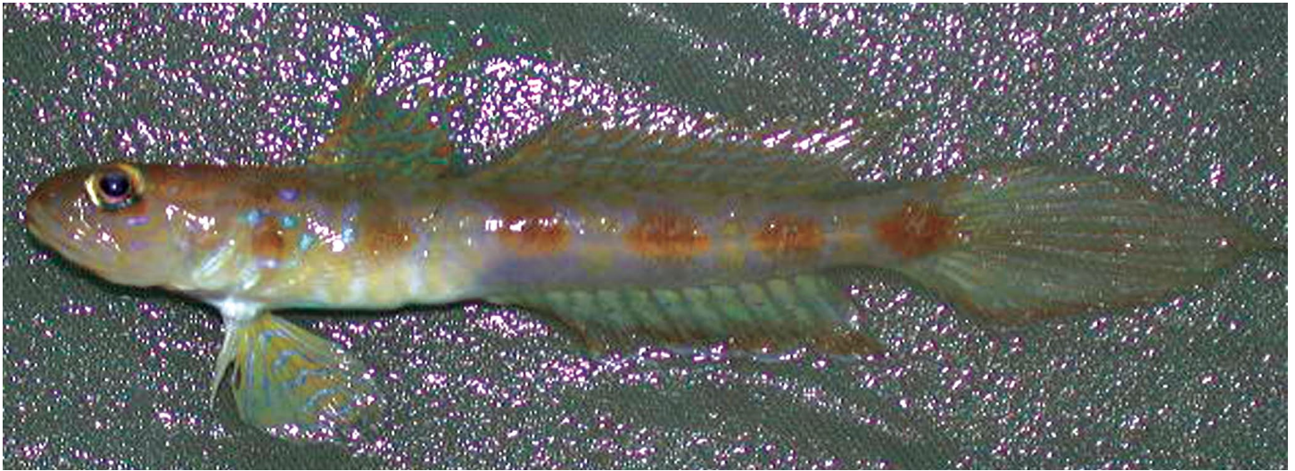
Figure 1. Tomiyamichthys reticulatus , fresh holotype, CAS243882, 54.6 mm SL, male, Rabi Island, Fiji (D.W. Greenfield).

belly; circumpeduncular scales about 14; ctenoid scales on body, becoming cycloid and larger from near front of second dorsal fin posteriorly; gill opening extending forward to middle of operculum without a free fold, not reaching posteroventral edge of vertical limb of preoperculum.