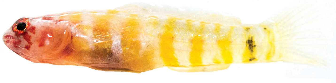
Figure 4. Eviota dalyi , fresh paratype, Amirante Islands, Seychelles (R. Daly).

area behind second bar. Remaining body bars yellow, with narrow white bars in between, extending to ventral surface. Fin membranes clear with a few scattered melanophores on distal margin of first dorsal fin and distal margin of second dorsal fin edged with yellow. One fresh paratype with dark markings over preural centrum (Fig. 4).