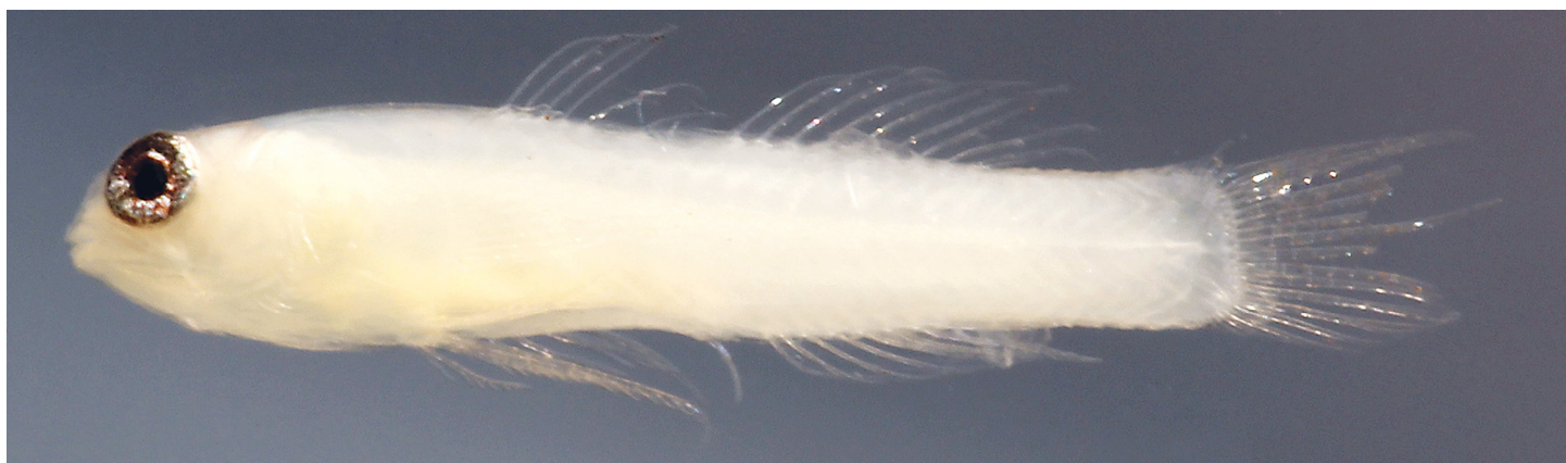
Figure 6. Eviota dalyi , preserved holotype, CAS 246480, 6.9 mm SL female, Amirante Islands, Seychelles (D.W. Greenfield).