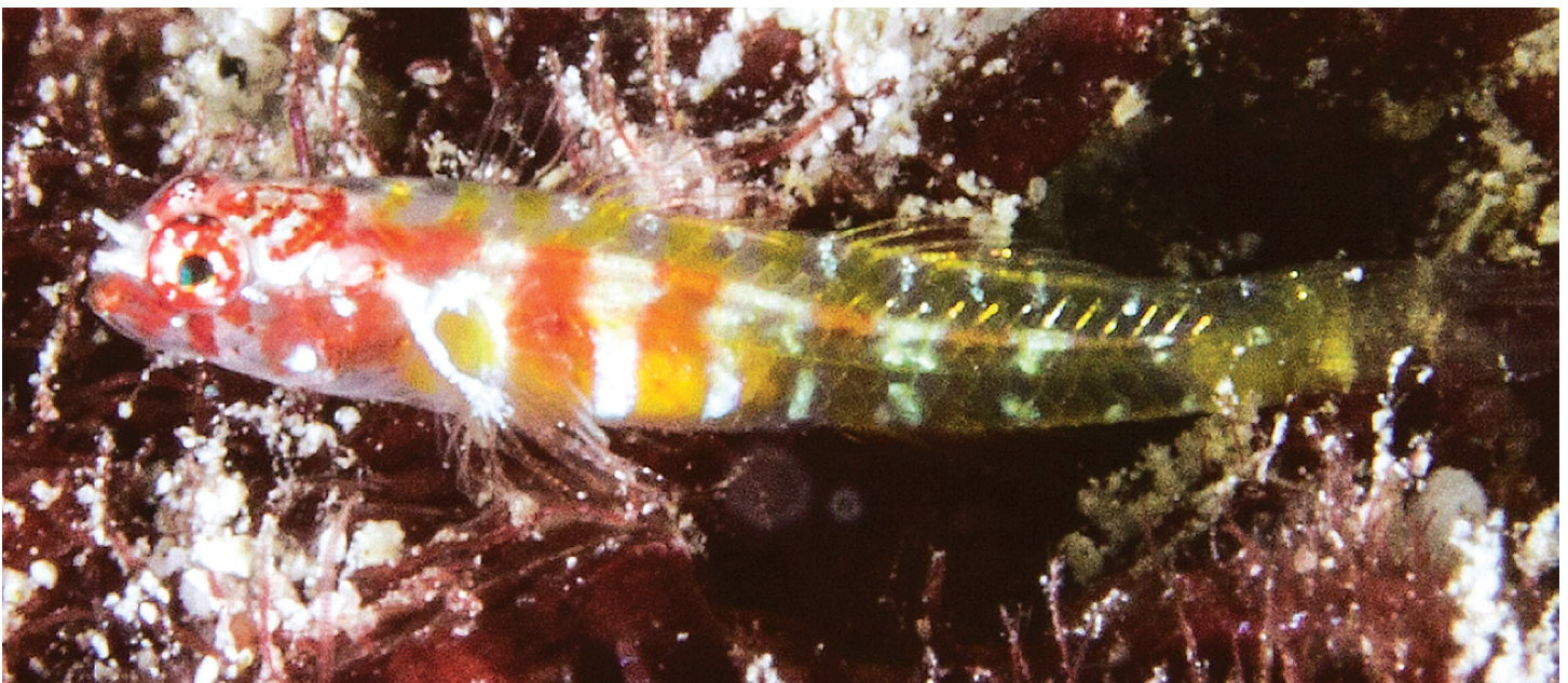
Figure 3. Eviota dalyi , underwater photograph of paratype, Amirante Islands, Seychelles (L. Gordon).

Color in life. (Figs. 1–5) Background color of head translucent gray and body translucent and colorless. Head with red and white markings. Elongate anterior narial tubes stark white, jaws red, and snout white. Iris white with irregular red markings, not bars. Two red bars under eye, one at 6 o'clock, the other at 5 o'clock position. Area behind eye stark white crossed by three red bars from top of head. Red area on preoperculum with a white spot on ventral portion. Operculum red with white area dorsally, joining white area behind eye. Pectoral-fin base yellow, crossed by a stark white bar extending posteroventrally down from white area behind eye. Area above pectoral-fin base and white bar with red blotch, grey nape above it crossed by two yellow bars. Top of head with a red triangle enclosing a white spot between eyes just posterior to bifurcation of interorbital canal, a crescent-shaped red bar on each side behind triangle, followed by a large crescent-shaped red area crossing top of head; a few large melanophores scattered over cranium on one paratype. White line extending down vertebral column, interrupted by red, orange, and yellow segments. First body bar behind pectoral-fin base, extending from first dorsal-fin base to ventral surface, portion above vertebral level orange, grading to yellow at lower abdomen. Second body bar under the end of first dorsal fin similar in color pattern and separated from first by a stark white area; similar white