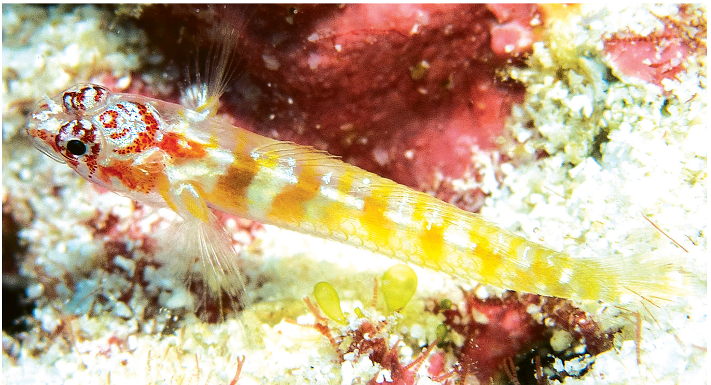
Figure 1. Eviota dalyi , underwater photograph of holotype, Amirante Islands, Seychelles (R. Daly).

Front of head sloped, profile an angle of about 70° from horizontal axis; mouth slanted obliquely upwards, forming an angle of about 40° to horizontal axis of body, lower jaw not projecting; maxilla extending posteriorly to below posterior margin of pupil; anterior narial tube long and white, extending anteriorly beyond posterior margin of lip; gill opening extending forward to posteroventral edge of preoperculum; cephalic sensory-canal pore system lacking only IT pore (Pattern 2); cutaneous sensory papillae obscure; teeth not examined.