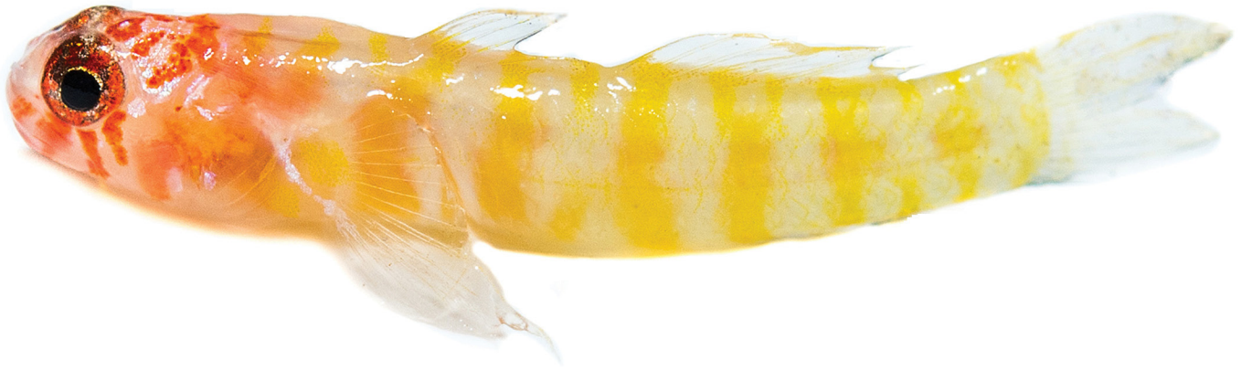
Figure 2. Eviota dalyi , fresh holotype, Amirante Islands, Seychelles (R. Daly).

Measurements (% SL of holotype): head length 29.3; origin of first dorsal fin 34.3; origin of second dorsal fin 58.6; origin of anal fin 62.6; caudal-peduncle length 25.2; caudal-peduncle depth 14.6; body depth 20.2; eye diameter 8.1; snout length 4.0; upper-jaw length 10.6; pectoral-fin length 32.3; greatest pelvic-fin length 35.3.