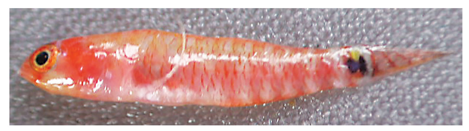
Figure 2. Eviota cometa, fresh specimen, CAS 222731, Budd Reef, Fiji.

connecting to a short, wide bar over end of hypural plate, with a yellow spot over nexus; caudal fin crossed by thin, red, diagonal bars, pale in preservative.