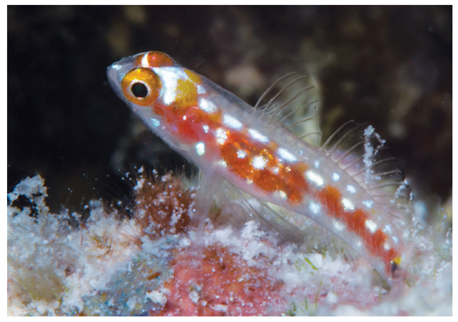
Figure 1. Eviota cometa , Yagasa Lagoon, Lau Archipelago, Fiji, approximately 140 km from the type locality on Totoya Island.

Diagnosis. A species of Eviota distinguished from all congeners by a combination of a cephalic sensory-canal pore pattern lacking only IT pore (pattern 2), AITO pore small and opening dorsally; a dorsal/anal fin-ray formula of 9/8; 16 or 17 (usually 17) unbranched pectoral-fin rays; fifth pelvic-fin ray 5–17% of fourth ray; body depth 18–23% SL, no dark occipital spots or dark spots on pectoral-fin base; entire iris of eye dark reddish, pupil surrounded by a white ring, dorsal side of eye next to interorbital area with a short white bar not visible laterally; A two-part, black, basicaudal spot over preural centrum made up of a short, wedge-like, triangular front section