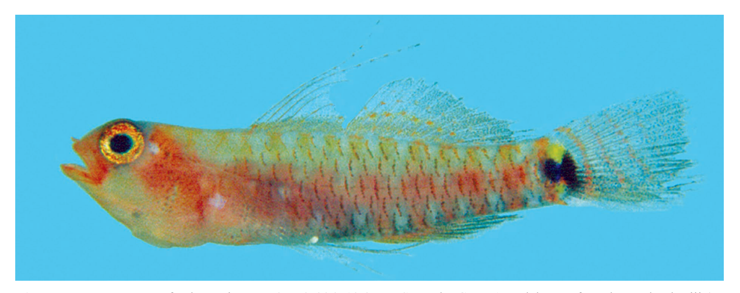
Figure 5. Eviota cometa , fresh specimen, ROM 45234, 13.8 mm SL male, Great Astrolabe Reef, Kadavu Island, Fiji (R. Winterbottom).

Color when fresh. (Figs. 2 & 5) Background color of head and body translucent gray; anterior margins of scales outlined with red-orange; 8 internal red-orange bars along body: first behind pectoral-fin base, second over