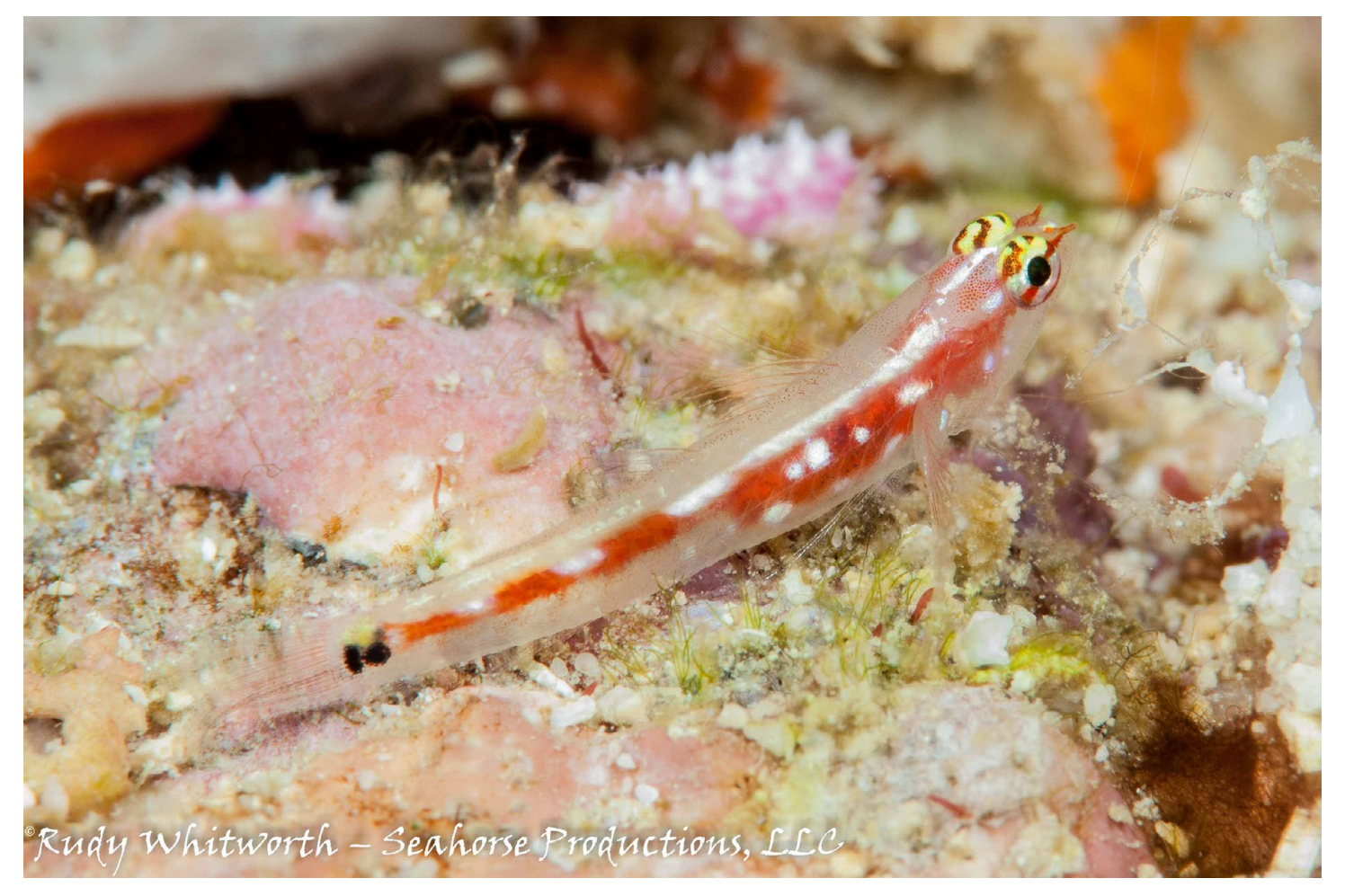
Figure 8. Eviota oculineata, Valu-i-Ra, Fiji (R.Whitworth).