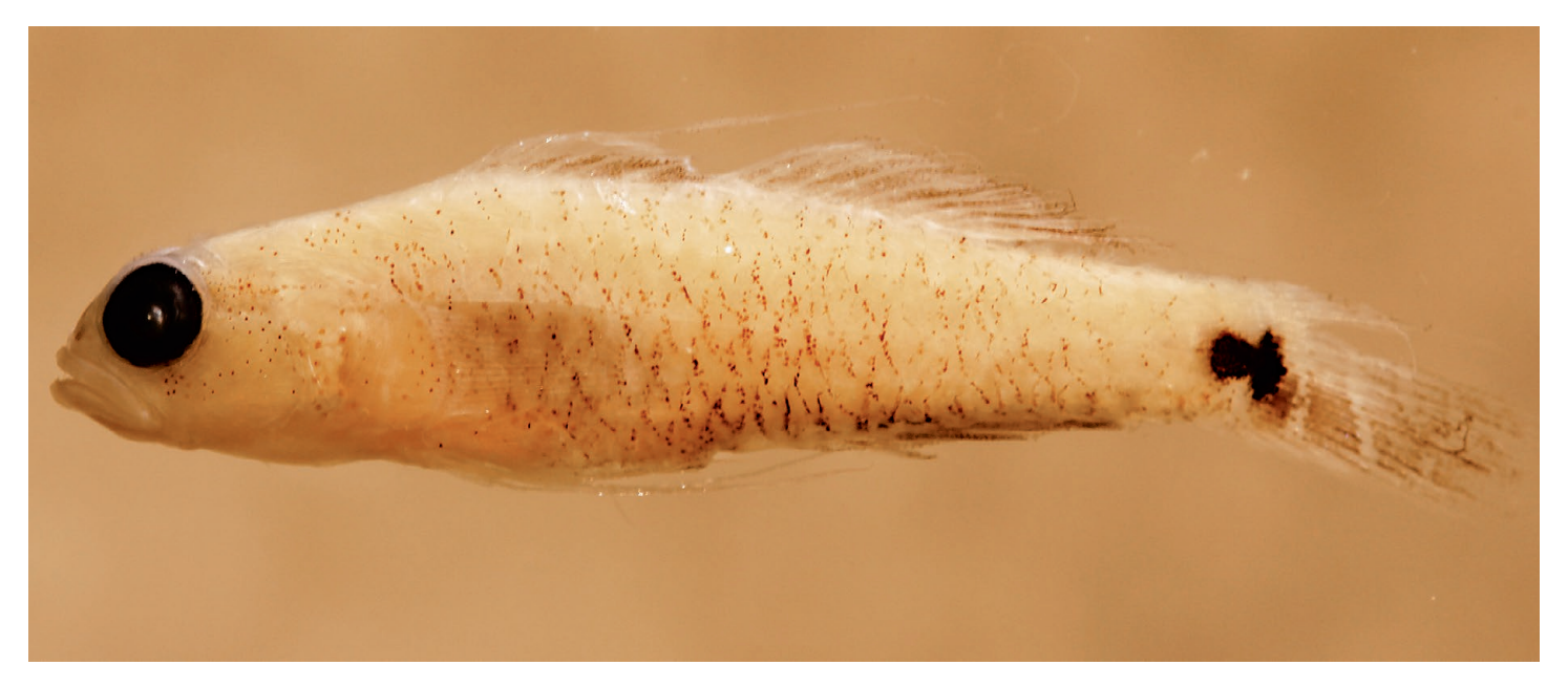
Figure 6. Eviota cometa, preserved specimen, CAS 228703, 15.7 mm SL male, Daveita Bay, Vanua Levu, Fiji (D.W. Greenfield).

abdomen, third at level of genital papilla, fourth at anal-fin origin, fifth at center of anal fin and split ventrally with one arm at center and other at end of fin, sixth behind anal fin, seventh on caudal peduncle, and eighth at caudal-fin base at basicaudal spot, forming postanal spots (not retained in preservative); bars brighter below midline, sixth, seventh, and eighth darkest and most obvious. Head with gray operculum with pinkish tinge, color extending to pectoral-fin base and along ventral abdomen; jaws and area under eye orange-red; preoperculum, snout, and underside of head reddish pink; entire iris is dark reddish from lateral view, pupil surrounded by a white ring. A two-part, black, basicaudal spot over preural centrum made up of a short, wedge-like, triangular front section connecting to a short, wide bar over end of hypural plate, with a yellow spot over nexus, and sometimes a blue edging around anterior portion. Pelvic and pectoral fins gray, dorsal and anal fins reddish, caudal fin gray and crossed by about 4 posteriorly slanting, thin, red, diagonal bars.