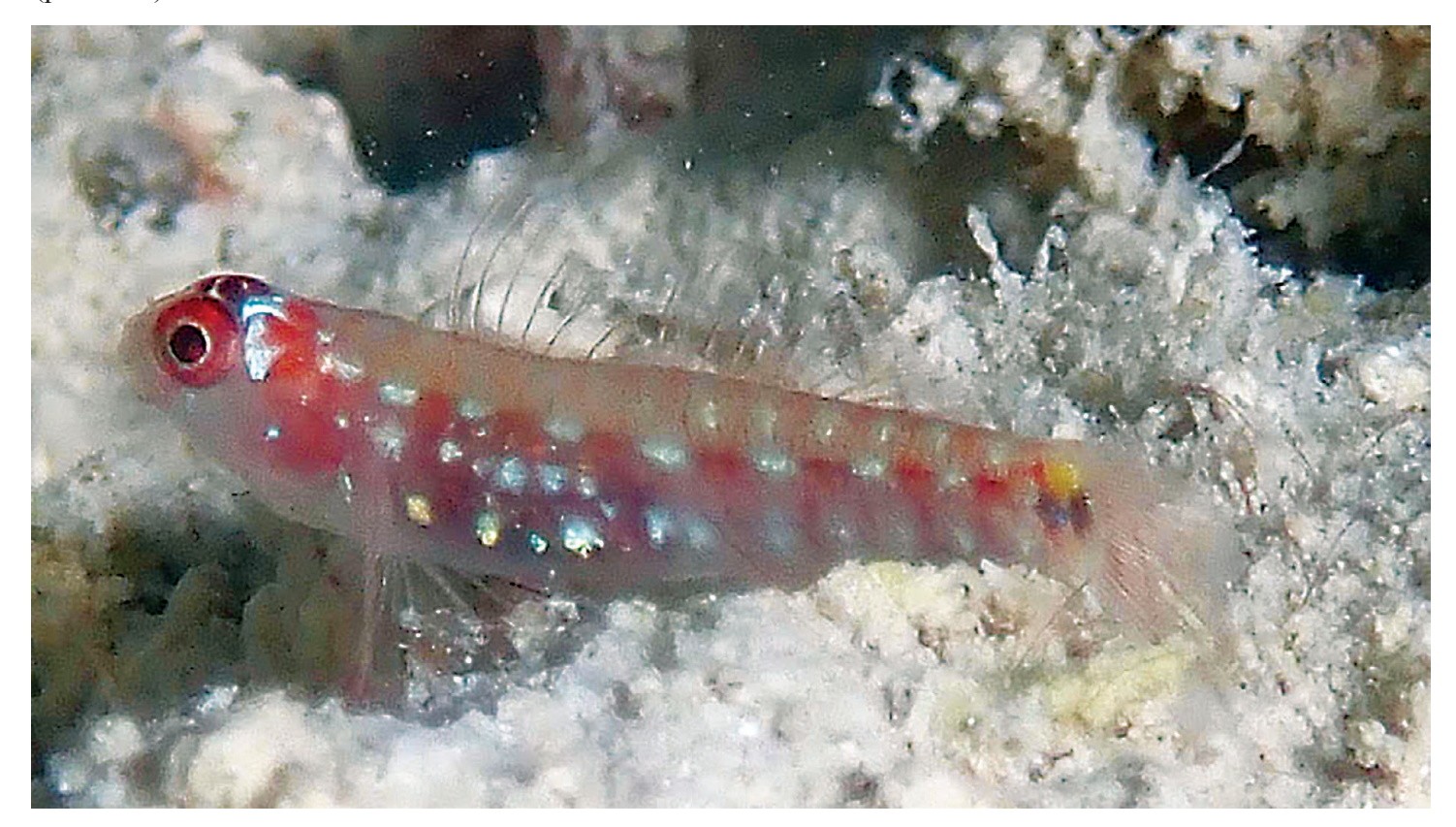
Figure 3. Eviota cometa, Samu Reef near Lautoka, Viti Levu, Fiji.

Description. Dorsal-fin elements VI+I,9, first dorsal fin triangular, second spine longest, filamentous, extending to eighth ray of second dorsal fin, all second-dorsal-fin soft rays branched except first, last ray branched to base; anal-fin elements I,8, all soft rays branched, last ray branched to base; pectoral-fin rays 15 (1), 16 (7), 17 (12), unbranched, reaching at least to fifth ray of second dorsal-fin; fifth pelvic-fin ray 5–17% (10%) of fifth ray, fourth pelvic fin with 3–6 branches, 2–3 segments between consecutive branches of fourth pelvic-fin ray, pelvic-fin membrane reduced and no basal membrane, reaching well past anal-fin origin; 11–12 branched and 17 segmented caudal-fin rays; lateral-line scales 22–24; transverse scale rows 7; urogenital papilla in male smooth, wide with straight sides, and short fringes at end (Fig. 4), urogenital papilla of female bulbous, with several short finger-like projections distally; front of head rounded with an angle of about 65° from horizontal axis; mouth slanted obliquely upwards, forming an angle of about 55° to horizontal axis of body; maxilla extending posteriorly to middle of pupil; anterior narial tube short, just reaching margin of upper lip; gill opening extending forward to below posteroventral edge of preoperculum; cephalic sensory-canal-pore system missing only IT pore (pattern 2).