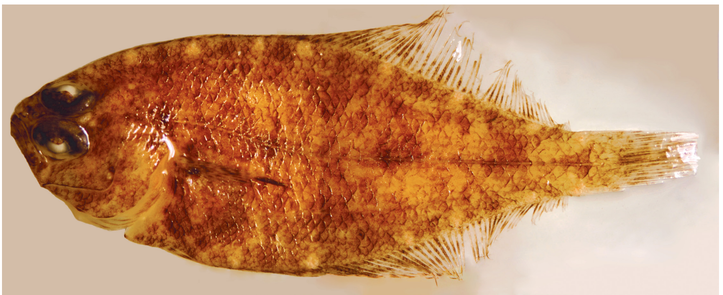
Figure 1. Citharichthys darwini , holotype, 33.3 mm SL, male, SIO 12-3075.

Paratypes. SIO 12-3076 (2) 33.4–39.1 mm SL, same as holotype; LACM 57426-1 (1) 32.7, same as holotype; LACM 23671 (8) 33.4–42.4 mm SL, Ecuador, Galápagos Islands, Isla Isabela, Tagus Cove (-0.26°, -91.37°), Allan Hancock Expedition, prob. Jan. 13–15, 1934 (in LACM catalog as Jan. 10, but the Expedition was in transit and only arrived in Galápagos on Jan. 11 according to the Fraser (1943) itinerary); CAS 6895 (5) 20.8–49.3 mm SL, Ecuador, Galápagos Islands, Isla Isabela, Tagus Cove (-0.26°, -91.37°), Allan Hancock Expedition, Jan. 15, 1934; CAS 6862 (8) 19.3–50.2 mm SL, Ecuador, Galápagos Islands, prob. Isla Isabela, Albemarle Point (0.15°, -91.38°), Jan. 12, 1934 (in CAS catalog as “Charles Island, Jan. 12 1934”, but the expedition did not reach Charles Island (Floreana) until Jan. 16, 1934 (Fraser 1943), on Jan. 12 the expedition was at Albemarle Pt. and the Field Number in the catalog is, appropriately, HE 12-I-1934); USNM 101970 (4) 48.8–59.6 mm SL, Ecuador, Galápa-