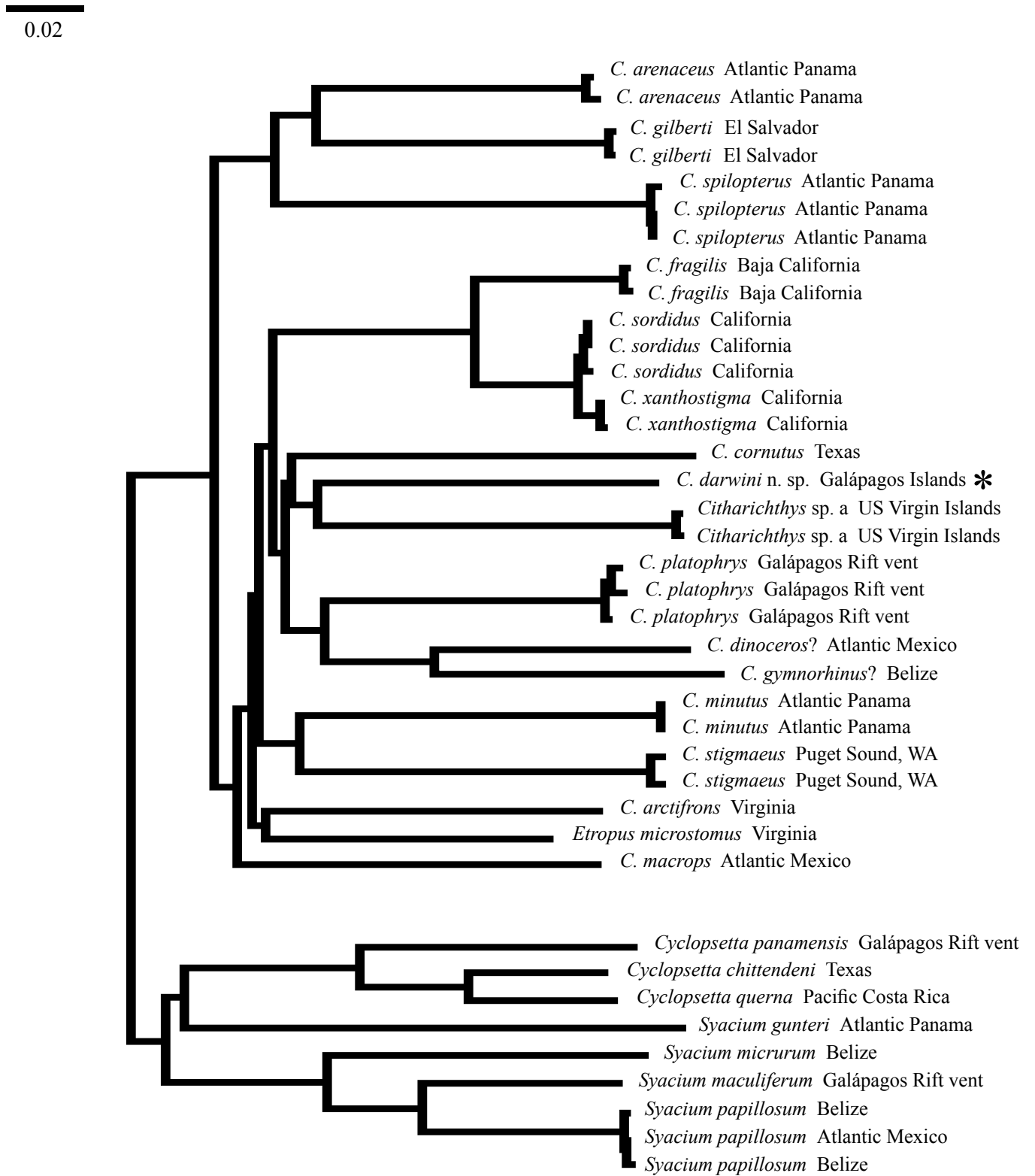
Figure 7. The neighbor-joining tree based on the COI mtDNA sequences of New World Citharichthys , Etropus , Cyclopsetta , and Syacium (the Cyclopsetta group of paralichthyid flatfishes), following the Kimura two-parameter model (K2P) generated by BOLD (Barcode of Life Database). The scale bar at left represents a 2% sequence difference. Collection locations for specimens are indicated and C. darwini is highlighted with an asterisk. GenBank accession numbers and collection data corresponding to the sequences in the tree are listed in Appendix 1.