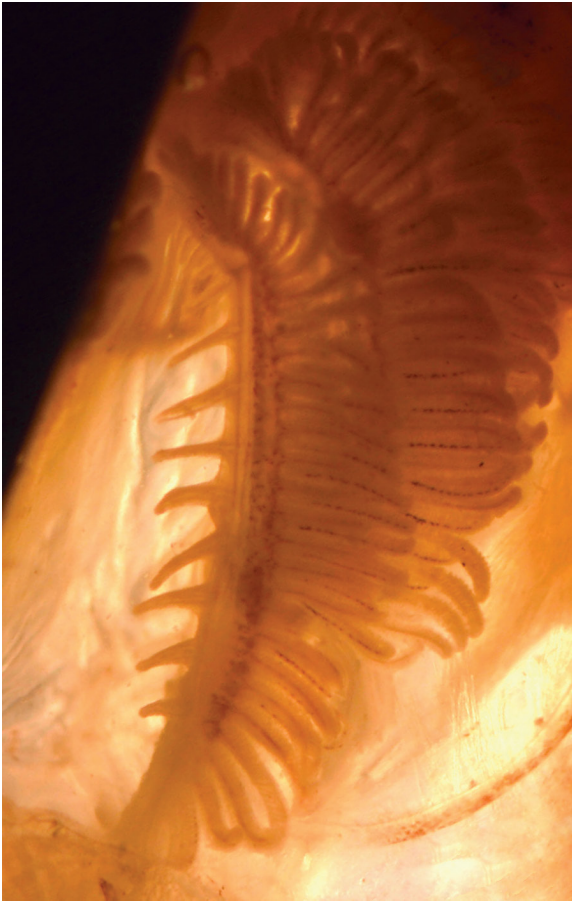
Figure 4. Citharichthys darwini , slender gill rakers on first arch.

Gill rakers on first arch medium-length and slender, without serrations, longest about half pupil diameter; upper limb 4–7, mode 6; lower limb (including rudiments and corner) 8–10, mode 10 (rare 8); total 12–17, mode 15 (Fig. 4).