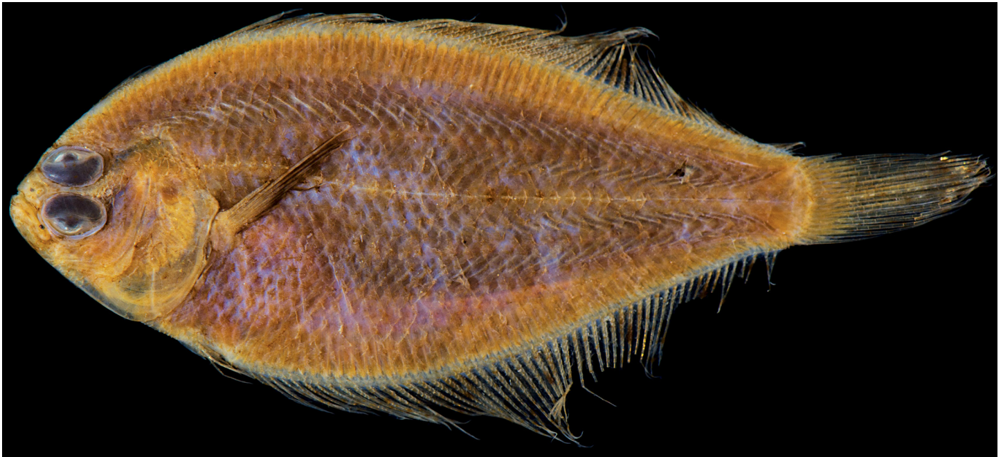
Figure 6. Etropus delsmanni pacificus holotype, ZMUC P-853137, Islas Perlas, Panama.

the preoperculum, resulting in a distinctly wider head. These morphological differences can be quantified as follows ( E. delsmanni pacificus vs. C. darwini respectively): first, the upper jaw length is less than the orbit diameter and much less than the horizontal span from the corner of the preoperculum to the edge of the operculum vs. equal or greater; and second, the body width at the end of the head is 39–43% SL (vs. 31–37%) (Fig. 6). In addition, E. delsmanni pacificus is slightly wider (on my measure from photographs of 4 types and a new specimen, USNM 383307) with a maximum body width from 43–46% SL (vs. 39–42% SL in the same size range), has fewer gill rakers (6–8 lower limb vs. 8–10), and does not have the sharp change in scale size near the body edges. They also appear to have deciduous scales and are found in deeper (45m) mud sediments along the coast of South America (Nielsen 1963). E. ciadi can be quickly distinguished by a wider body (>50% SL) and obviously deciduous scales (van der Heiden & Plascencia Gonzalez 2005).