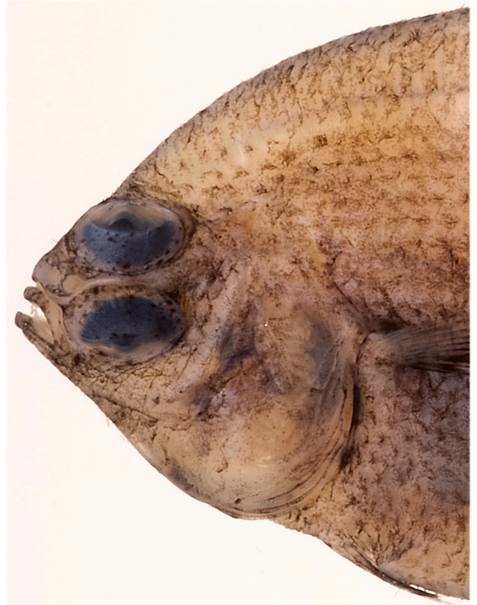
Figure 5 (right). Etropus delsmanni pacificus , USNM 383307, Coiba, Panama.

Among the eastern Pacific Etropus , both E. ciadi , with D 66–79 (mode 73) and A 52–62 (mode 57), and E. delsmanni pacificus , with D 71–77 (mode 75) and A 53–62 (mode 58), overlap the fin-ray counts for C. darwini (van der Heiden & Plascencia Gonzalez 2005 and Nielsen 1963, respectively). E. delsmanni pacificus differs in the generic character of a smaller mouth (24–30% HL; Nielsen 1963), along with a pronounced indentation in the anterior cranial margin overlying the short upper jaw (Fig. 5). The dorsal profile rises more sharply and the operculum is expanded to cover more of the cheek than