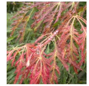
Acer 'First Flame'