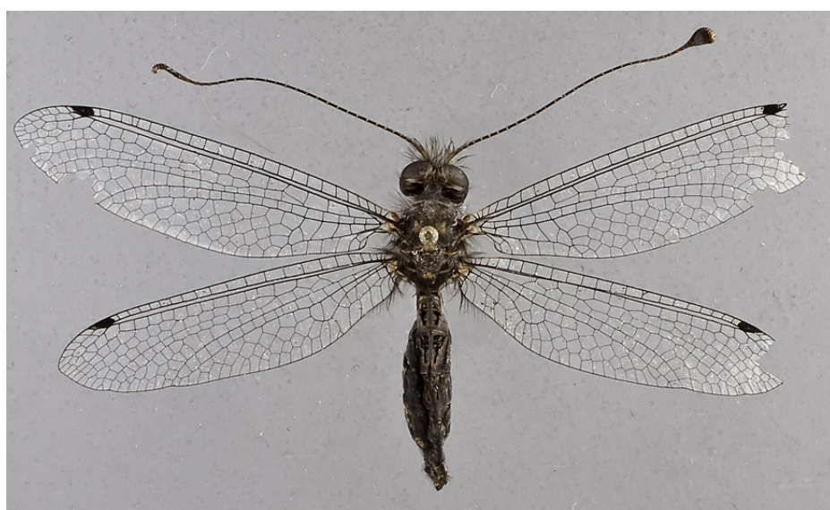
Figure 1. Oregon Gulch Specimen (deposited at OSAC).

Owflies are interesting members of the Neuroptera in the family Ascalaphidae. Owlflies as larvae and adults are predators. In appearance, larval owlflies are similar to larval antlions, while, as can be seen from the accompanying figures, adult owlflies look rather like a cross between a small dragonfly and a butterfly. The adult body and wings of North American species are odonate-like while the antennae are long and knobbed, similar to those of butterflies. The eyes of adult Ululodes owlflies are split into two parts by a lateral groove, which is just visible in Figure 3. Dragonfly-like in flight, adults in North America tend to fly only for a short period in the early evening and can be attracted to lights. At rest on vegetation, Ululodes owlflies adopt a distinctive posture (Figure 3)—hanging upside down on bare branches.