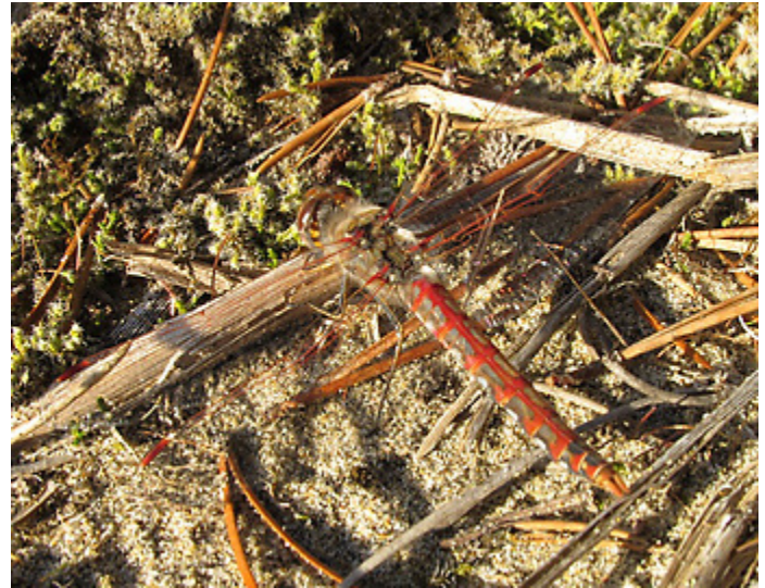
A male Sympetrum corruptum , Variegated Meadowhawk, at Waldport, Lincoln Co., Oregon, 9 December 2011.

Based on the limited data available at this time, one could jump to the conclusion that wintertime meadowhawks are increasing in western Oregon—perhaps thanks to global climate change. Only time and more data points will tell. The number of aware observers has certainly increased too, so this must also be taken