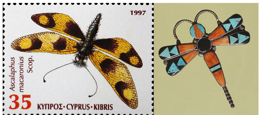
Figure 4. Left, postage stamp from Cyprus. Right, Native American "dragonfly" pin.

On the lighter side, owlflies have made it onto postage stamps from Cyprus and the former Yugoslavia. Interestingly both countries featured the same species, Ascalaphus macaronius Scopoli (Figure 4, left). In an exchange in Ornament magazine, Lyons (2005) discussed with Ornament Coeditor Robert Liu the possibility that some Native American southwestern "dragonfly" jewelry (Figure 4, right) was actually inspired by owlflies. Some followup comments were added by Kuehn (2005).