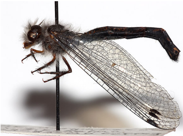
Figure 2. Selma Specimen (deposited at SOU).