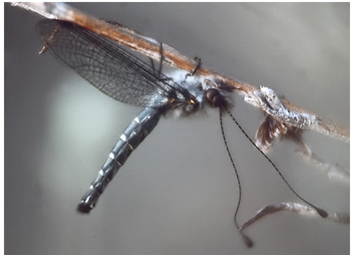
Figure 3. Ululodes mexicanus resting on vegetation; Torrey Pines State Reserve extension, San Diego County, California 1992 June 29.

In the United States, owlflies are generally considered insects of the southern tier of the country. While rarer farther north, the distribution of one, U. quadripunctatus , does reach up the eastern states and into Ontario Canada. Shetlar (1977) lists two species from California, Ululodes arizonensis and U. bicolor . In his specimen list there is a male specimen under Ululodes arizonensis with the details Siskiyou Co. — Ft. Jones, B. L., 19-viii-69, M. Grifantini (PU). Fort Jones is only a few miles SW of Yreka, California. (This specimen location is not shown on the distribution dot map.) Yreka is not far from the Oregon