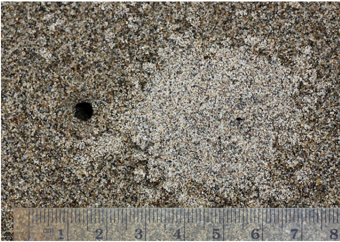
Figure 7: A recently excavated burrow with the excavated material forming a pile on the right. (Oregon, Coos County, New River Area of Critical Environmental Concern, Lost Lake Section, 31 March 2013).

to late afternoon when the area was exposed to direct sunlight. While some holes were closed (deliberately plugged, or plugged by drifting sand, storms, or animal activity), I found open holes and evidence of activity in the form of sand disturbance or hunting larvae throughout the winter. Two instars were active. On 7 March 2014, I found my first adult of 2014 a short distance from the plot I was monitoring. Both larval instars were also active on that day.