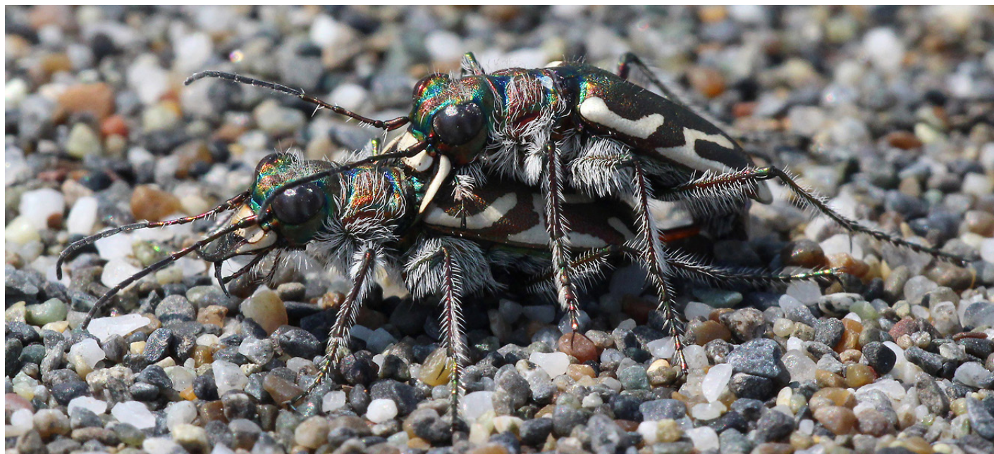
Figure 1: Mating pair of Cicindela bellissima (Oregon, Curry County, Pistol River dunes, 2 August 2013).

Pearson et al. (2006; source for all the common names) provided information and distribution maps for the 109 species known from the United States and Canada. Based on their distribution maps, 22 species occur in Oregon: 4 in the genus Omus (night-stalking tiger beetles), the rest in the genus Cicindela (common tiger beetles divided among 5 subgenera: Cicindela [temperate], Tribonia [tribon], Cicindelidia [American], Cylindera [rounded-thorax], and Ellipsoptera [ellipsoid-winged]). One of these, Cicindela columbica (Columbia River Tiger Beetle), is no longer found in Oregon. Only one species, Omus cazieri (Mount Ashland Night-stalking Tiger Beetle), is known solely from Oregon. There are a couple of additional species that may be present. A number of species have