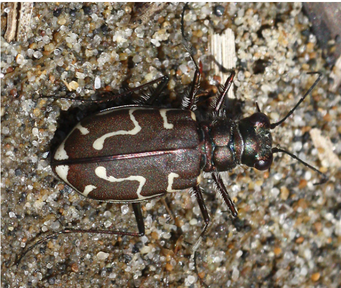
Figure 2: Cicindela hirticollis (Oregon, Coos County, along New River, 9 May 2009).