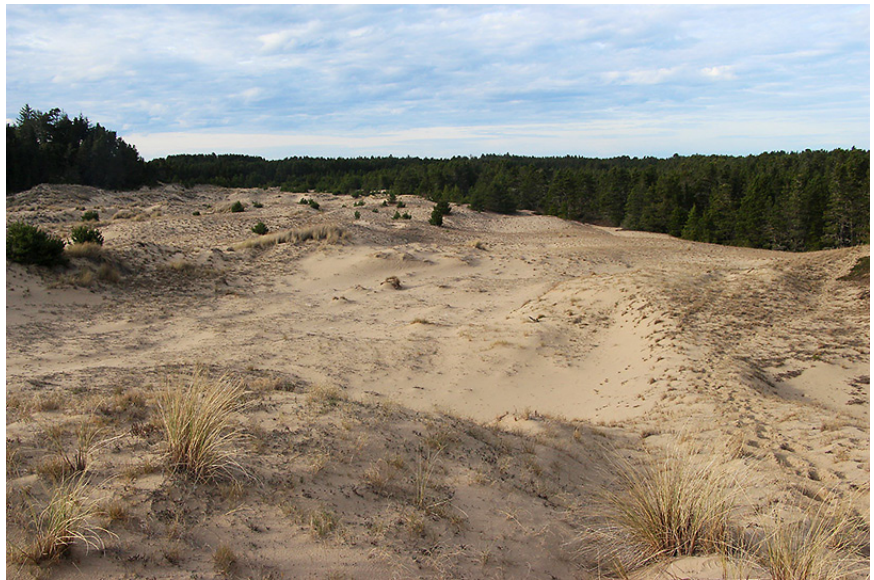
Figure 5: Oregon, Coos County, Oregon Dunes National Recreation Area west of Bluebill Lake, looking north across the open dune habitat. There is a sand road which runs along the tree line on the right. A narrow path curves along the right hand side. I monitored the activity in and around a small plot near the grassy mounds in the middle of the photograph. While the entire area is open to public activity (mainly hiking, jogging and dog-walking), I went in and out the same way to minimize my disturbance.

The only published account of the life history of Cicindela bellissima is a preliminary study by Maser (1973) carried out in the