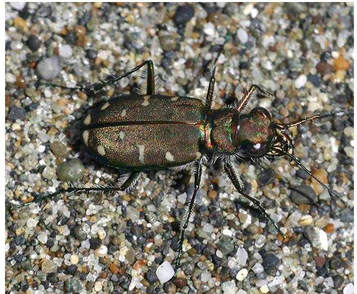
Figure 3: Cicindela oregona (Oregon, Curry County, Cape Blanco, 1 June 2008).

been divided into named subspecies, and in some cases, more than one subspecies occurs in Oregon.