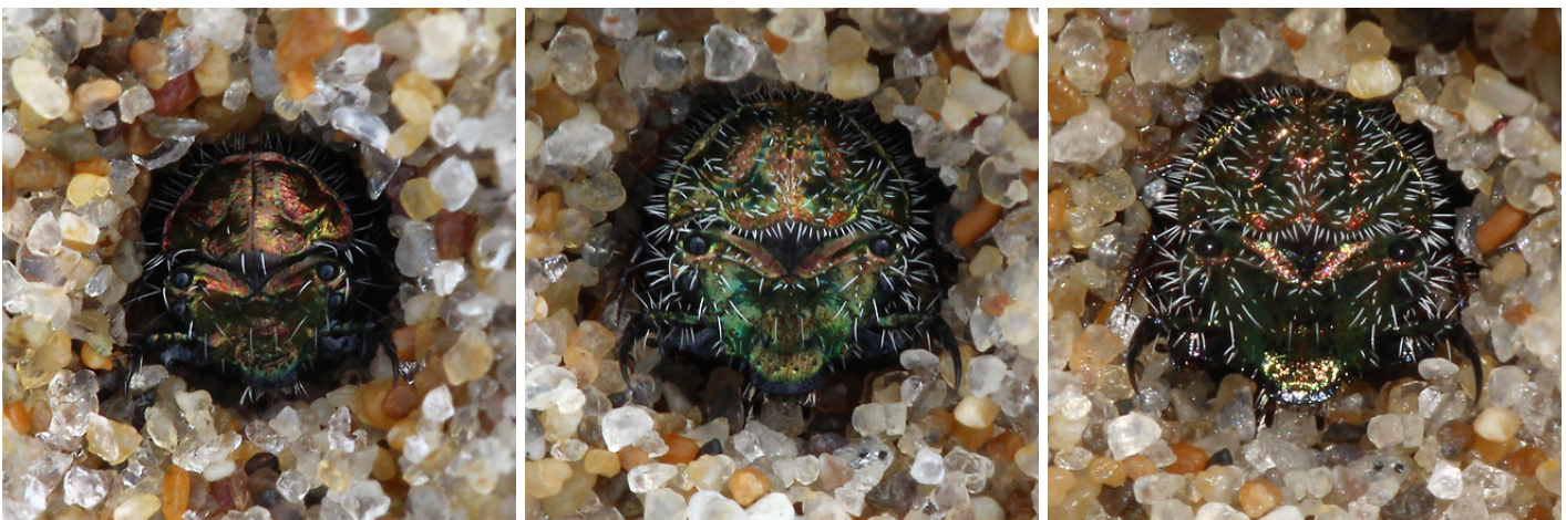
Figure 8: (left) Cicindela bellissima larvae in its burrow (instar 2). Note the ridge-like features and shading of the first thoracic segment and the number and distribution of the setae. The mandibles are outstretched. (Oregon, Coos County, Oregon Dunes National Recreation Area west of Bluebill Lake, 17 November 2013). (middle and right) Cicindela bellissima larva in its burrow (instar 3). The change in appearance is due to the use of the on-camera flash in the right image. Although the color pattern is different from the larva shown at left, the features and shading on the first thoracic segment are similar. However, the setae are more numerous and distributed differently. The relative lengths of the various setae are in part at least a function of their orientation relative to the camera. On the left hand side, you can make out one leg against the sand grains. (Oregon, Coos County, Oregon Dunes National Recreation Area west of Bluebill Lake, 17 November 2013).

There are similar structural features on the dorsal area of the first thoracic segment on both instars as evident from the color and shadow pattern. There is a central suture that splits the segment