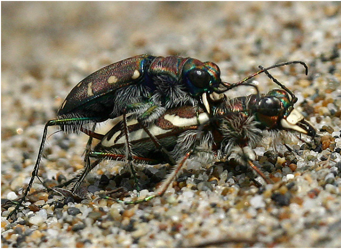
Figure 6: Oregon, Coos County, New River Area of Critical Environmental Concern, Storm Ranch Section, sandy slope just north of New River boat launch, 27 April 2008. Male Cicindela oregona attempts to mate with what looks like a male C. bellissima .

a specimen collected at Newport in Lincoln County, Oregon on 4 January 1981 by C. Maser (OSAC# 138754).