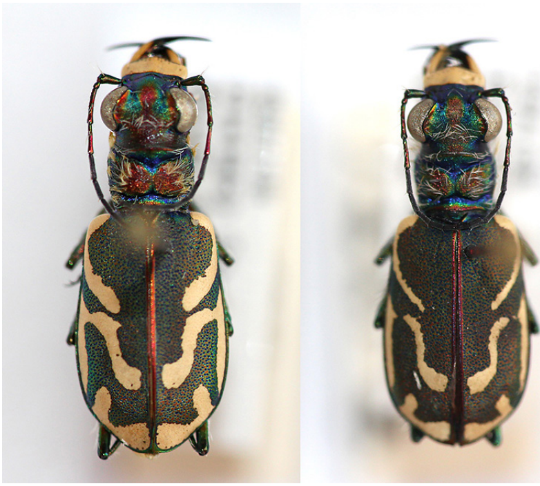
Figure 4: Elytral pattern of Cicindela bellissima . The specimen on the left exhibits wide markings common on most specimens (irregularities in the borders of the markings are specific to the individual specimen shown); the specimen on the right exhibits narrow markings which are much less common. (OSAC specimens from Clatsop County, Oregon).

range into California shown on the distribution map illustrated in Pearson et al. (1997). (This map shows the range extending a bit farther south than it should, perhaps because it was hard to illustrate a point only a few miles south of the border on the scale of the illustration.) There are two additional records from the Crescent City area that I know of. Dana Ross told me that he had seen C. bellissima in the Tolowa Dunes State Park area while doing butterfly surveys several years ago. On 21 June 2013, I photographed C. bellissima in the south section of Tolowa Dunes State Park.