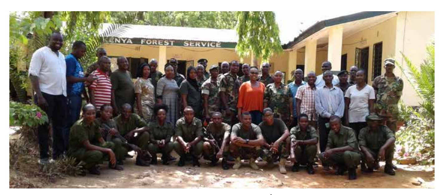
Kenya Forest Service training on low-cost forest monitoring.