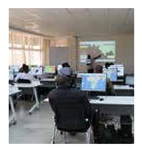
Opening session and training on GIS and remote sensing technology for forest monitoring and management.