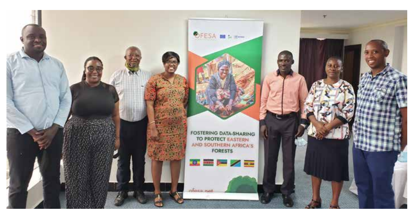
OFESA Tanzania country workshop.

Since 2020, the Forest Observatory of East and Southern Africa (OFESA), an ongoing project led by the Center for International Forestry Research (CIFOR), has been working on an up-to-date and reliable system to help countries monitor and report on their climate obligations. To that end, CIFOR is developing a sustainable data-sharing governance framework and building capacity in the management and use of environmental information.