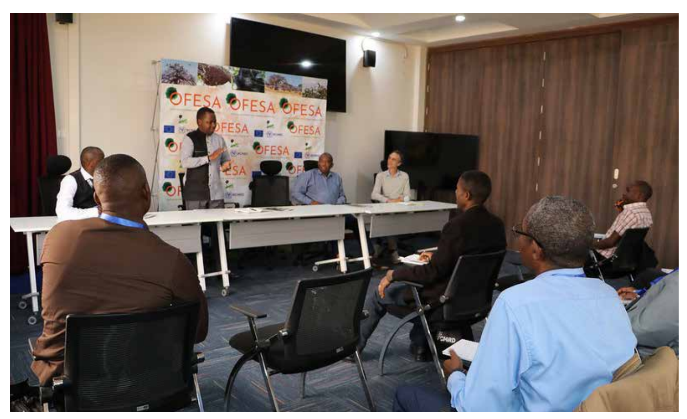
Opening session on the use of GIS and remote sensing technology for forest monitoring.