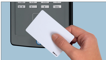
WITH RFID BADGE READER