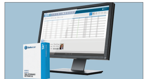
SAFESCAN TA SOFTWARE INCLUDED