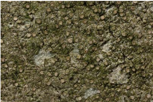
Ionaspis alba .

Lecanora caesiorubella Ach. ranges across much of the continental U.S. It is found on bark, mostly of deciduous and evergreen angiosperm trees. The specimen shown below was collected November 15, 2015, on recently cut firewood from Ray Showman's property in Vinton County.