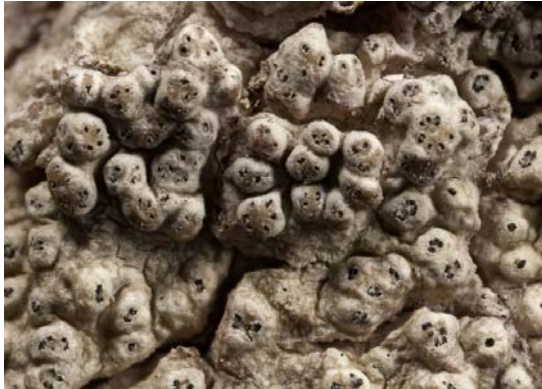
Pertusaria pustulata . Photo by Bob Klips

trunk of a hardwood tree in a parking area in Hocking County.