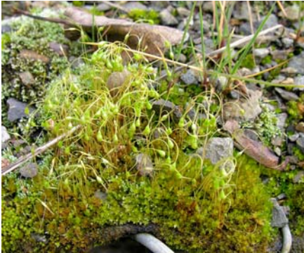
Funaria hygrometrica .

this forest: Funaria hygrometrica and Marchantia polymorpha .