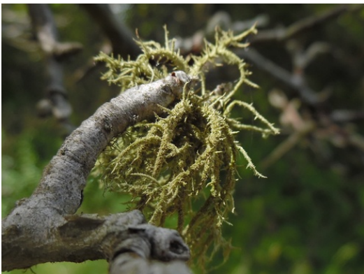
Usnea hirta at Liberty Park, 6/10/2016