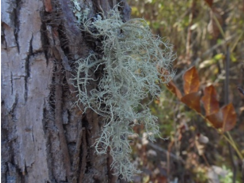
Usnea dasaea at West Branch State Park, 10/28/2016