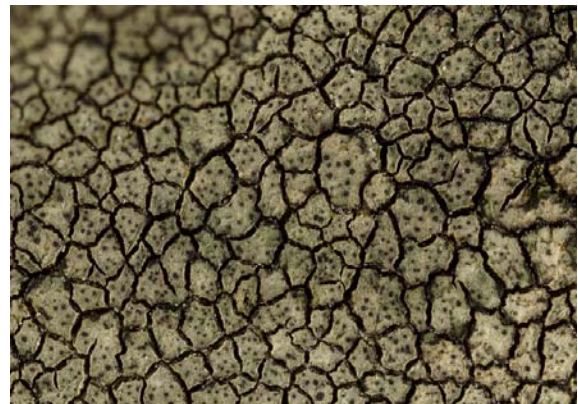
Placopyrenium fuscillum .

The "wart lichens" (genus Pertusaria ) bear apothecia in fruiting warts opening on the surface with one or more small openings (osteoles). The example below is Pertusaria pustulata , seen on the