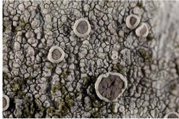
Lecanora caesiorubella .

Lecanora caesiorubella Ach. ranges across much of the continental U.S. It is found on bark, mostly of deciduous and evergreen angiosperm trees. The specimen shown below was collected November 15, 2015, on recently cut firewood from Ray Showman's property in Vinton County.