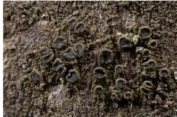
Maronea polyphaea.