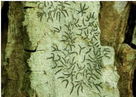
Graphis scripta .

The ascomata of the “script lichens” are elongate and sometimes branched. They do indeed look like writing. One species is very common on tree trunks in Ohio. This is Graphis scripta . The specimen below is from Franklin County.