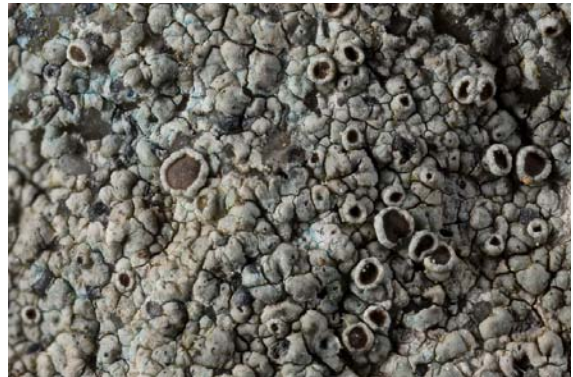
Lecanora cenisia .

Lecanora cenisia Ach. ranges widely across the U.S. but is much more common in the west. It occurs on siliceous rocks. The Ohio specimen was collected June 6, 2016 from a vertical sandstone ledge at Lookout Rock in Zaleski State Forest, Vinton County.