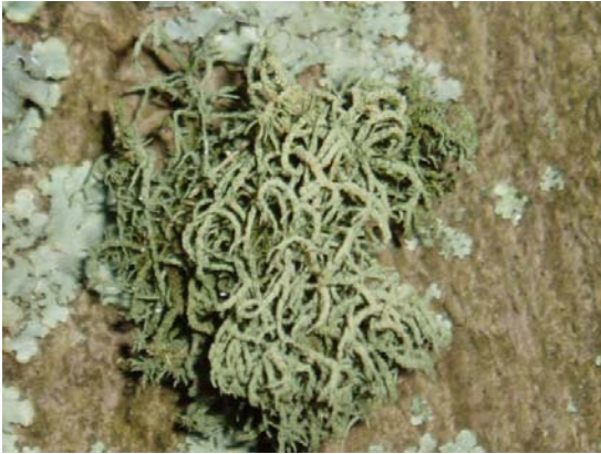
Usnea substerilis , recently found in Ohio.

species of Usnea have been recently found in the state.