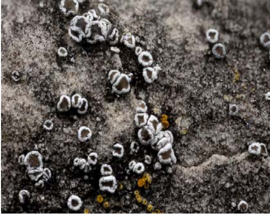
Lecanora dispersa .