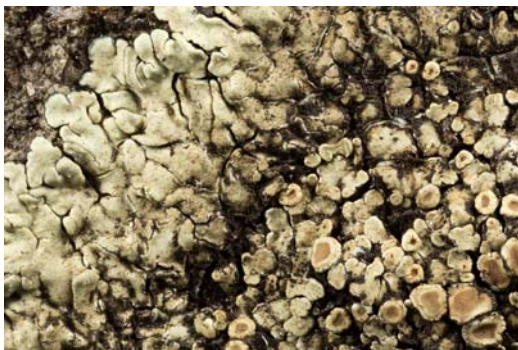
Lecanora muralis at Greenville Falls.

River Area, where it was growing on a flat limestone rock in a meadow, and October 1, 2016 during the OMLA Fall Foray at Garbry Big Woods Sanctuary, where it was growing on a concrete curb in the parking lot. While there, OMLA member Tomás Curtis mentioned having seen this species growing more abundantly in northeastern Ohio, so there are likely to be some Ohio specimen records for this striking species.