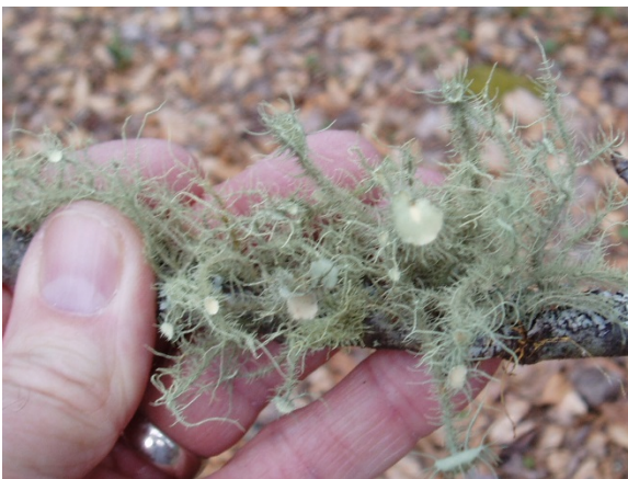
Usnea strigosa with apothecia.

Most Ohio species are fairly uncommon, several represented from only one county. The most common species is Usnea strigosa , the bushy beard lichen, with records from 22 counties. It is easily recognized by the lack of isidia or soredia and the numerous small perpendicular branches (fibrils). More mature specimens frequently have apothecia.