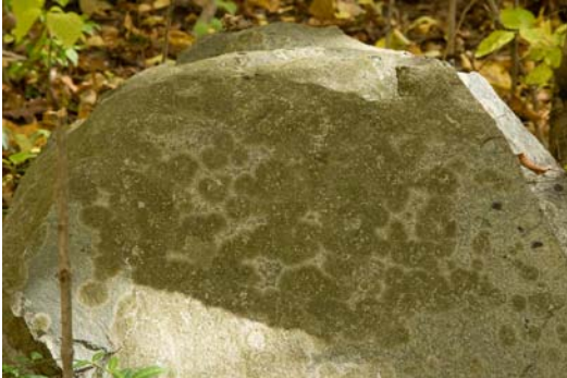
Ionaspis alba substrate.