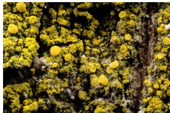
Candelariella xanthostigmoides.