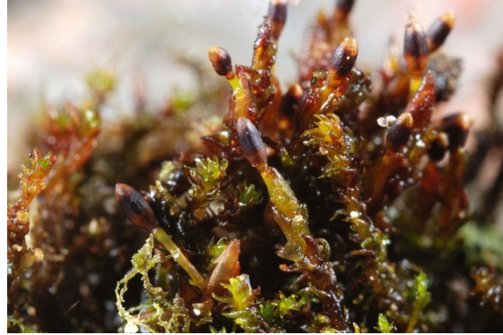
Reddish-brown plants of Andreaea rupestris , showing the oval capsules.

According to Zander, in Volume 27 of the Flora of North America, A. rupestris is found at latitudes north of Ohio.