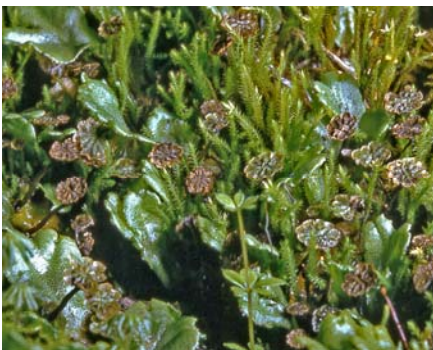
Marchantia polymorpha .

Both of these early bryophyte colonizers are commonly found in Ohio. Funaria hygrometrica is called water-measuring cord-moss, and has been known to inhabit burned areas as well as newly exposed soils, particularly farmland. Marchantia polymorpha is a tongue-shaped flattened thallose liverwort that is known for its weed-like attributes that allow it to occupy nursery flowerpots (OMLA 2016).