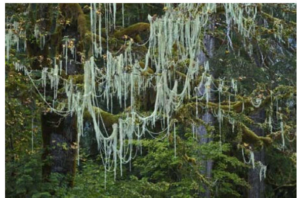
Usnea longissima in the Pacific Northwest.

Several Usnea species are represented by only a single old record and are probably extirpated from the state (see The Macrolichens of Ohio for more details). One of these, Usnea longissima , is particularly dramatic. It is a pendulous lichen which, as the name implies, can be long – up to 3 meters! The Ohio specimen is from the Lea collection (ca. 1840, Hamilton County) and I consider the location questionable, but who knows?