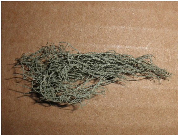
Usnea ceratina .

Last winter while cutting firewood from a red maple that had fallen in the edge of my yard, I noticed several Usnea lichens on the upper trunk. One in particular looked different from the now widespread Usnea strigosa , so I collected it for identification. It turned out to be Usnea ceratina , a fairly common Smoky Mountain species.