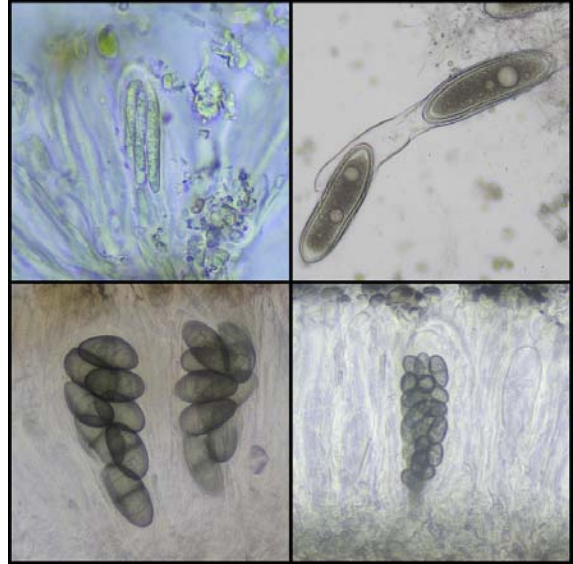
Crustose lichen asci with spores.

Following are some variations in spore characteristics showing (clockwise from upper left): Long narrow spores of Bacidia granosa ; very large spores, two per ascus, of Pertussaria plittiana ; sixteen spores per ascus of Amandinea polyspora ; dark 2-celled spores of Rinodina tephraspis .