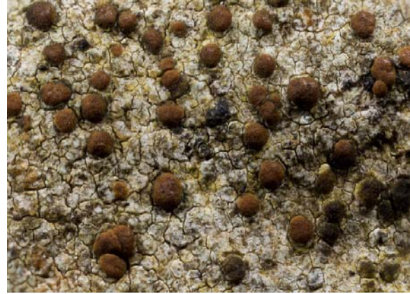
Protoblastenia rupestris .

The two other principal apothecium types are less distinctive than the lecanorine type, as in them the margin doesn't appear very much different than the central portion of the apothecium. A "lecideine" apothecium has a dark, somewhat carbonized outer layer lacking algae, while a "biatorine" one lacks a distinctive outer layer altogether. These features, best seen in cross-section, can only be dimly perceived in the portrait style images below. Exhibiting the lecideine type, Lecidella stigmatea was found on a small rock in a meadow in Delaware County, while the Protoblastenia rupestris , exemplifying a biatorine apothecium, was captured on a similar substrate in Montgomery County.