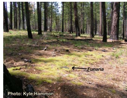
Funaria hygrometrica in burned forest.

To help protect bryophyte communities already established in these managed forests, Wiley and McCarthy (2013) recommended the use of thinning before burning when possible. Unlike burning that adversely alters bryophyte habitat, thinning may serve to improve habitat over time through the addition of new substrates (i.e. downed trees), especially for corticolous species. If burning must occur, avoiding dry areas and rock outcroppings is also advised as these support bryophyte communities less capable of tolerating such disturbances.