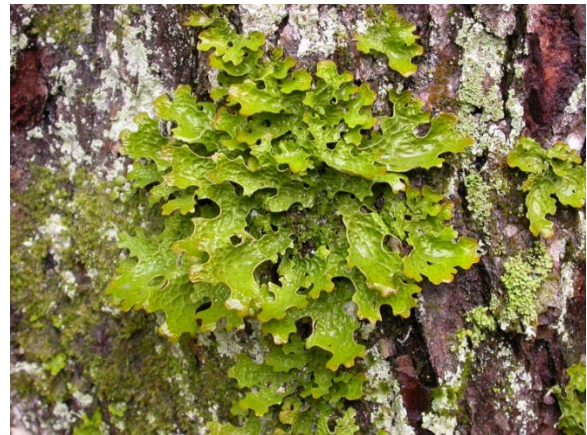
Lobaria pulmonaria.

The first WANTED ALIVE – article, featuring the Lungwort lichen Lobaria pulmonaria , was run in the 2007 issue of OBELISK . We have many new members since then, so I thought I would rerun the article, in hopes that someone would find an extant population in Ohio.