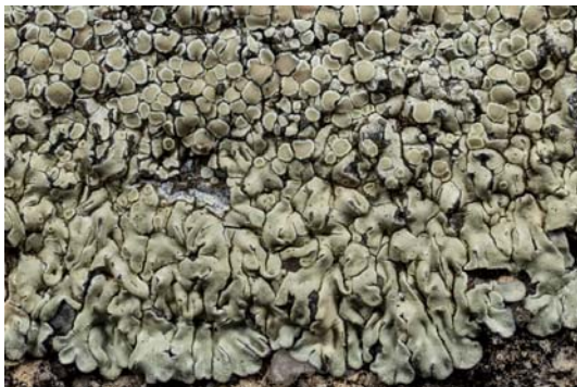
Lecanora muralis at Garbry Big Woods Sanctuary.