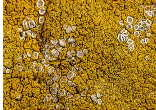
Caloplaca citrina .

growing on an old limestone fence in Franklin County.