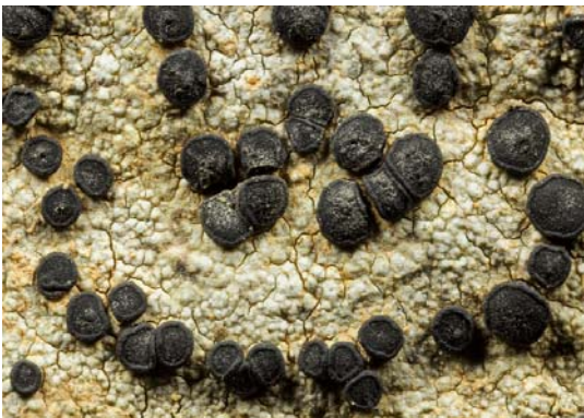
Lecidella stigmatea .

Among the several categories of crustose lichens other than the typical disk lichens are those with ascomata that are flask-shaped "perithecia." These perithecia sometimes present themselves as spots projecting slightly above the thalline tissue within which they are mostly buried. Below, see Placopyrenium fuscillum , a lime-loving lichen from a rocky bluff in Miami County.