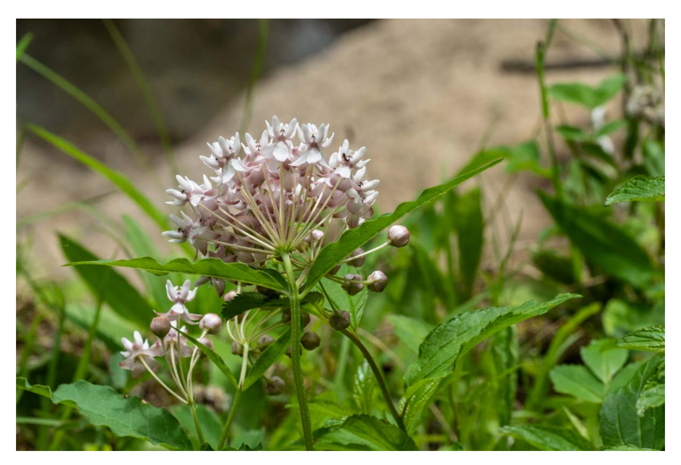
Four-leaved milkweed is the first of Ohio's 13 Asclepias species to flower.