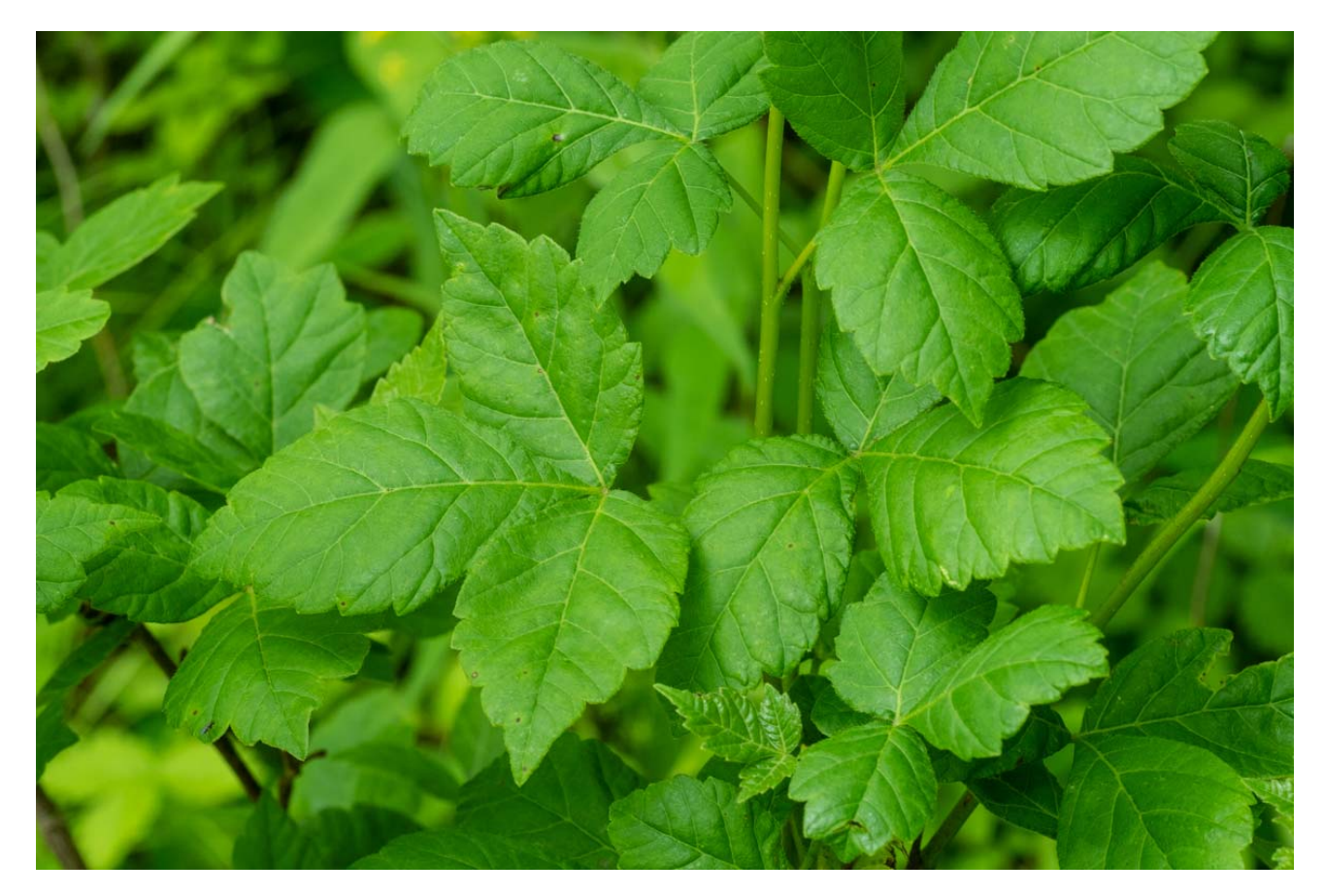
Fragrant sumac is a trifoliate shrub related to poison-ivy.

Toxicodendron radicans (L.). Kuntze poison-ivy. Native vine. CC=1. Common and abundant in the woods. The name " Toxicodendron " is from the Greek, meaning "poison tree."