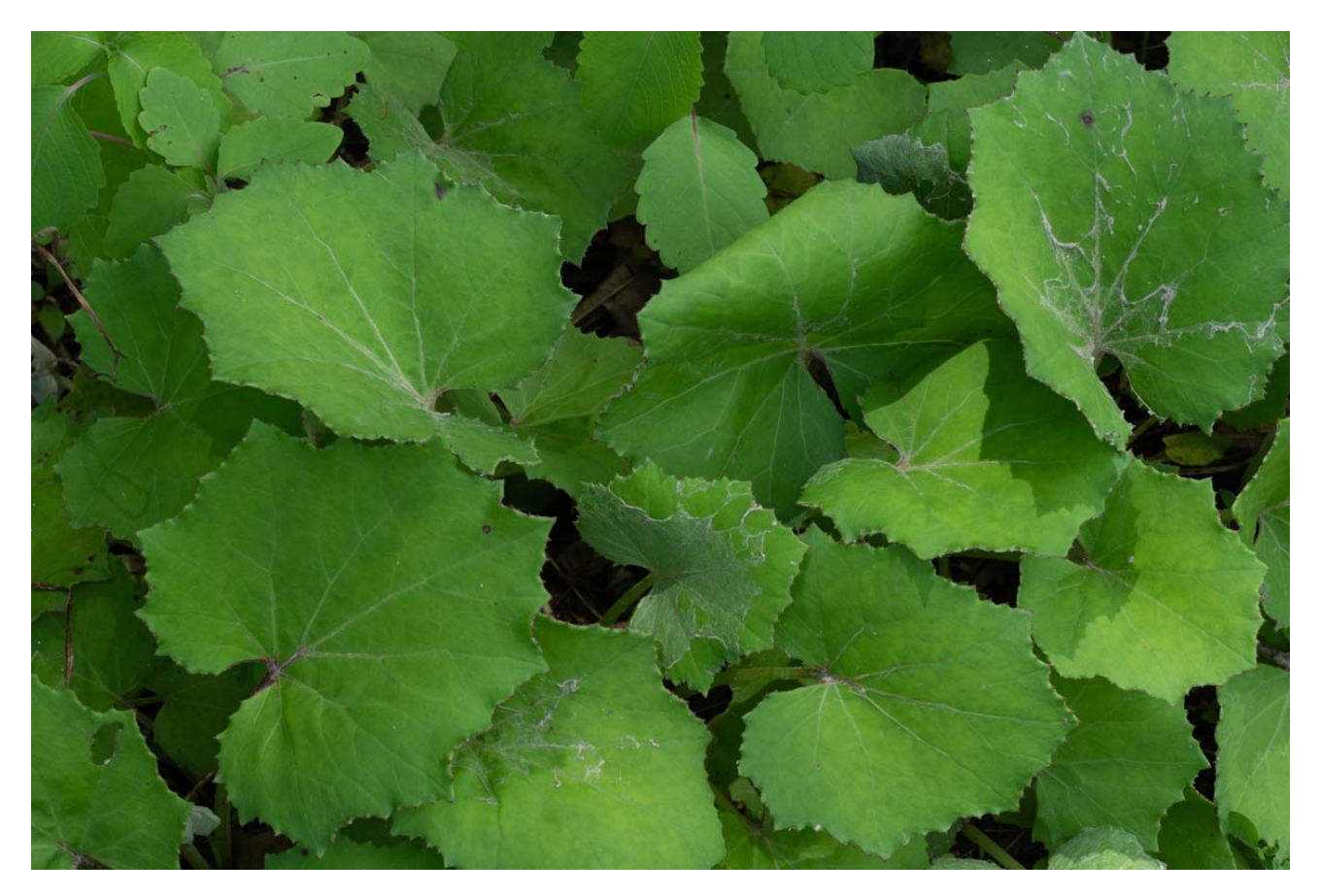
Coltsfoot leaves bear a whimsical resemblance to colts' feet, don't they?