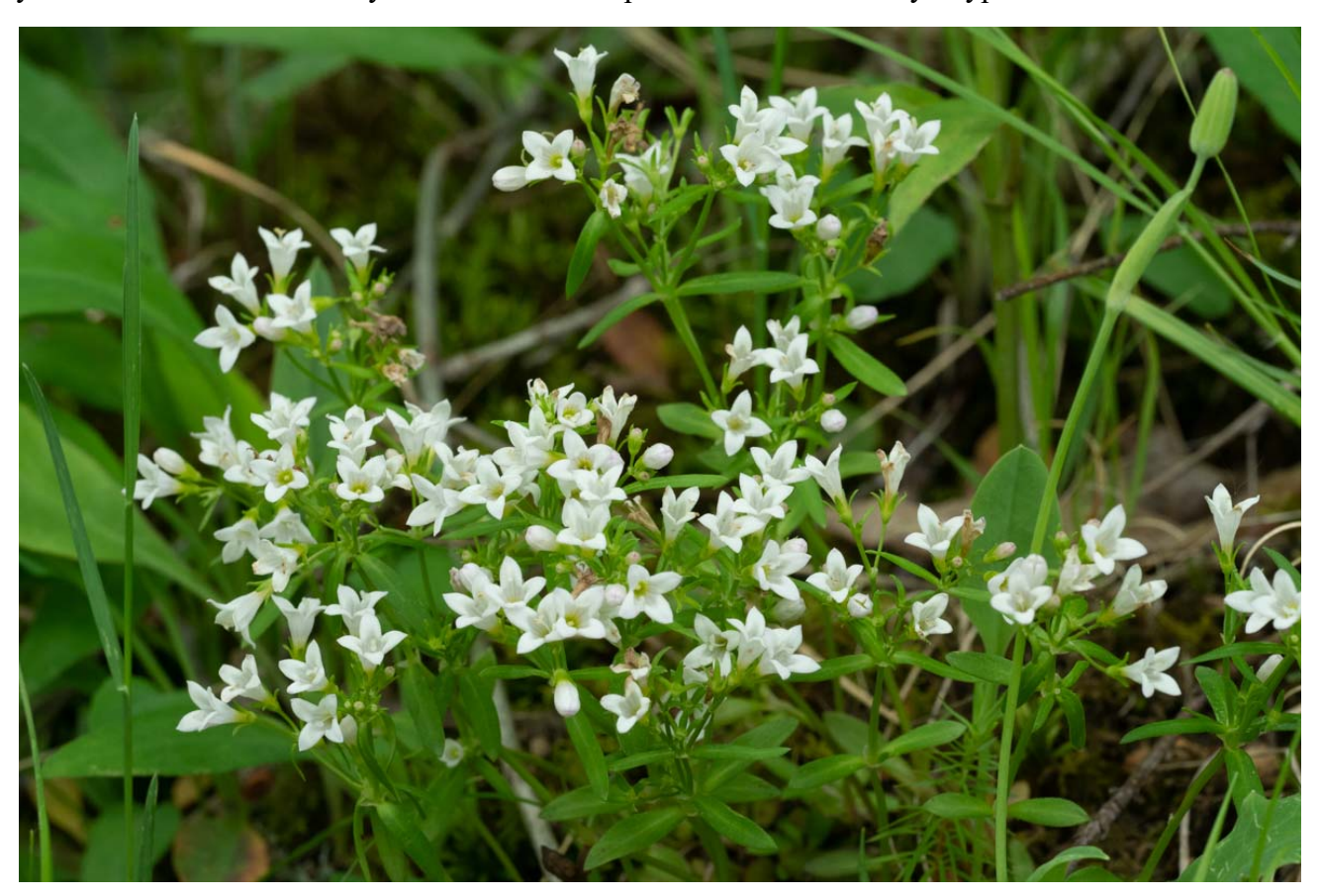
Canada bluets is a heterostylous wildflower.

Hedyotis canadensis (Willd. Ex Roem & Schult.) Fosberg. Canada bluets. Native forb. CC=6. Abundant on the bluff. Bluets are heterostylous, with each plant producing either long-styled flowers or short-styled ones. Pollination is only effective between plants with different style types.