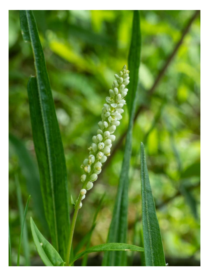
Seneca snakeroot has 2 petal-like sepals.