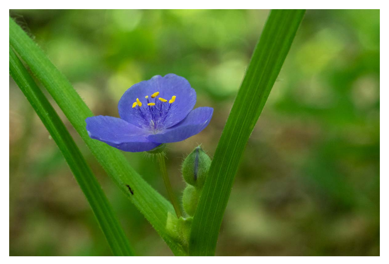
Virginia spiderwort is a showy monocot.