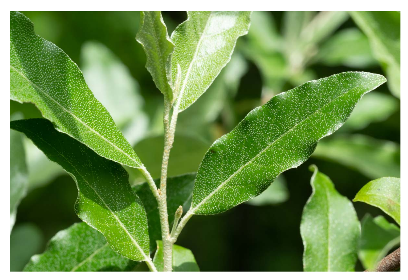
Autumn-olive is an invasive shrub with brown scaly twigs.