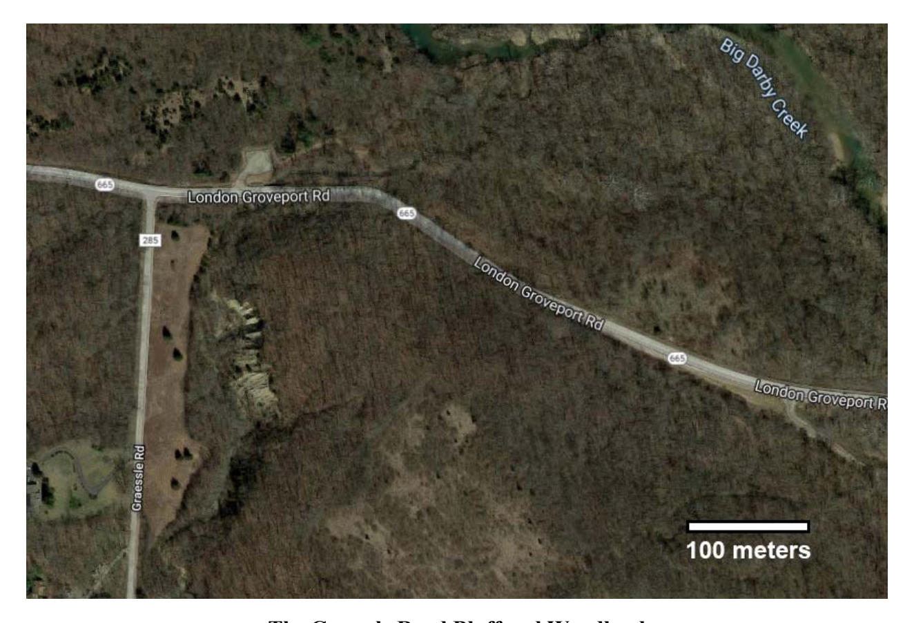
The Graessle Road Bluff and Woodland

The study site is an undeveloped portion of Batelle Darby Creek Metro Park near its southern edge in Franklin County. Located at 39°50'55.692" N 83°12'35.214" W, it comprises approximately 25 hectares (ca. 62 acres) of a much larger tract, with no definite boundaries. The site was brought to my attention by an ecologist friend who mentioned that a rare fall-flowering blazing star (genus Liatris in the family Asteraceae) occurs there. The principal ecological feature is a very steep eroding bluff high above an intermittent tributary to Big Darby Creek. In the photo below, the eroding bluff is visible as a variegated vertically oriented bracket-shaped zone just east of the field alongside Graessle Road.