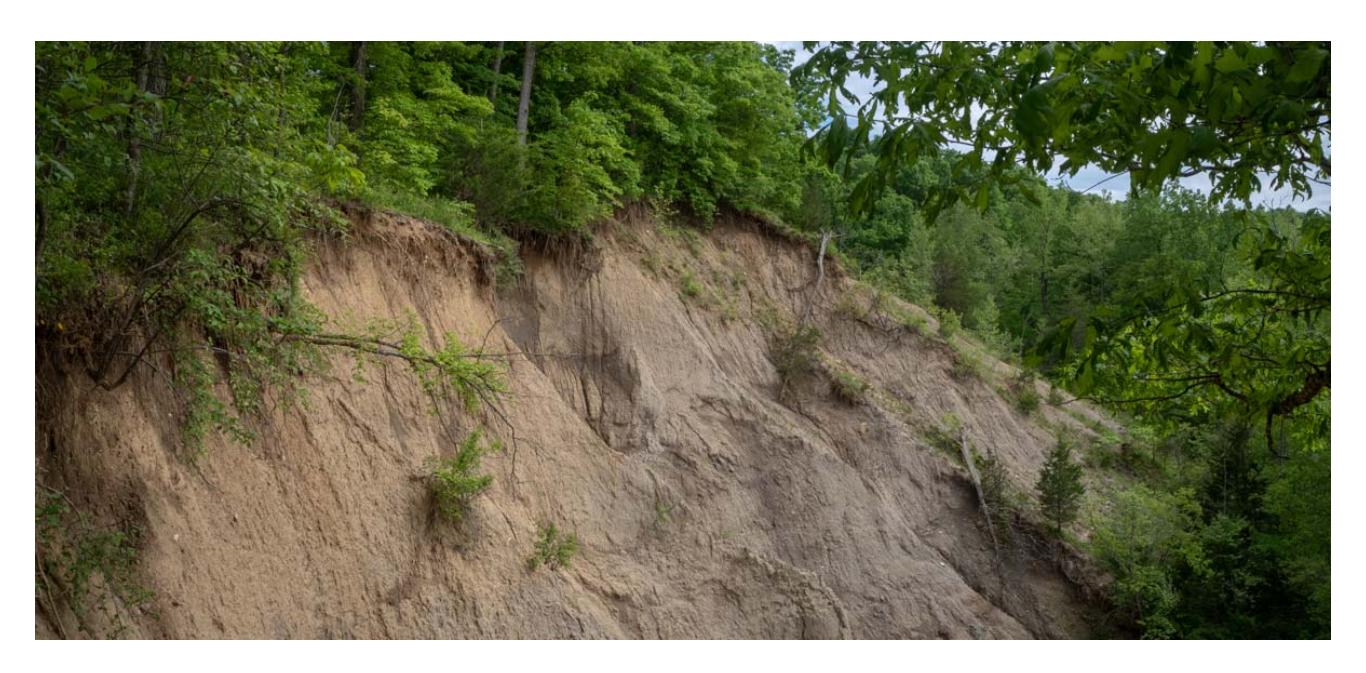
The Bluff Seen from Woodland Edge Facing North