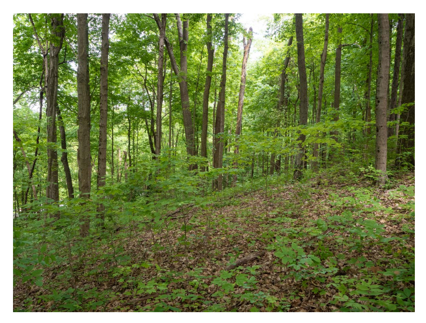
A rich woodland dominated by sugar maple