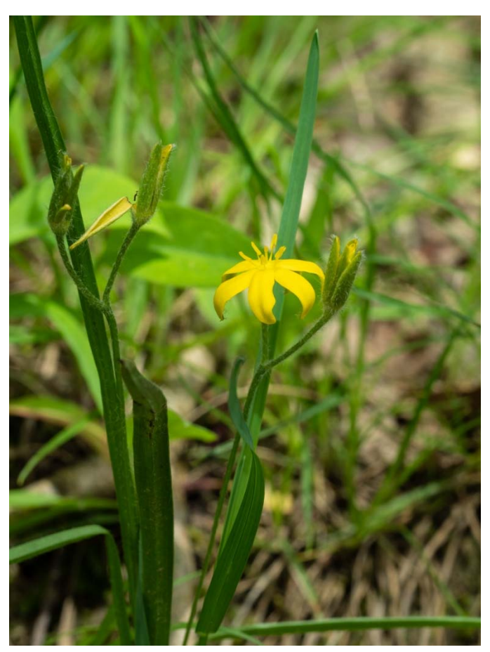
Yellow star-grass is a small but showy monocot.

Hypoxis hirsuta (L.) Coville. Yellow star-grass. Native forb. CC=6. Common on the bluff. Yellow star-grass has a lily-like flower, with 3 sepals and 3 petals that look very alike, and so are termed "tepals."