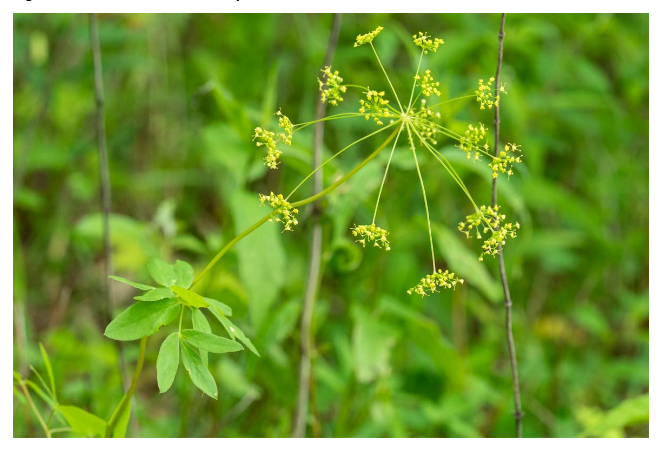
Yellow-pimpernal bears especially diffuse compound umbels.

Taenidia integerrima (L.) Drude. Yellow-pimpernal. Native forb. CC=6. Sparse on the woodland edges along the bluff. The leaflets of the twice-compound leaves of this species have an entire (untoothed) margin, an unusual trait for this family that aids identification.