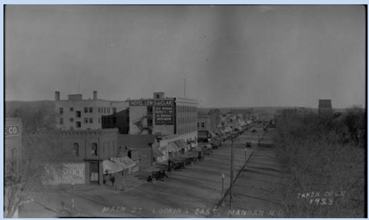
This real photo postcard offers a view of the cars and businesses on Main Street, looking east in 1923. Visible are the Red Trail Pool Hall, Hotel Lewis and Clark, a drug store, cafes, and the Cummins Company Department Store.