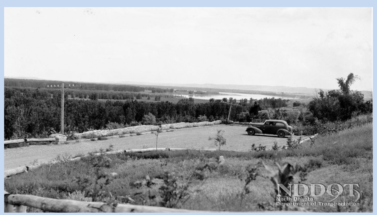
The "Sunken Garden" parking lot at Fort Abraham Lincoln State Park. Circa 1940.