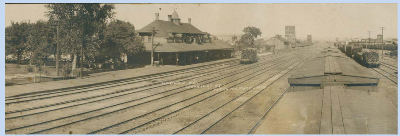
This 1909 wide angle panorama was taken from the top of railway cars parked in railyards. The two story depot with covered area faces towards the railyard with people milling around and cars with lumber stacks are waiting to be hooked to trains.