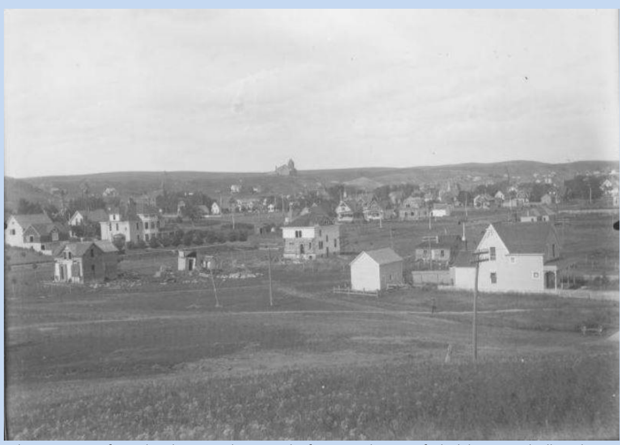
This 1900 view of Mandan shows residences in the foreground, many of which boast windmills in their yards. The Morton County Courthouse is visible on top of a distant hill. The Mandan High School and the steeple of St. Joseph Catholic Church are also visible.