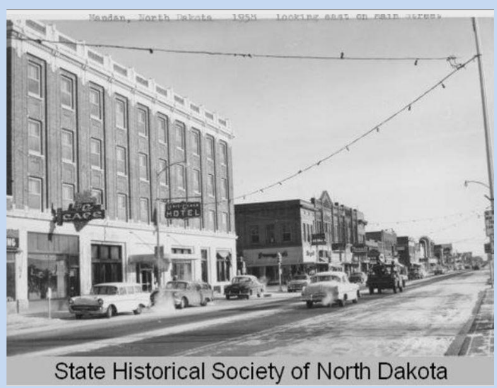
View of Main Street with its storefronts visible into the distance. The building on the left is the Lewis & Clark Hotel.