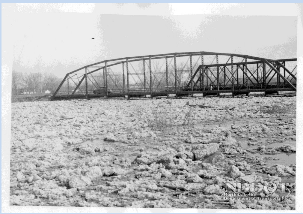
The Heart River Bridge on the west side of Mandan during the flood of March 1948.