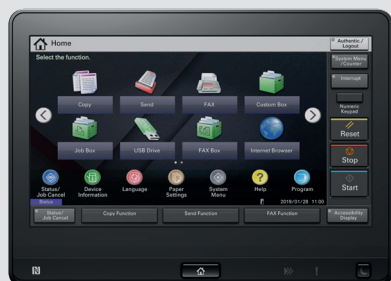
10.1" Colour Touch-screen , tiltable