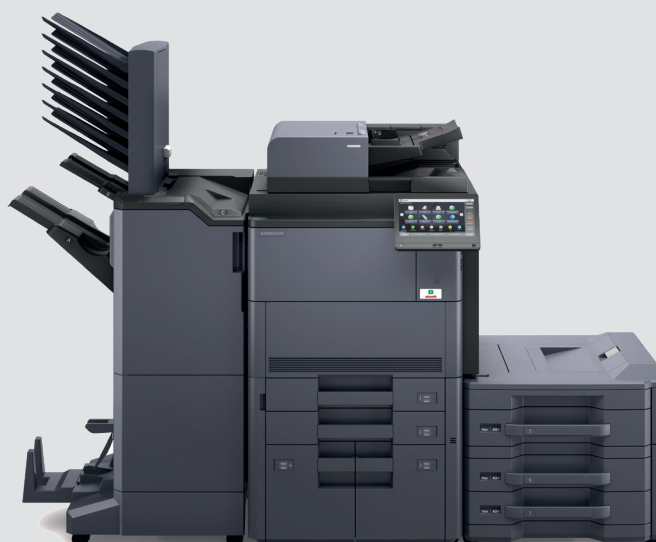
Configuration with PF-730+PF-7130+DF-7110+MT-730+BF-730