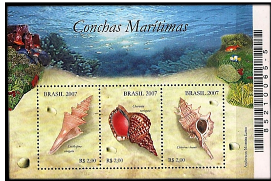
Figure 6. “Marine Shells” series, of 2007; souvenir sheet. From left to right: Cochlespira elongata , Charonia variegata and Chicoreus beauii (now Siratus beauii ).

Chicoreus beauii (Fischer & Bernardi, 1857) is a medium-sized (reaching up to 12 cm in shell length) species of murex snail (Fig. 3I), with a rather disjunctive distribution. It ranges from North and Central America, reaching Venezuela and Pará state in Brazil. After a relatively large distributional gap, it can be found again in southern Brazil, from Santa Catarina to Rio Grande do Sul, having Uruguay as its southernmost occurrence (ROSENBERG 2009). This species is now classified as Siratus beauii (PONDER & VOKES 1988; HOUART 2014) and is also featured in stamps from the Caribbean countries of Grenada/Grenadines and Montserrat (MOSCATELLI 1992).