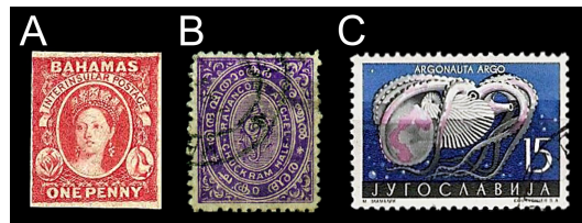
Figure 1. First stamps to depict mollusks in a: (A) secondary manner (Bahamas, 1859); (B) pictorial or symbolic manner (Travancore, 1888); (C) biological manner (Yugoslavia, 1956).

Mollusks, and the fauna in general, soon became a recurrent theme on stamps from all the world and are now usually depicted in this more scientific manner. Despite this prominence on worldwide stamps, the fauna is often overlooked as a theme in Brazilian philately ( e.g. , ALMEIDA & VASQUEZ 2003), which is a curious fact for a megadiverse country. The Brazilian avian and even mammal diversity seems to be reasonably covered in the country's postage stamps. However, the invertebrate fauna, where the real biodiversity lies, is barely represented.