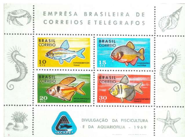
Figure 2. “Promulgation of Fish Farming and Fishkeeping” souvenir sheet, of 1969. The shell of Charonia variegata appears on the upper right corner (note that the shell is inverted on the original).

The gastropod in question is Charonia variegata (Lamarck, 1816), commonly called the Atlantic triton, and belongs to the caenogastropod family Ranellidae. This species