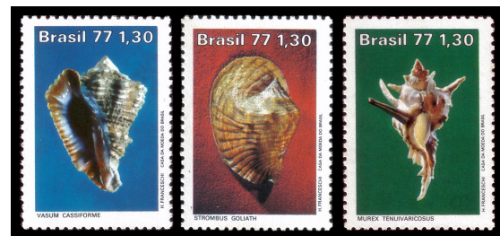
Figure 4. “Mollusks of Brazil” series, of 1977. From left to right: Vasum cassiforme (inverted shell on the original), Strombus goliath (now Lobatus goliath ), Murex tenuivaricosus (inverted shell on the original; now Siratus senegalensis ).

Strombus goliath Schröter, 1805, the goliath conch, is one of the largest gastropod species in the Western Atlantic – its shell may reach up to 38 cm in length (ROSENBERG 2009). It is endemic to Brazil, ranging from Ceará to Espírito Santo (RIOS 2009), with some old records from the Caribbean