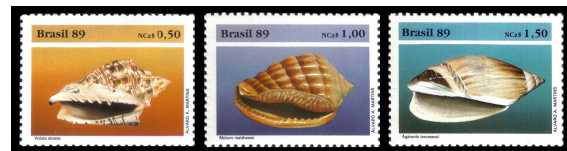
Figure 5. “Preservation of Brazilian Fauna – Mollusks” series, of 1989. From left to right: Voluta ebraea , Morum matthewsi and Agaronia travassosi .

This series, called “Preservation of Brazilian Fauna – Mollusks” (“ Preservação da Fauna Brasileira – Moluscos ”, in Portuguese), is composed of three stamps (Fig. 5). Like the preceding series, it counts only with marine gastropods; the represented species are (names as they appear on the stamps): Voluta ebraea , Morum matthewsi and Agaronia travassosi .