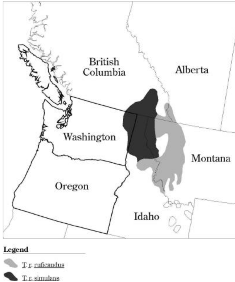
Figure 2. Range of the Red-tailed Chipmunk in North America (modified from Patterson and Heaney 1987 and Best 1993.)

surveys in this region in the early 1990s provided no records for this species (Vacation Alberta Corporation 1992). Most records for Red-tailed Chipmunks come from WLNP, but no detailed population surveys have been conducted in the park. In field notes written between 1960 and 1965, Soper (1973) describes Red-tailed Chipmunks as “scarce to common, or fairly numerous, from one mountain locality to another” and suggests the population is similar in size to that of Least Chipmunks and substantially lower than the population of Yellow-pine Chipmunks. During the summer of 1972, Nielsen (1973) trapped chipmunks in areas not included in Soper’s