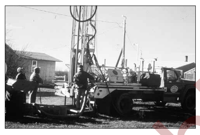
Figure 6. Test drilling to locate groundwater aquifers

In many areas, municipalities have also been involved in groundwater test drilling programs to locate significant groundwater aquifers in water shortage areas (Figure 6). These higher producing aquifers can become excellent locations for tank loading facilities or regional pipelines.