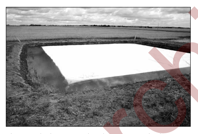
Figure 4. Plastic cover to reduce dugout evaporation losses