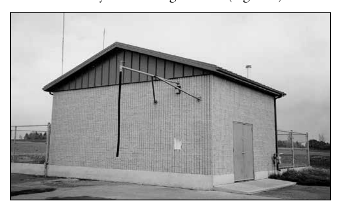
Figure 5. Tank loading facilities