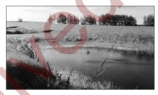
Figure 1. Water is essential

Water is essential to all human activity (Figure 1). The way water resources are managed will determine the future of the prairie economy. Security of water supply has been a primary goal of Canada/Alberta cost-share programs since the drought in 2000. The latest program is called Growing