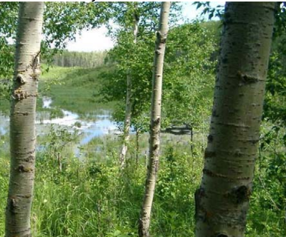
Overlooking beaver pond