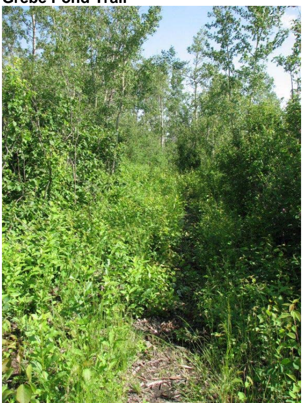
Existing trail between bench and future platform area