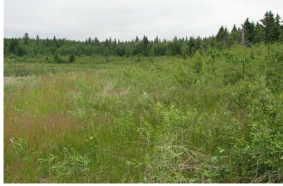
Collecting at AT AR1