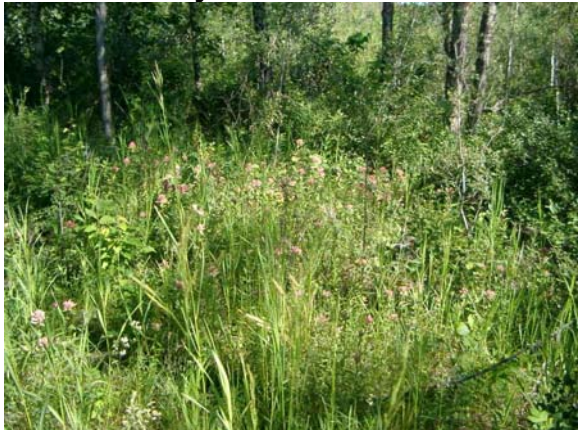
Paintbrush in open aspen forest