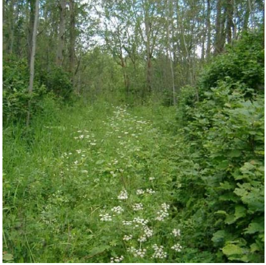
An existing part of the trail invaded by wild caraway