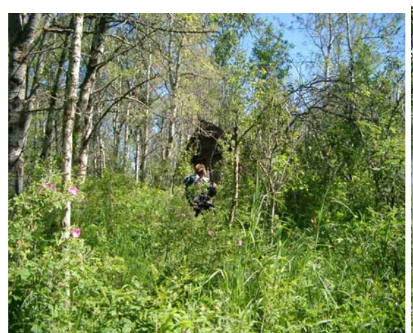
Approach to old cabin site