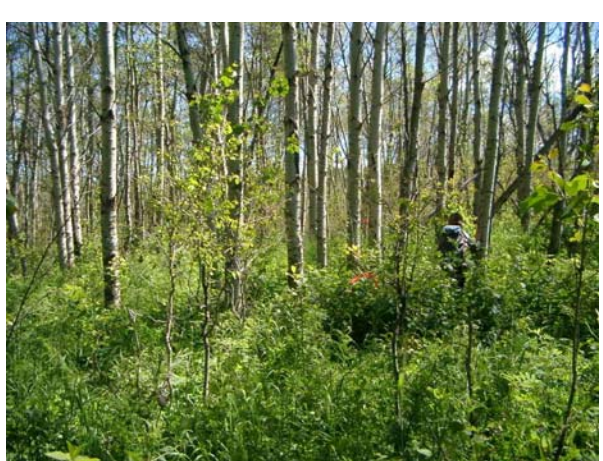
Mesic aspen forest on slope