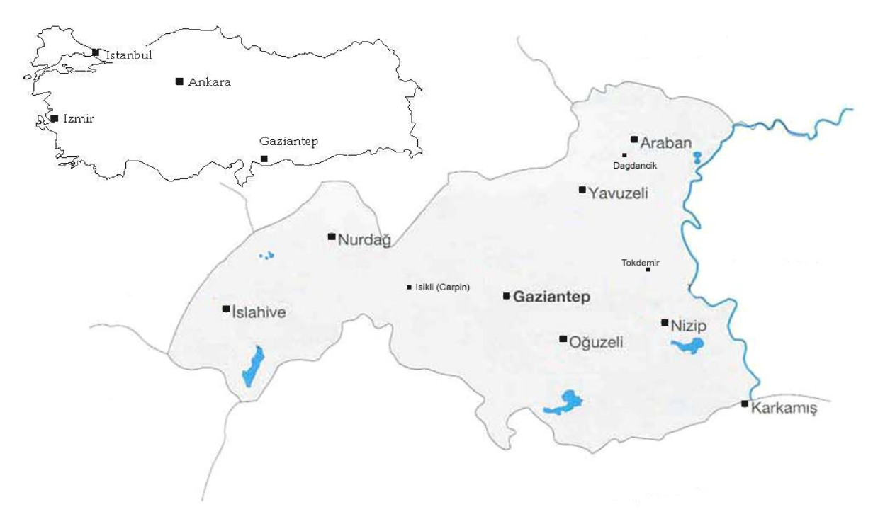
Figure 1. Map of Gaziantep Işıklı (Çarpın), Dağdancık and Tokdemir.

identified at Aegean University Botanic Garden-Herbarium Research and Application Center in İzmir. During the identification of plants, the Flora of Turkey and East Aegean Island (Davis 1965-2008) and other related books were used. After identification, plants were categorized based on their family name.