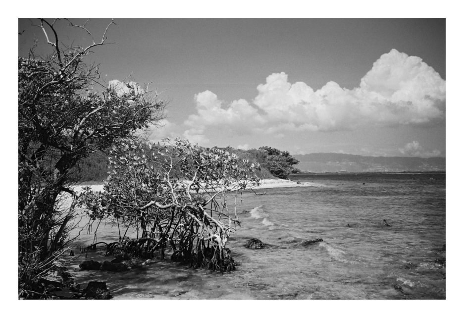
Fig. 3: Edge of the mangrove forest, with Rhizophora mangle .