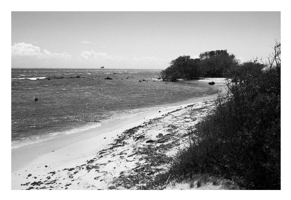
Fig. 5: The rocky southern point of the island.