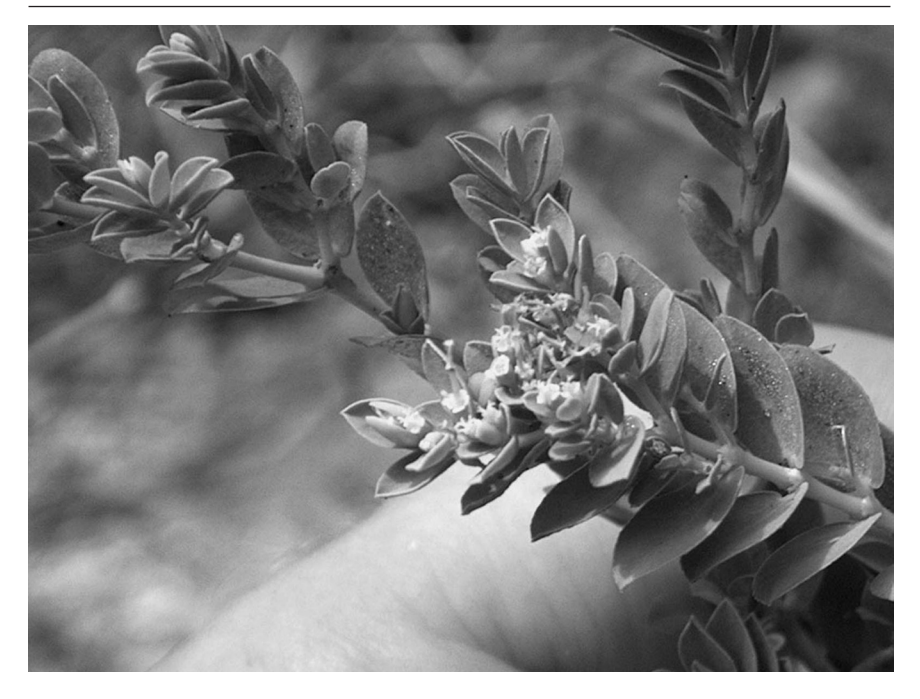
Fig. 7: Euphorbia mesembrianthemifolia, Christenhusz 3400.

angled and slightly transverse anastomosing rugose. Very common spurge, fringing the seaside; on beaches, seaside meadows and limestone rocks. It is spread from island to island and to new shores by the clinging of the seeds to the feet of aquatic birds; once established on the shore, it spreads by the catapulting fruits and with the shifting of the beach sand (MILLSPAUGH 1907). Caribbean shores, from Southern Florida, Bermuda, The Bahamas and Mexico, throughout the West Indies and eastern shores of Central America to Colombia, Venezuela, and French Guiana.