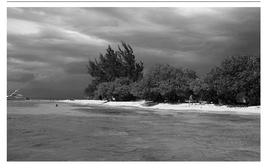
Fig. 6: View on the sandy beach from the NW of the island. The tall trees are Casuarina equisetifolia , which were planted to break the wind. The other trees are mostly Thespesia populnea , providing shade.