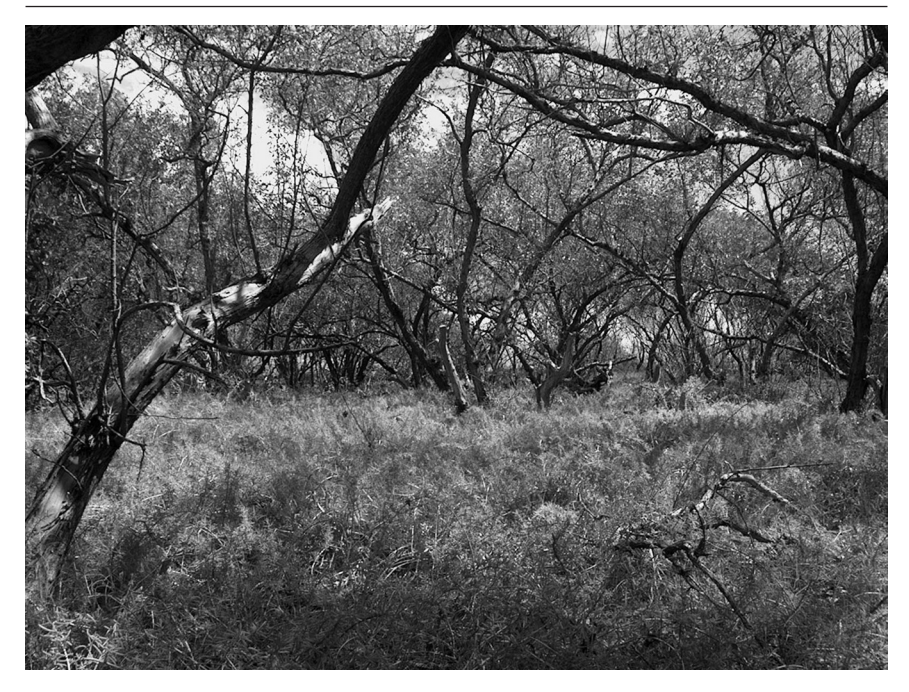
Fig. 4: Conocarpus erectus forest with undergrowth of Batis maritima.