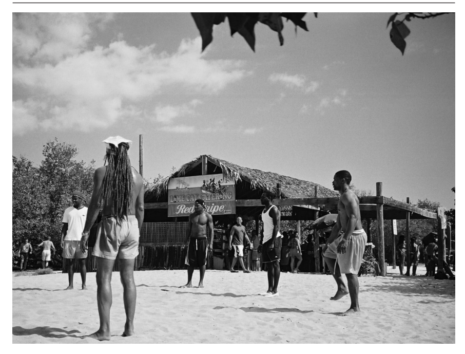
Fig. 2: Tourists in front of the catering building.