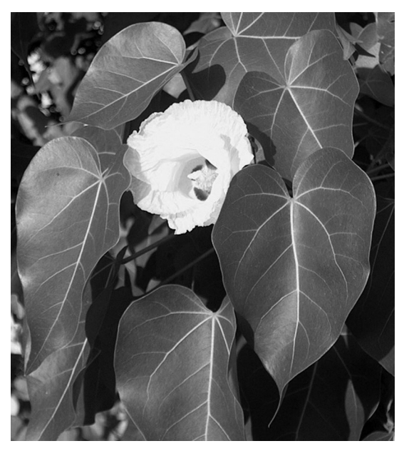
Fig. 9: Thespesia populnea.

tire; stipules subulate, 3-10 mm long. Flowers solitary, axillary, showy, opening in the evenings; bracteoles lanceolate, 5-15 mm long; epicalyx (bracts) 3-parted; calyx cupular, entire or minutely 5-toothed, 9-14 mm long; petals 5, 4-7 cm long, whitish to yellow, or becoming purplish, with a red spot at the base of each. oblique at the apex. Fruit a depressed-globose, angular, dry capsule, 2-4.5 cm broad; mesocarp soft with yellow sap, drying blackish; skin leathery. Very common tree, often in littoral situations, often also planted as an ornamental and shade tree; a native species of sandy or gravelly shores and mangrove margins throughout the tropics.