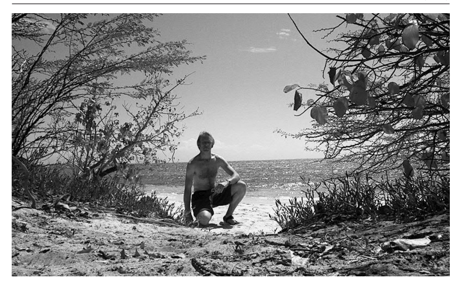
Fig. 10: The author on Lime Cay, with Cordia sebestena on his left, Acacia tortuosa on his right and Sesuvium portulacastrum on the beach.