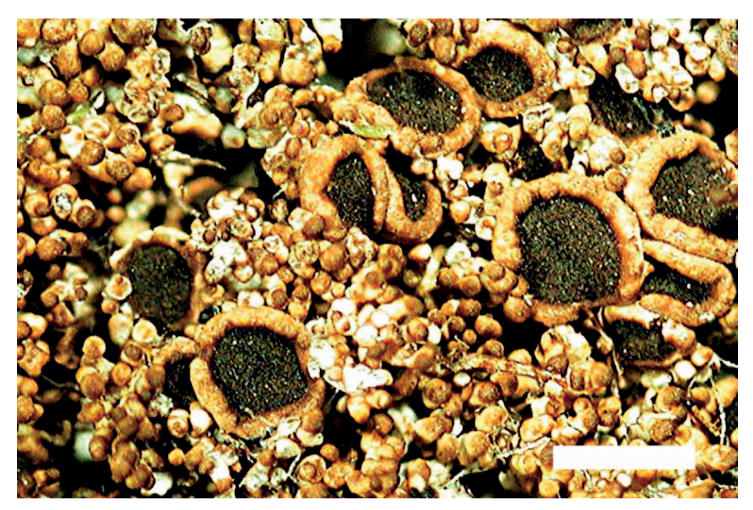
FIG. 1: Rinodina fuscoisidiata , habitus showing the isidiate thallus and the apothecia with plane discs and prominent thalline margins (holotype). Scale = 1mm.

Thallus muscicolous, crustose, densely isidiate, spreading. Isidia simple and globose at first, 0.07-0.2 mm diam., becoming cylindrical, simple or more commonly branched or coralloid, up to 1 mm long, pale chestnut brown to dark brown, darker and often erumpent at the apices, not forming soredia or blastidia (Fig. 1). Cortex paraplectenchymatous, 20-35 µm thick, composed of mesodermatous hyphae with rounded to ±elongate cells 7-10 µm (textura globularis to angularis), chestnut brown pigmented in the outermost part, colourless in the inner part, totally interspersed with crystals soluble in K. Medulla 60-130 µm, I+ pale blue, totally interspersed with crystals soluble in K. Algal cells chlorococcoid, 8–15 µm diam.