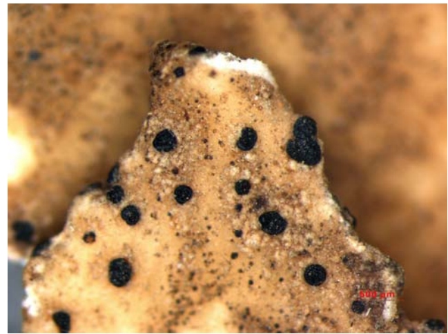
Fig. 2 Habit of Endohyalina diderichii Giralt, van den Boom & Elix, lichenicolous on Ramalina bourgeana (holotype). Scale bar 500µm

Type Macaronesia, Canary Islands, Lanzarote, SW of Haria, Valle del Malpaso NW slope in valley with volcanic outcrops and Pinus trees, on N sloping rock, 515 m, 29° 07.8'N, 13°31.2'W, 07.03.2003, on Ramalina bourgeana