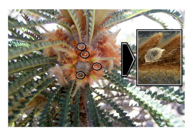
FIGURE 3 Mealybugs of Pseudococcus markharveyi sp. nov. (circled) in situ on the host plant Banksia montana.

Australia: Western Australia: 2 adult females (2 slides), same data as holotype (1 in ANIC, 1 in WAM E83773); 3 adult females (including DNA voucher LGC01999: 3 slides), Stirling Range National Park, Bluff Knoll summit, 1039 m, 34°22'50.6"S, 118°15'02.1"E, 16 February 2012, M.C. Leng and F. Bokhari, 'Bluff