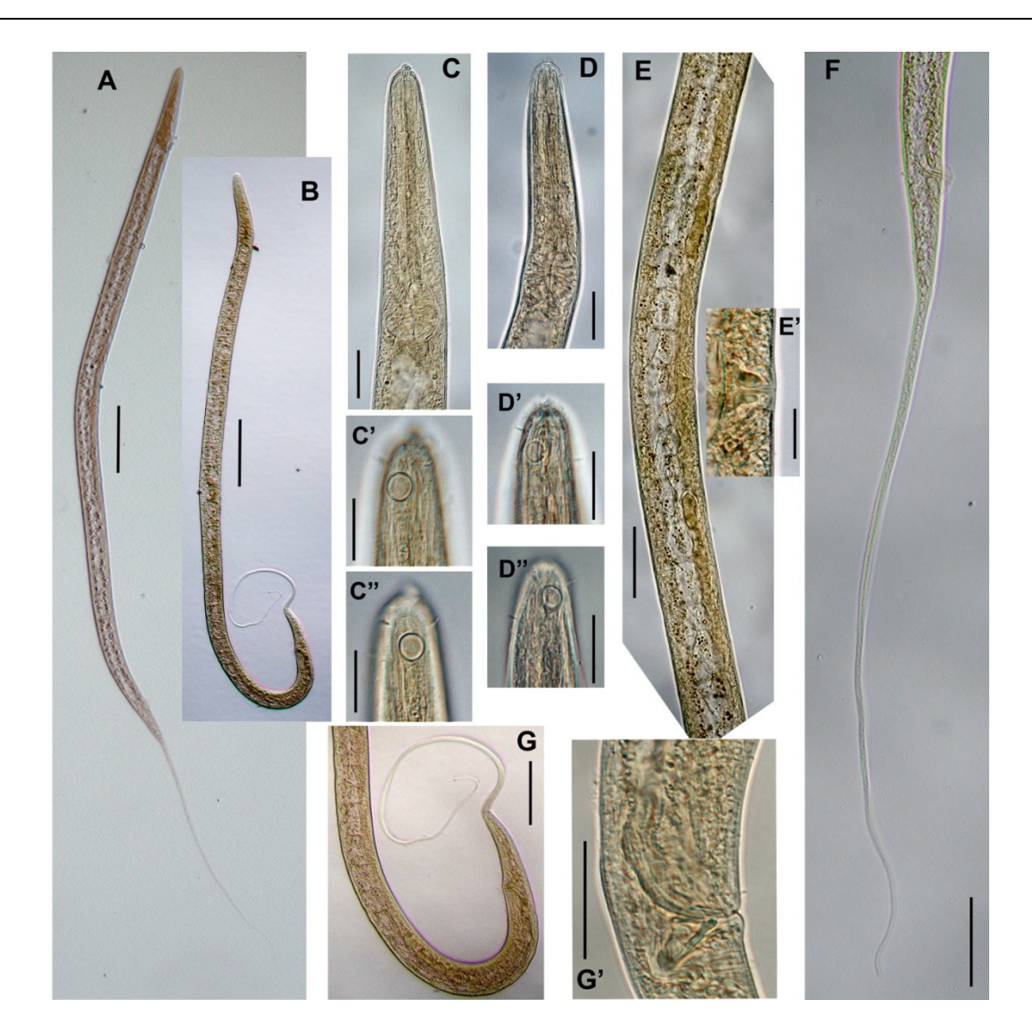
Figure 1. Photographs of Terschellingia didistalamphida sp. nov. holotype female and paratype male. Whole body– A. female B. male; C. Anterior end of female showing distinct basal bulb and cardia [ C' & C" –enlarged view at different focal planes to show the amphids and cephalic setae]; D. Anterior end of male [ D' & D" – enlarged view to show the amphids at different focal planes]; E. Gonads with vulva [ E' – enlarged view to show vulval lips]; F. Tail region with anus in female; G. Tail region of male with spicules and G' . enlarged view to show the spicules. Scale bars : A & B : 100µm; C , C' , C" , D , D' , D" & G' : 20µm; E : 40µm; E' : 10µm and F & G : 50µm.

Thanh, 2009 (Gagarin & Thanh 2009). However, the new species differs significantly from T. lutosa in total body length (1165–1562.5 \mu m in T. didistalamphida sp. nov. vs. 1924–2235 \mu m in T. lutosa ) and tail length (c'12–25.87 vs. c'7–8.8). It also differs from T. rivalis in tail length (c'12–25.87 in T. didistalamphida sp. nov. vs. c'32–33 in T. rivalis ); the ratio of total body length and GBD also vary significantly (a 31.62–48.06 vs. a 66–83) and in V% (32.58–41.2 vs. 26.4–30.5).