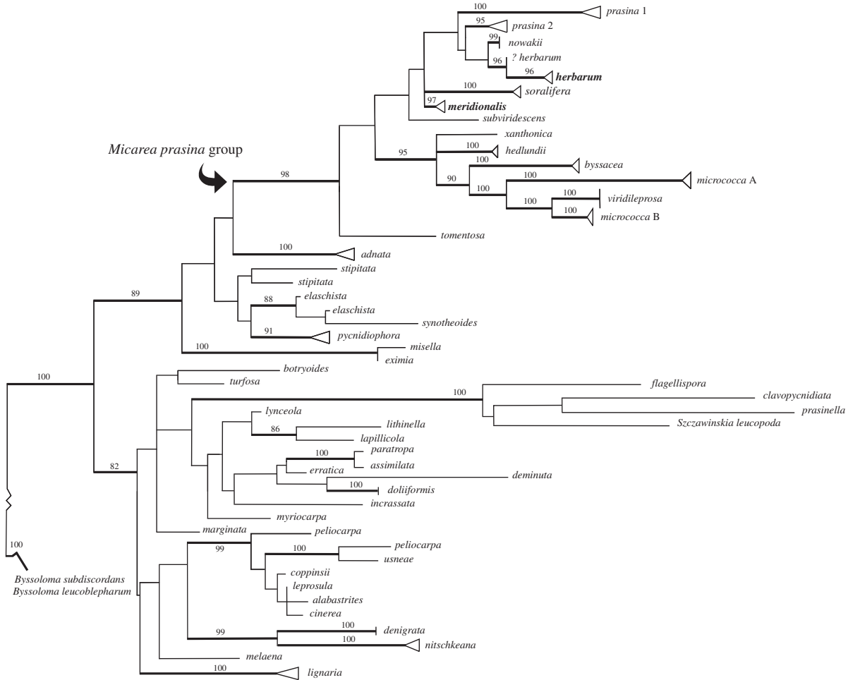
FIG. 1. Most-likely phylogenetic tree for species of Micarea obtained from mtSSU sequences. Branches in bold are those that obtained ML bootstrap support >70% and are indicated above branches. New species are in bold.