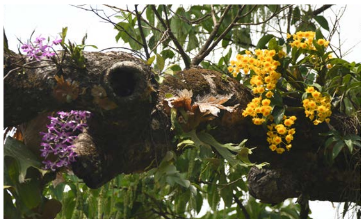
Dendrobium lituiflorum and D. chrysotoxum

April 23. Today we travel from Tengchong to Yingjian, on the way exploring Tengjiang. We should see Dendrobium , Coelogyne , Gastrochilus and other orchids. Overnight in Yingjiang.