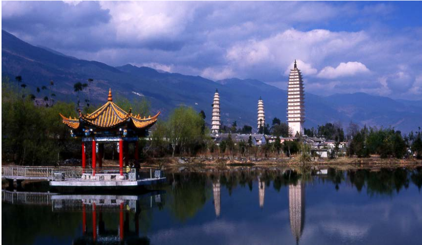
Dali City, Yunnan