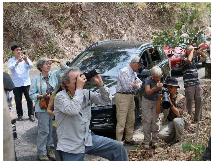
Tour participants photographing epiphytic orchids