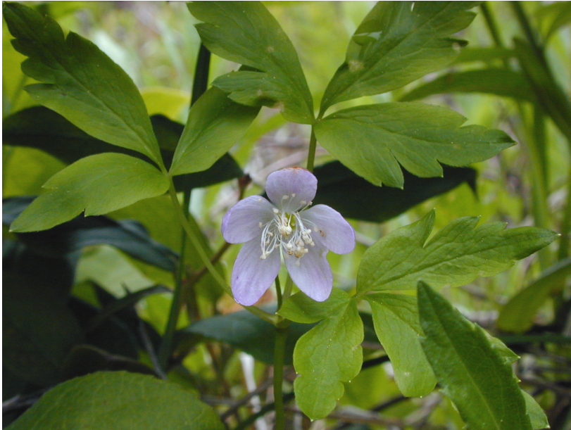
Bruce N. Newhouse

Ranunculaceae bog anemone, coast anemone