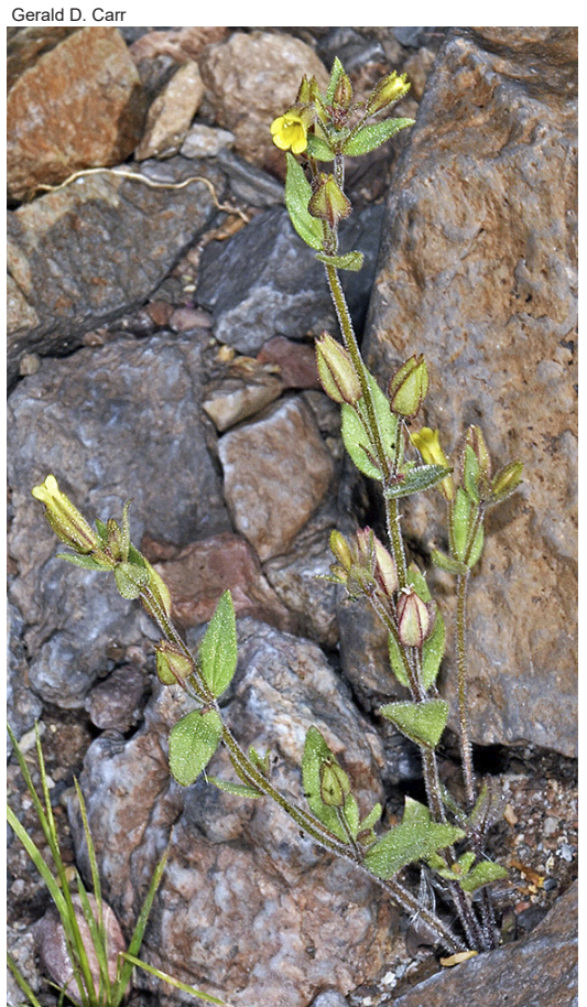
W W W W