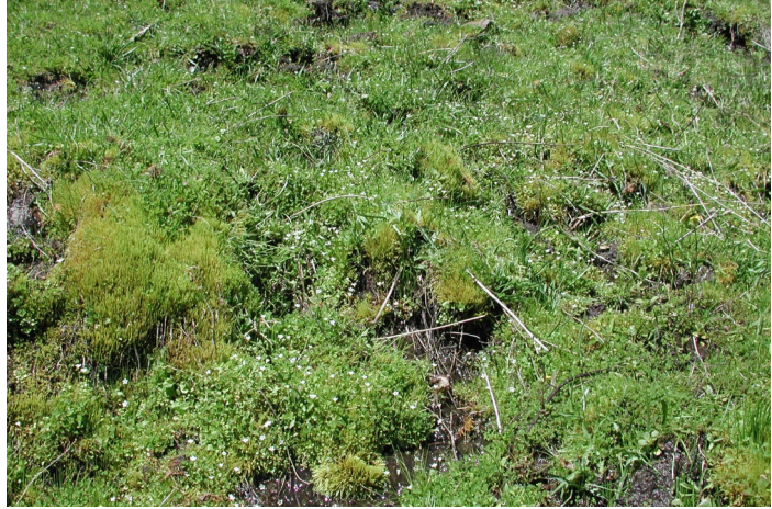
best survey times J|F|M|A|M|J|J|A|S|O|N|D