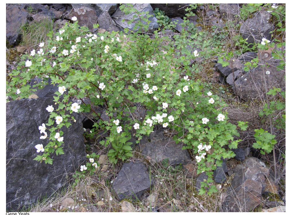
best survey times J|F|M|A|M|J|J|A|S|O|N|D