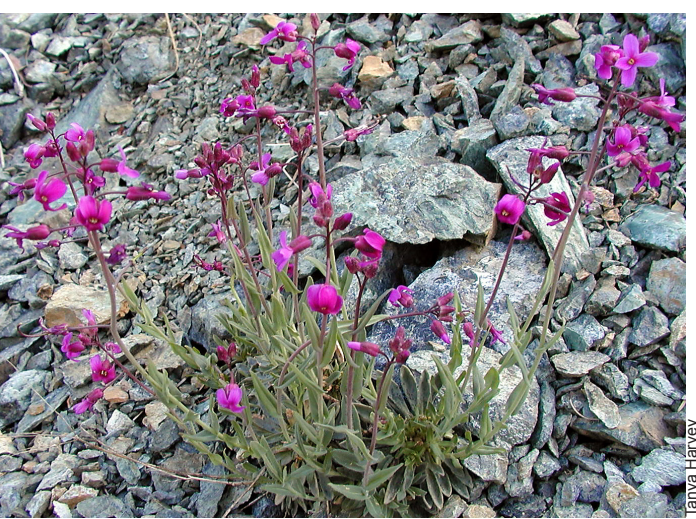
best survey times J|F|M|A|M|J|J|A|S|O|N|D