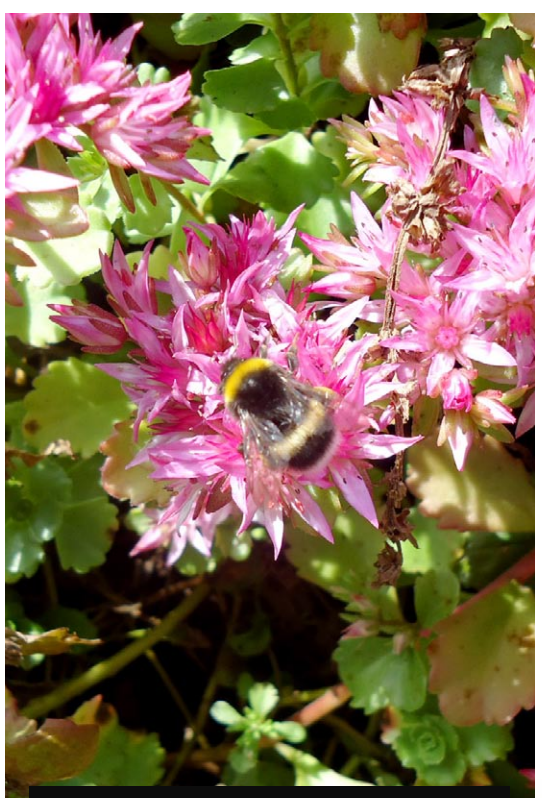
Fig. 2 Close up of Phedimus spurius with a bee pollinator.

Phedimus ellacombianus is another plant that's ideal for growing in rockeries since it forms dense carpets (Fig. 3). As with P. spurius this species has sprawling, rooting stems bearing bright green, serrate leaves. The