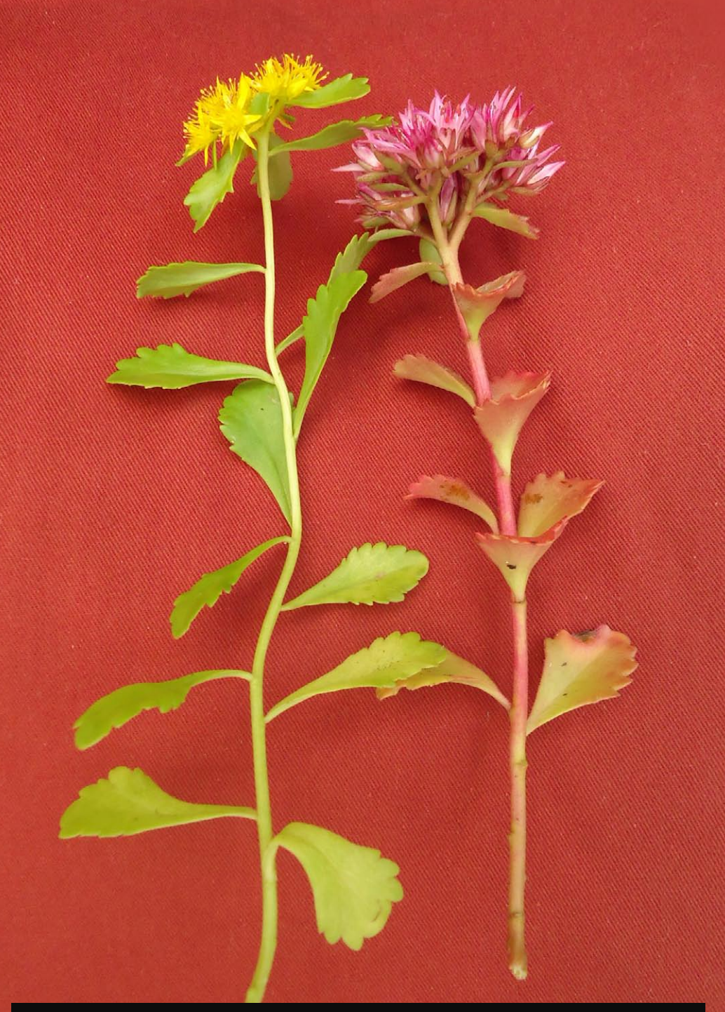
Fig. 4 Cuttings of Phedimus ellacombianus (left) and P. spurius (right).