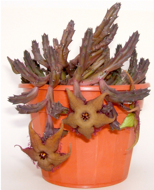
Fig. 3 Stapelia schinzii var. angolensis flowering in a 12.5 cm diameter pot.

being only 7 cm across in my plant, although these can be up to 14 cm in diameter. The flowers have the typical transverse ridges of most Stapelia flowers, but unlike those of S. gigantea these are somewhat shiny and adorned with very dark purple hairs on the edges of the corolla lobes, hence greatly adding to their attractiveness.