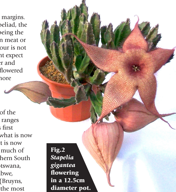
Fig.2 Stapelia gigantea flowering in a 12.5cm diameter pot.

The closest relative to S. gigantea is S. unicornis which has a much more limited distribution and occurs principally in the Lebombo Mountains where South Africa, Swaziland and Mozambique meet. The distribution range of these species overlaps across most