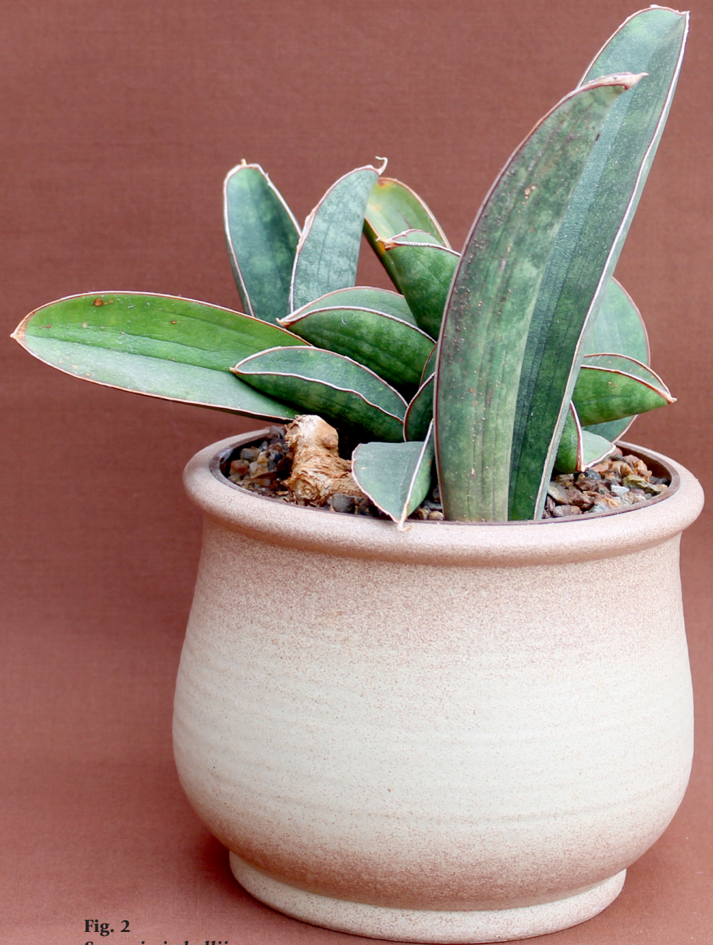
Fig. 2 Sansevieria hallii in an 11cm diameter pot.

Sansevieria is a genus in which around 70 species are currently recognised (Chahinian, 2005). Many of these are large growing and hence need a reasonable amount of space to accommodate them. In my experience the two species showcased here are relatively slow growing and are therefore choice collectors' items. I grow most of my sansevierias as house or conservatory plants, provide them with winter warmth and they are watered all year around. My Sansevieria collection is mostly accommodated in a range of ceramic pots or other unglazed pots making them a doubly attractive feature of the windowsills (Figs. 1 & 2).