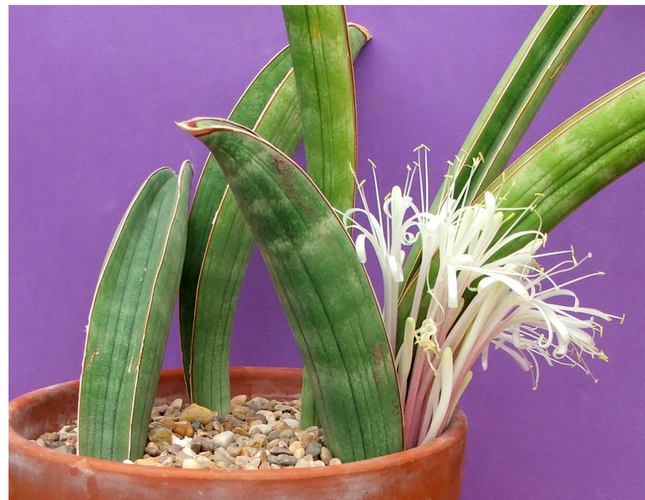
Fig. 3 Sansevieria hallii in flower in a 17cm diameter pot.

The plant is best grown with reasonable light levels to maintain the compact growth and attractive leaf markings.