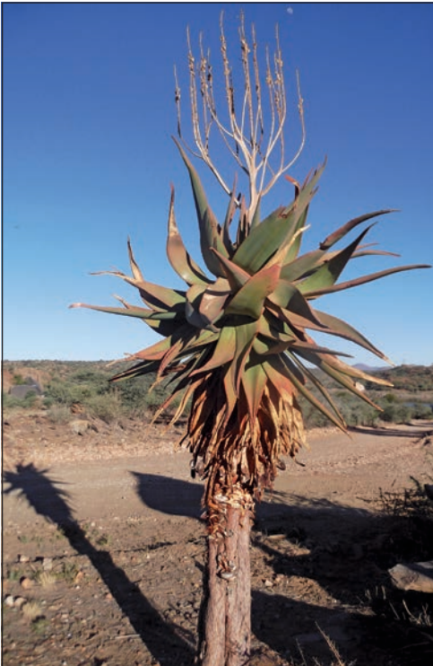
Fig. 1. Aloe littoralis after flowering at Oanob Lake near Rehoboth, Namibia, July 1st, 2013.