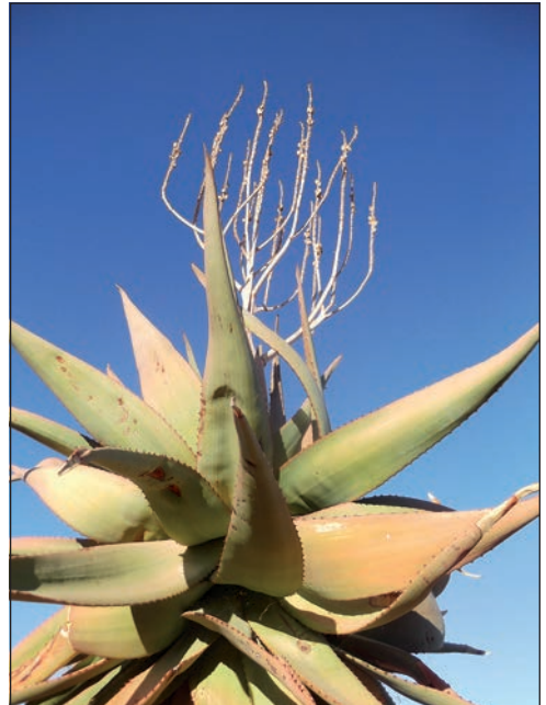
Fig. 2. Closer view of a rosette of A. littoralis .