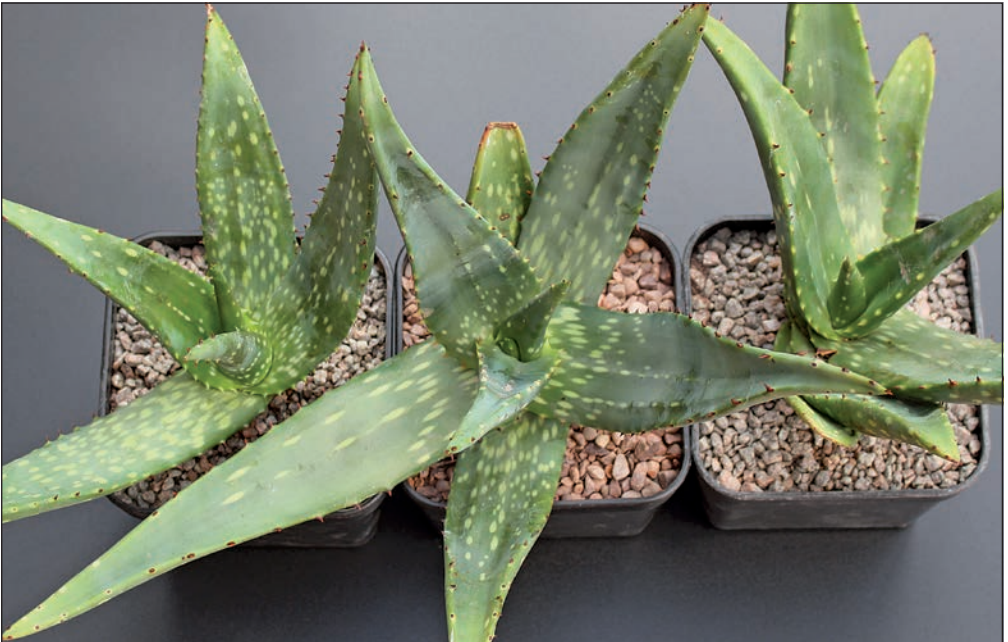
Fig. 3. Four year old seedlings of A. littoralis in the author's collection in 115 mm pots showing significant spotting of the leaves.

Janet was able to collect a small sample of seed from which a few seedlings were subsequently raised by another friend, Tina Wardhaugh (Fig. 3). The seedlings are robust, grow easily and as of September 2018 are just over four years old. Interestingly they all have heavily-spotted leaves with elongated pale spots. This feature of spotted juvenile leaves but unspotted mature leaves is not unique to this species as it has been observed in several other species, for example in A. tomentosa (Walker, 2016). Perhaps this spotted-leaved feature is related to camouflage of the juveniles to discourage herbivores from feeding on them?