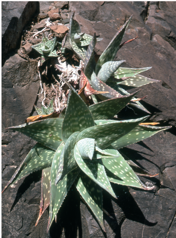
Fig. 2 Aloe erensii in habitat at the type locality, gorge between Lokitaung and Lake Turkana, NW Kenya