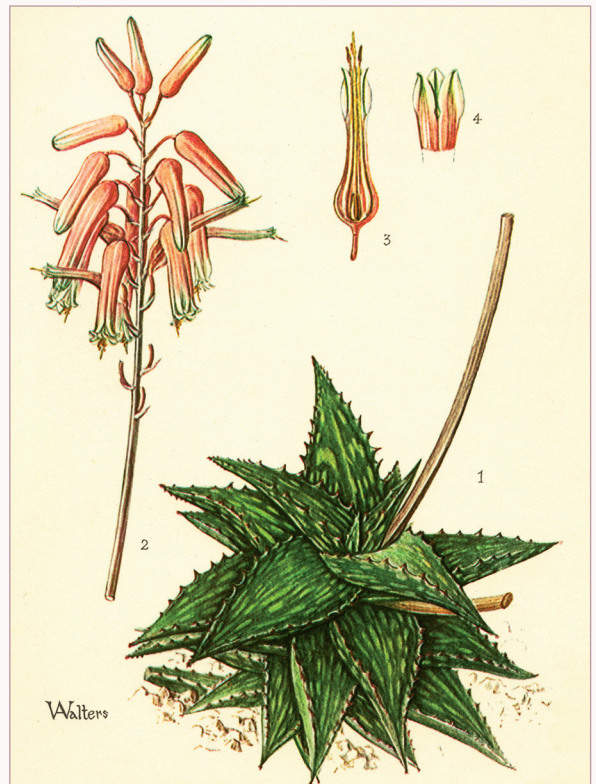
Fig. 4 Aloe jucunda (from Verdoorn, 1962)

However, the most recent evolutionary tree of aloes produced by Grace et al (2015) presents a different picture of relationships. Of the eight species included