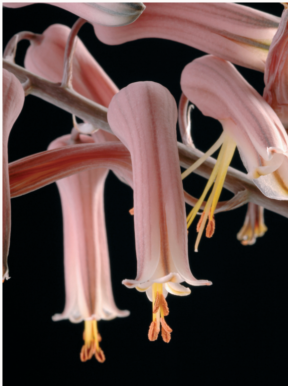
Fig. 8 Close up of the flowers of Aloe 'Erensjuic'