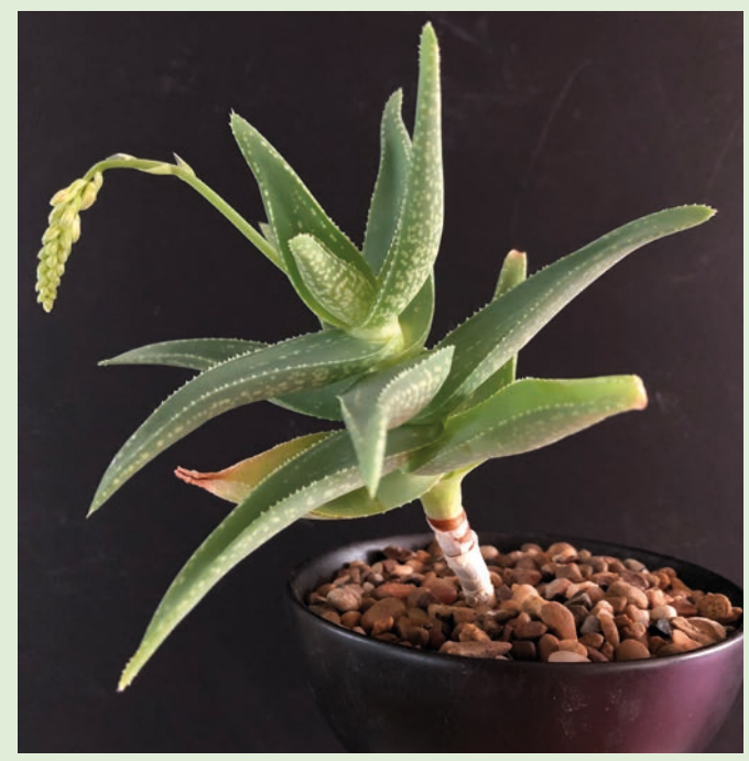
Fig 2. Aloe whitcombei in bud. For scale the plant is shown in a 12 cm diameter pot.