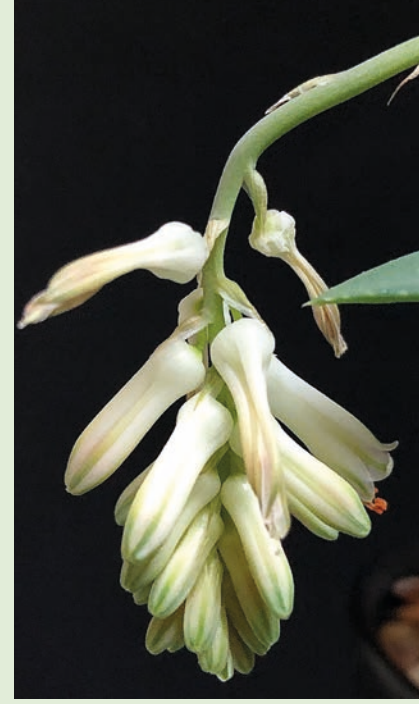
Fig 4. Detail of flowers of A. whitcombei.