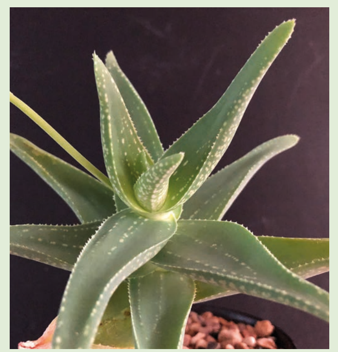
Fig 1. Aloe whitcombei.

Aloe whitcombei is unique amongst the 50 species of aloe recorded from Arabia including Socotra (McCoy, 2019) in having white flowers. Most aloe flowers are yellow, orange or red and attract bird pollinators. White flowering