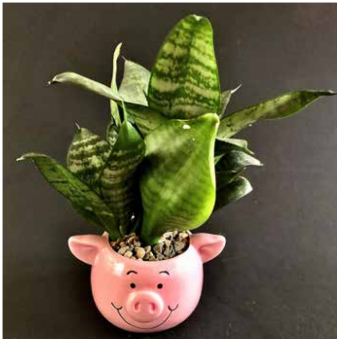
Figure 8: Sansevieria trifasciata 'Hahnii' in Percy Pig Pot.