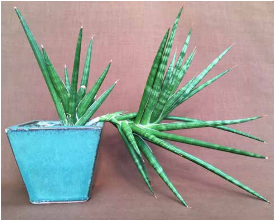
Figure 7: Sansevieria francisii . Photo: Colin Walker

In my experience S. francisii flowers freely even as a small plant, making it highly desirable in cultivation. Its inflorescence is unbranched up to 30 cm tall, bearing flowers that are mottled dusky pink on the outside but ivory coloured internally and up to 3 cm long.