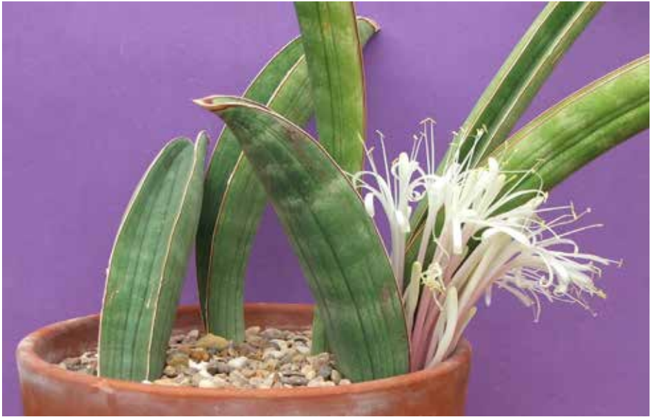
Figure 6: Sansevieria hallii in flower.