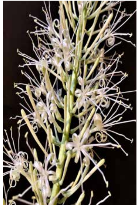
Figure 5: Sansevieria subspicata close up of flowers.

largest specimen leaves are at most 30 cm long but are recorded to grow up to 60 cm or more in length. These have a deep round channel with acute membranous edges, pronounced longitudinal lines with somewhat indistinct horizontal banding and a roughened surface.