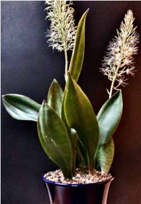
Figure 4: Sansevieria subspicata .