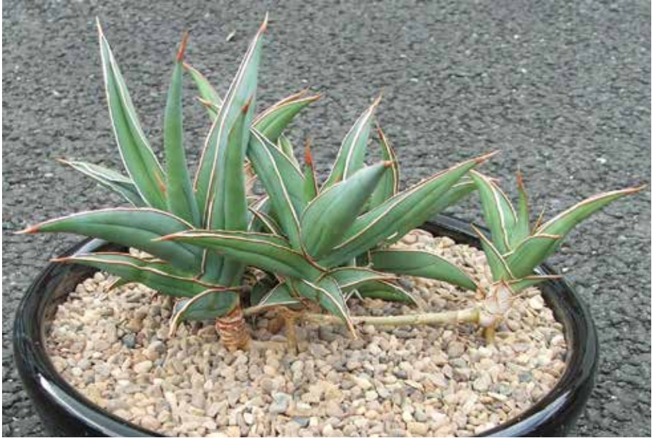
Figure 10: Sansevieria pinguicula .