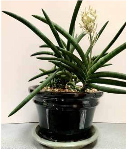
Figure 2: Sansevieria hargeisana .

Sansevieria hargeisana was described in 1994 from a collection made by John Lavranos on a 1969–1970 expedition near Hargeisa in what is now the Somaliland Protectorate and to date it has not been recorded from any other location. My plant (Fig. 2), which has been in my collection for 12 years, now has four rosettes with leaves up to 35 cm long arranged dichotomously, although each rosette has a slight twist to it. Three more new rosettes are also starting to develop. The leaves are cylindrical and round in cross-section for much of their length, with a shallow channel at the base with pronounced cartilaginous rust to fawn margins and with a sharp dried tip at the apex marked with rust at its base. As with many sansevierias the leaves are attractively cross-banded in darker green, with at least 7 dark green longitudinal lines and a slightly rough texture to the surface. In contrast young leaves are flatter, shallowly-channelled and not cylindrical.