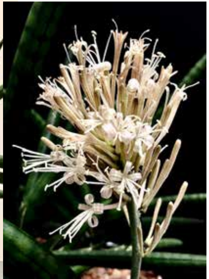
Figure 3: Sansevieria hargeisana close up of flowers.