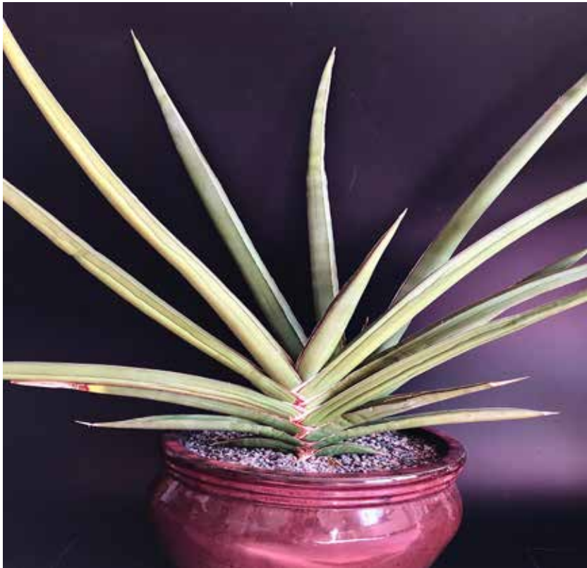
Figure 9: Sansevieria ehrenbergii .

This is a large, slow-growing plant (Fig. 9) with a stem up to 25 cm tall at maturity. Its long narrow leaves are up to 1.8 m long and remain distichous (2-ranked) even at maturity, whereas many other species have distichous leaves when juvenile and become rosulate with age. The leaves are rounded below with a shallow channel above, have a sharp tip and a reddish-brown margin. It is widespread in Arabia, the horn of Africa and tropical E. Africa ranging from the Yemen south to Uganda. My plant has yet to flower after 10 years in the collection but when it does the inflorescence will be up to 2 m tall and well branched, unlike all the other species discussed here.