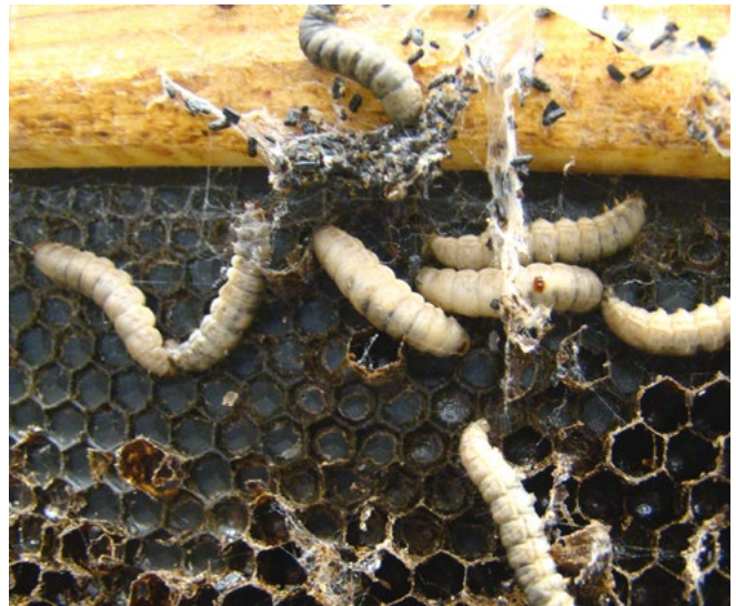
Figure 8. Wax moth larvae on a frame