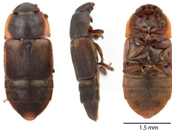
Figure 2. Dorsal, lateral, and ventral view of the sap beetle Brachypeplus basalis (family: Nitidulidae)