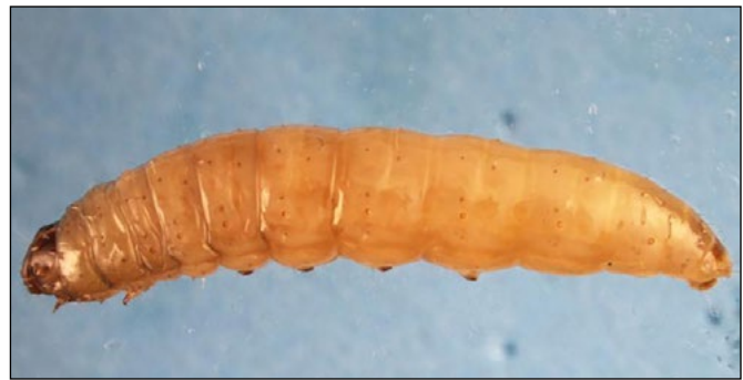
Figure 5. Wax moth larva

Female SHB lay eggs in clutches in cracks or crevices inside bee hives or in cells with brood or beebread. The eggs are about two-thirds the size of a