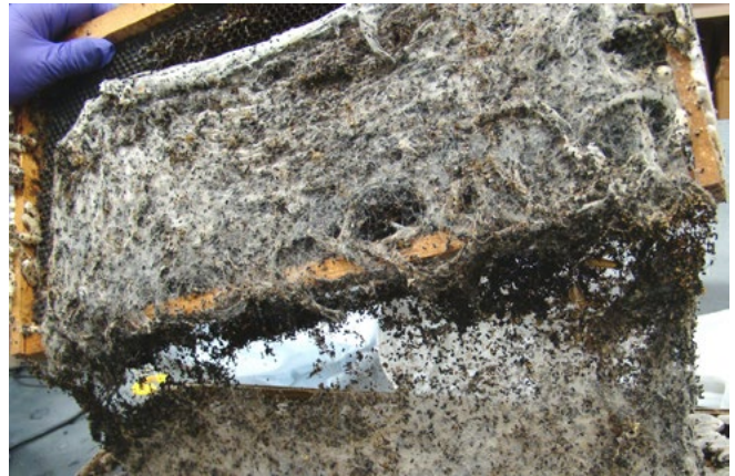
Figure 9. Wax moth larvae damage

In small colonies such as divides or splits, newly hived packages, nucleus hives (nucs), or post-swarm colonies, the SHB population can grow rapidly, beyond the colony's ability to keep it in check. Divides or splits are hives that were established by transferring frames of bees, brood, and food stores from a big or strong parent hive. A nuc or nucleus hive is a small hive consisting of five or six frames. Other factors that appear to exacerbate infestation include too-frequent hive inspections by beekeepers, declines in colony health, and a queen event (loss of queen or supersedure). In colonies having excessive space (multiple empty honey supers) or colonies that have recently swarmed, beetles can lay eggs away from the active bee population and thrive.