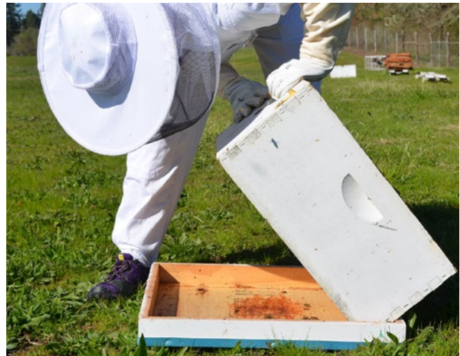
Figure 11. Lifting hive body to inspect beetles that may have moved down onto the outer cover

When a hive is opened for inspection, the beetles quickly flee and hide in hive crevices. The adult