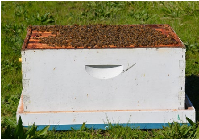
Figure 10. Hive body placed into the outer cover