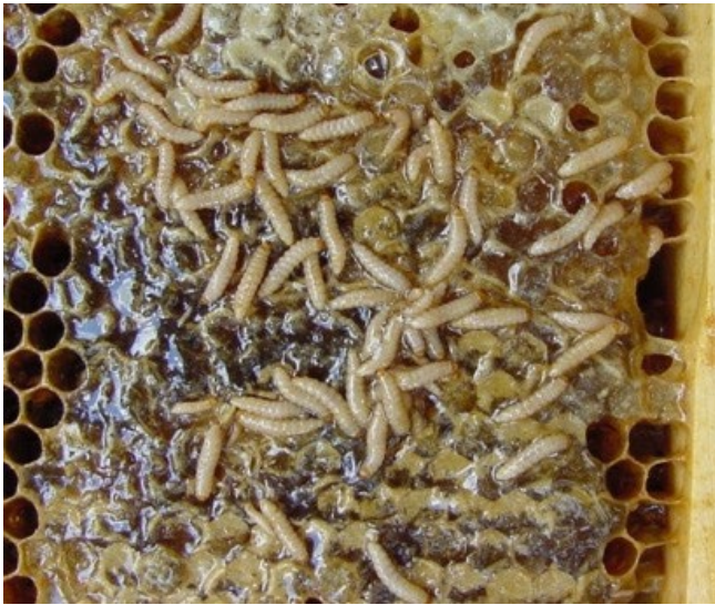
Figure 7. Small hive beetle damage