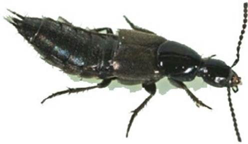
Figure 3. Rove beetle