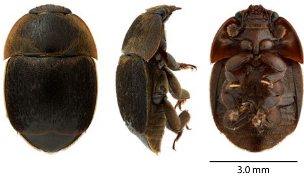
Figure 1. Dorsal, lateral, and ventral view of the small hive beetle.

Rendering: Alan Dennis, Oregon State University