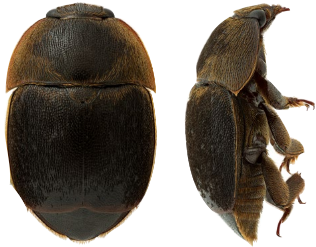
Adult small hive beetle.