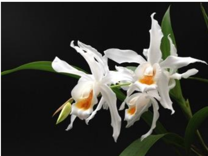
Coelogyne Linda Buckley

Still I have managed the odd nice pic. I have lots of miniature orchids so I needed a SLR camera with a macro lens. Manual photography is great as you can pick the focal point, adjust the exposure and much more. I start with an aperture of F20 and ISO set at 200. This is not always necessary to get a good pic. Today's smart phones have great cameras in them and though you are shooting automatic you can get some amazing results. Love how you just need to touch the screen to show the camera where to focus. Also, more basic point and shoot cameras have automatic and manual functions so this might be another option. (iPad example see pic Coelogyne Linda Buckley)