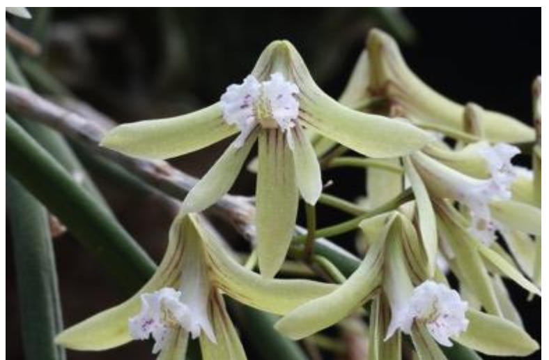
Dendrobium (Dockrillia) Limestone