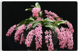
Sarc. Burgundy On Ice 'Australia'

Award: CC Date: 20/10/2020 Owner: Sylvia Kappl Location: Photo Judging