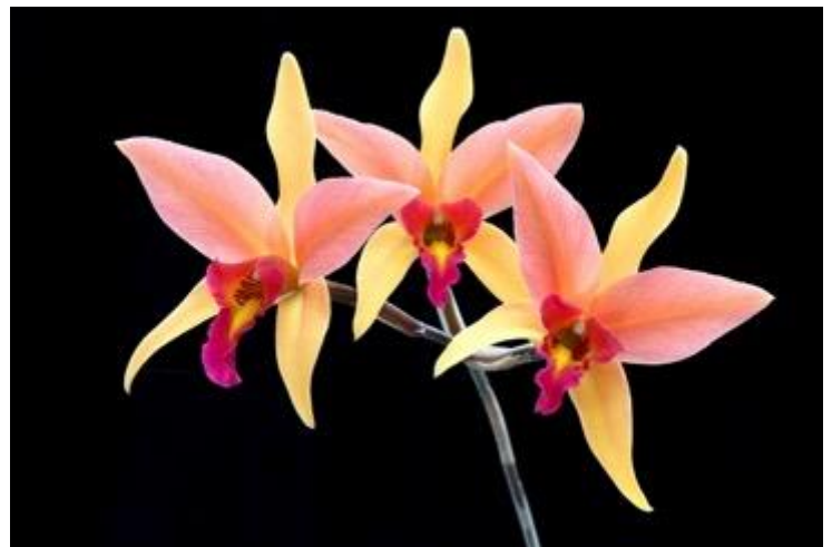
Laeliocattleya Santa Barbara Sunset

In another incarnation, many years ago before digital photography, when you had to wait a week to see your results. I asked a well known photographer of aquatic life how he got such great pics, he said, "Take lots of photos!"