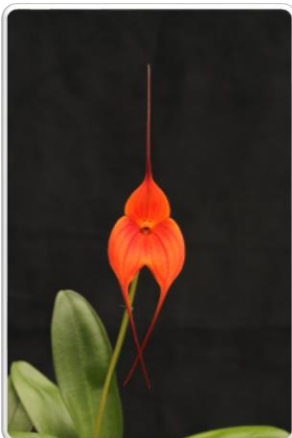
Masd. Super Nova 'Rich Orange'