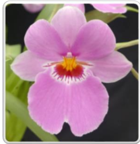
Mps. Pink Cadillac 'Polina'