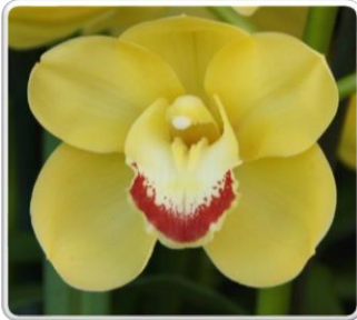
Cym. Coraki Glowing 'Kenthlyn'