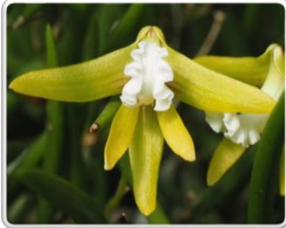
Den. striolatum 'Anyas'