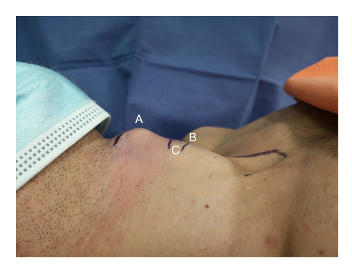
FIGURE 2. Neck, lateral view. (A), thyroid prominence; (B), cricoid prominence; (C), cricothyroid membrane.

for difficult cricothyroidotomy SHORT (surgery, hematoma, obesity, radiation, tumor/trauma) should be taken in account.