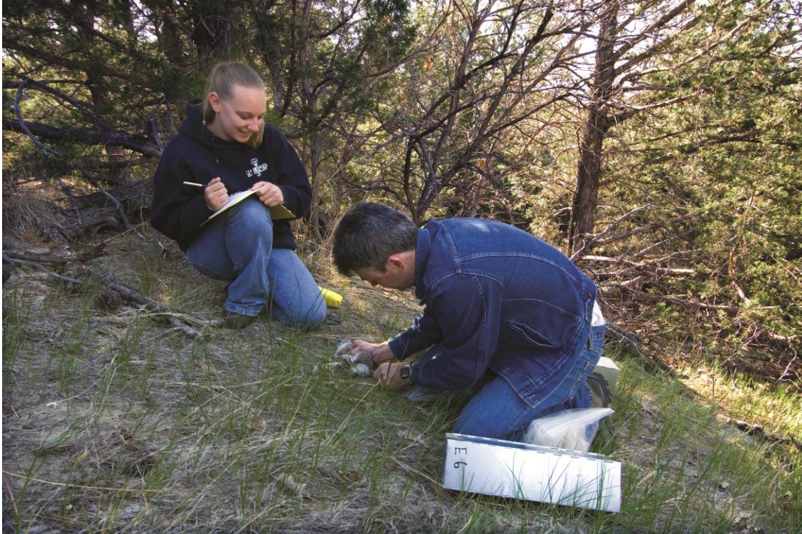
FIGURE 5. Researchers from Wartburg College use live traps to capture Bailey's eastern woodrats in order to collect data on their mass, age and sex.