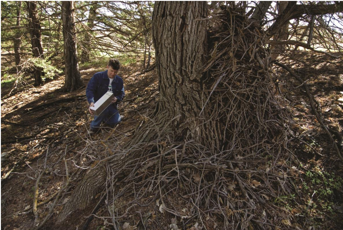
FIGURE 4. Dr. David McCullough, professor of Biology at Wartburg College, finds an eastern woodrat house more than 2.4 m (8 ft) in diameter.

Area requirements have yet to be measured for N. f. baileyi in Nebraska. However, using the best available knowledge obtained from researching the other subspecies, N. floridana adult males can travel a mean maximum of 105 meters (0 - 300 meters) and subadult and adult females travel 44 meters (0 - 200 meters). Males in breeding condition can travel the farthest (Fitch and Rainey 1956) in search of mates (Monty and Feldhamer 2002). Translocated eastern woodrats were able to return to home areas less than 305 meters away (75% return) and over 305 meters away (32% return), with males exhibiting the highest homing abilities (Classen 1968). But, the farther woodrats must travel to find resources and mates, the likelier they will be preyed upon (Monty and Feldhamer 2002). Prior work has shown N. floridana to use an average home range of 0.26 ha (0.64 a) for males and 0.17 ha (0.41 a) for females (Goertz 1970). Frost (2007) found Bailey's eastern woodrat density estimates in the Middle Niobrara River Valley to be 0.72/ha in both 2004 and 2005 (2004; 0.58-0.91, 2005; 0.56-0.90). Woodrats exhibit aggressive behavior in defending territories where they frequently injure or even kill a conspecific (Poole 1940, Wiley 1980); therefore, there is likely a minimum recommended patch size appropriate for minimizing conflicts in suitable habitat. Previous research has shown nest densities of 9.4 nests/ha in riparian woodlands and 55.5 nests/ha in shelterbelts.