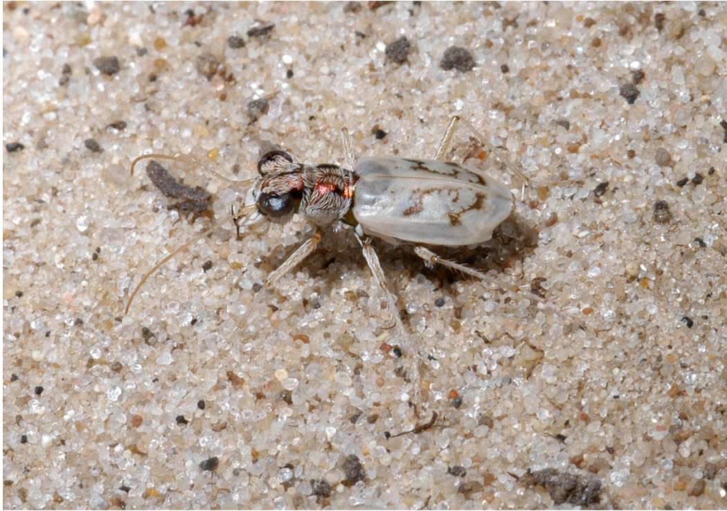
FIGURE 1. The cryptic coloration of ghost tiger beetles ( Cicindela lepida ) paired with their nocturnal behavior, often in remote areas, during a short period of time in the summer make them challenging to locate.