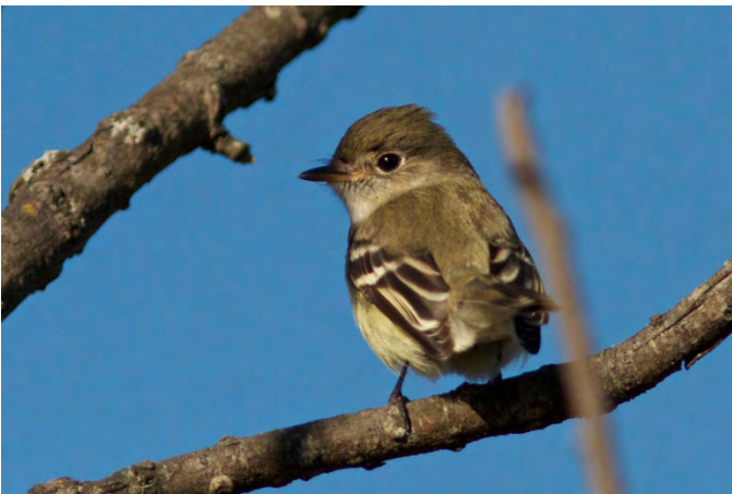
Least Flycatcher ( Empidonax minimus ). This very late bird was found and photographed at Exton Park at Church Farm School 25 November 2011.