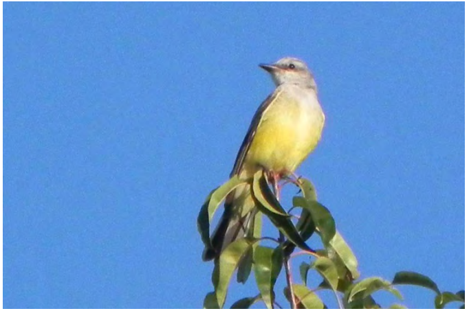
Western Kingbird ( Tyrannus verticalis). This surprising bird at Pennypack on the Delaware 9 October 2011 represented Philadelphia's eighth record for the species.