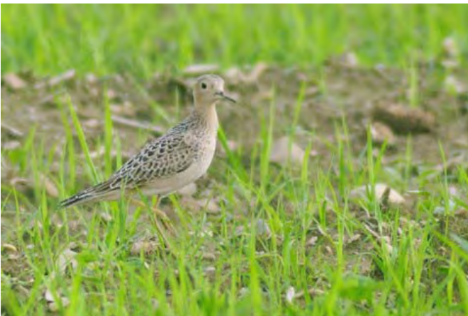
Buff-breasted Sandpiper ( Tryngites subruficollis ). This bird present near Fredonia, Mercer was one of at least three Buff-breasted present in a plowed field that also held up to 4 golden-plovers, Pectoral Sandpiper, and Baird's Sandpiper in early Sept. Photographed here 12 September 2011. ( Scott Kinzey )