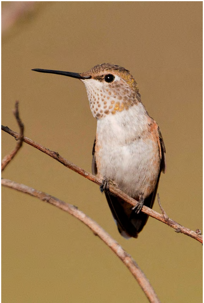
Selasphorus sp. This outstanding image was made at Peace Valley Park, Bucks 8 November 2011. It was an outstanding season for Rufous Hummingbirds in Pennsylvania, with 12 positively identified statewide, along with an additional three Selasphorus reported for the season.