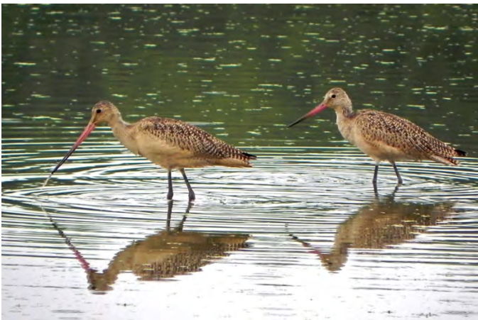
Marbled Godwit ( Limosa fedoa). Pennsylvania's only Marbled Godwits this season were these two at Tinicum, Philadelphia 9 August 2011.