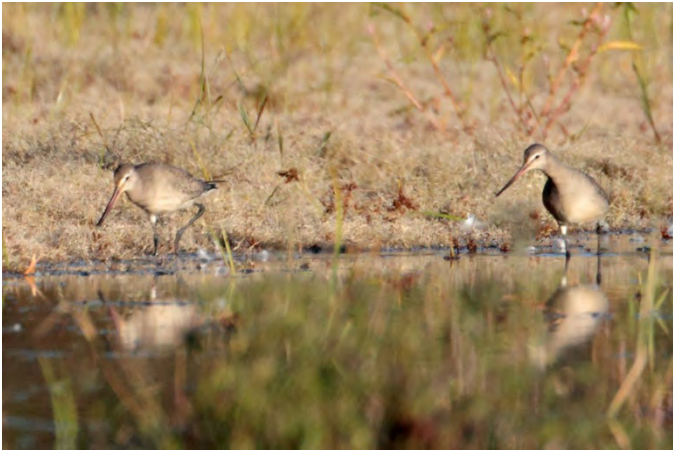
Hudsonian Godwit ( Limosa haemastica ). Beaver's first godwits of any sort came unexpectedly when these two juvenile Hudwits appeared at Independence Marsh 4 October 2011. One remained the next morning but was gone by midday. (Geoff Malosh)