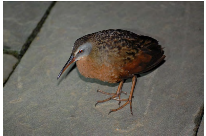
Virginia Rail ( Rallus limicola). This exhausted bird was found and photographed on a patio in Glen Mills, Delaware 9 August 2011.