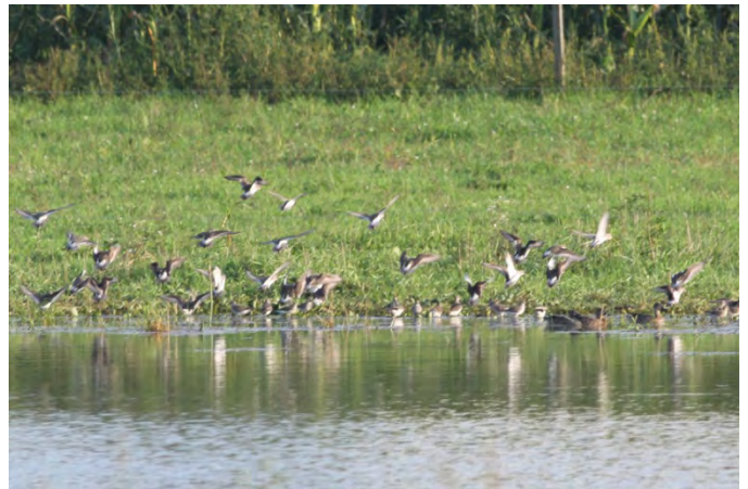
White-rumped Sandpiper ( Calidris fuscicollis ). Another species found in what were perhaps unprecedented numbers this season was White-rumped Sandpiper; this flock of 100+ was photographed at Turbotville, Northumberland 13 September 2011. (Lauri Shaffer)