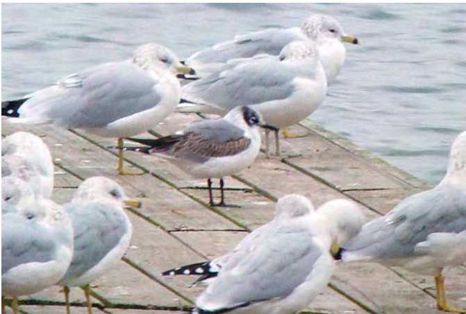
Franklin's Gull ( Leucophaeus pipixcan). This first winter bird was present for one evening only at Moraine State Park, Butler 21 October 2011; fortunately it was nicely photographed.