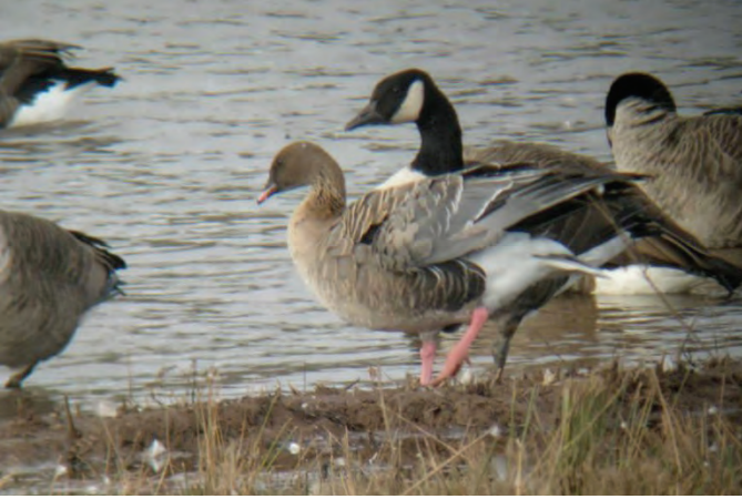
Pink-footed Goose, Pine Run Dam, Bucks County. See p. 230.