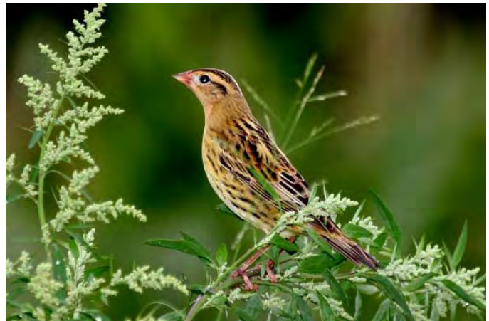
Bobolink ( Dolichonyx oryzivorus). This fine portrait was made at South Avis, Clinton 8 September 2011.