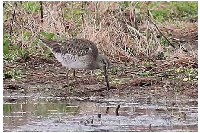
Long-billed Dowitcher ( Limnodromus scolopaceus ). Centre's first Long-billed Dowitcher, shown here 15 October 2011, was present at Fairbrook Wetlands/Tadpole Road. ( Alex Lamoreaux )