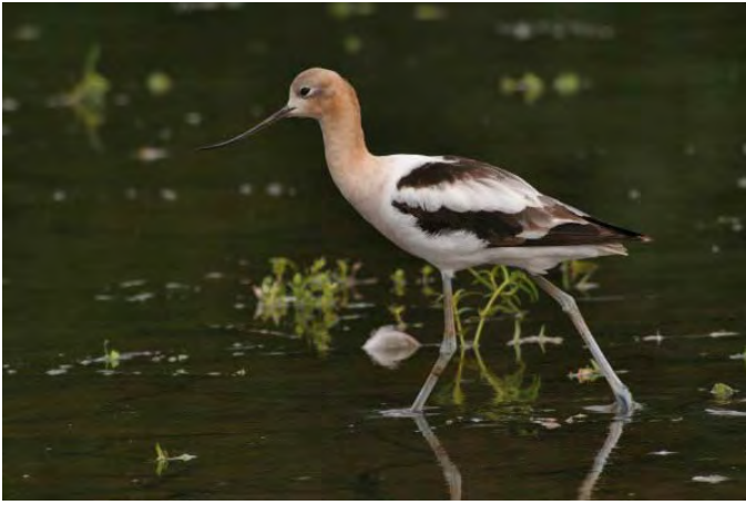
American Avocet ( Recurvirostra americana). It was a great season for avocets in Pennsylvania, recorded in eight counties. One of Lancaster's several contributions to the total was this bird at the Conejohela Flats 6-7 August 2011.