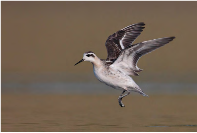
Red-necked Phalarope ( Phalaropus lobatus ). This species was recorded in nine counties this season. Shown here is one of four wonderfully cooperative individuals at a gravel pond near New Beaver, Lawrence, 11 September 2011. ( Geoff Malosh )