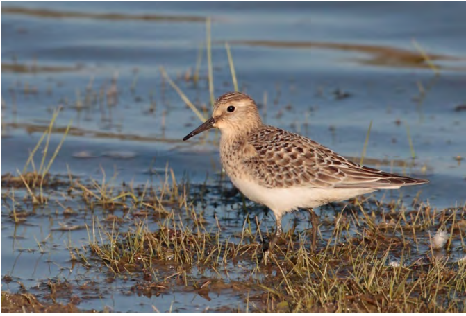
Baird's Sandpiper ( Calidris bairdii ). Baird's Sandpiper was present at Imperial, Allegheny for the second year in a row, after a five-year hiatus. This juvenile was photographed there 18 September 2011.