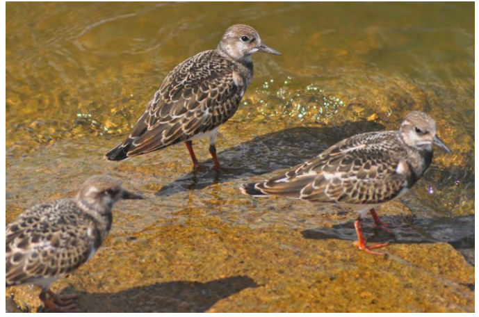
Ruddy Turnstone ( Arenaria interpres). Another species with a fine showing across Pennsylvania this season was Ruddy Turnstone; these three were photographed on the causeway at Pymatuning Reservoir, Crawford 29 August 2011.