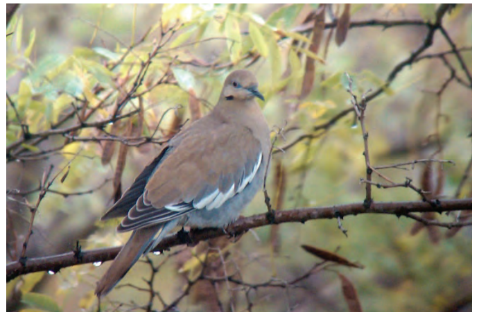
White-winged Dove, Presque Isle State Park, Erie County. See p. 243.