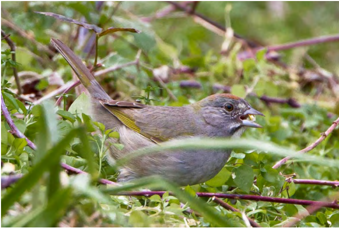
Green-tailed Towhee ( Pipilo chlorurus). Pennsylvania's fourth Green-tailed Towhee appeared 20 November 2011 at Blue Marsh Lake, Berks (here 27 November). It quickly gained fame as it stayed deep into the winter season and was viewed by hundreds of birders.