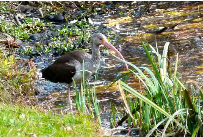
White Ibis ( Eudocimus albus). Taken at Kaercher Creek Park in Hamburg, Berks 11 November 2011, this image of was the first of many hundreds of this ibis, as the bird remained deep into the winter season and became Pennsylvania's first-ever wintering White Ibis.