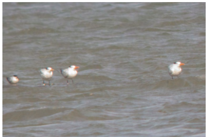
Royal Tern ( Thalasseus maximus ). No rare tern put on better show during Hurricane Irene than did Royal Tern; these 3 birds, incidentally all of which were banded) were photographed at Van Sciver Lake, Bucks. Royal Tern was reported in at least six counties during the storm.