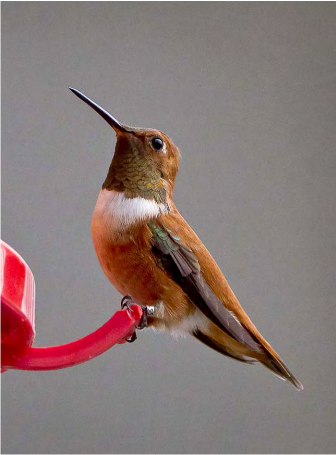
Rufous Hummingbird ( Selasphorus rufus ). This previously banded male was recaptured at Jacobsburg State Park, Northampton 14 November 2011; it was originally banded in its first winter 9 January 2011 at River Ridge, Louisiana. It represented only the second recapture in Pennsylvania of a Rufous that was banded outside of the state. ( Ed Norman )