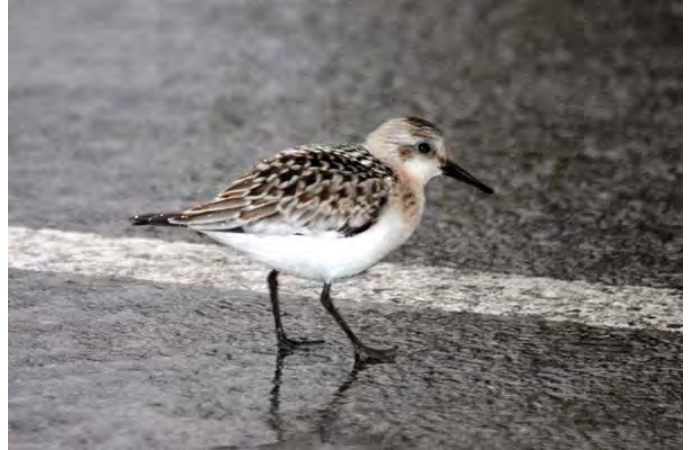
Sanderling ( Calidris alba ). Sanderlings were found in an amazing 20 counties, quite possibly a record total for the state. This bird was present at in a busy boat launch parking area in Lockport, Clinton 6 (here) to 8 September 2011. (Wayne Laubscher)