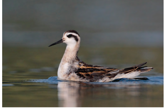
Red-necked Phalarope, New Beaver, Lawrence County. See p. 249.