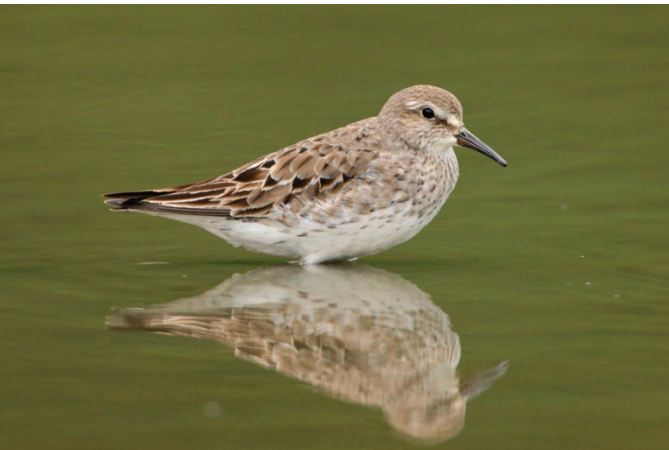
White-rumped Sandpiper, Independence Marsh, Beaver County. See pp. 213 and 226.