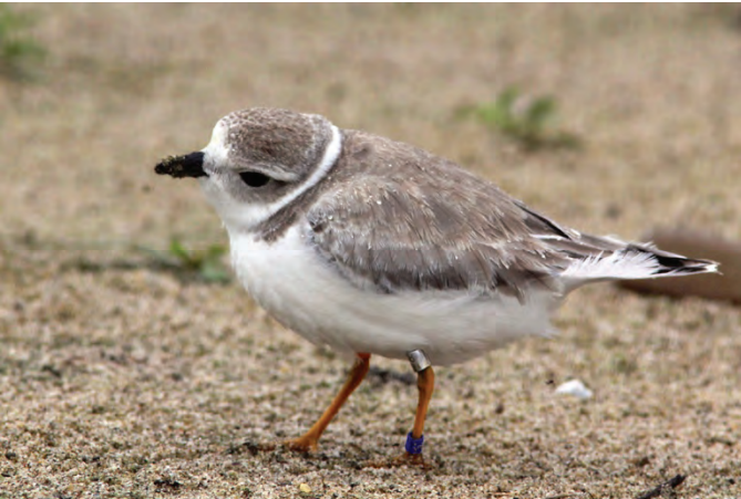
Piping Plover, Presque Isle State Park, Erie County. See p. 243.