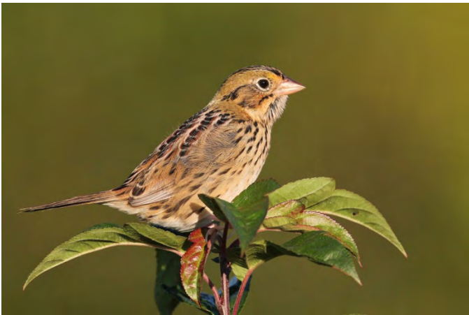
Henslow's Sparrow ( Ammodramus henslowii). This outstanding portrait of a memorably cooperative bird was made at Circleville Farm, Centre 5 October 2011.