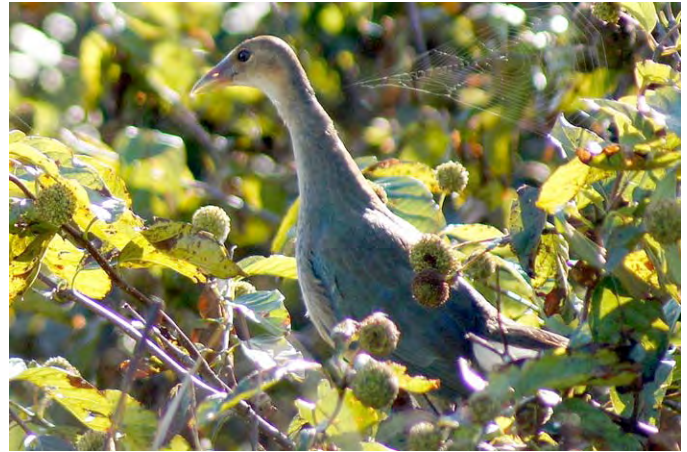
Purple Gallinule ( Porphyrio martinica ). An unexpected surprise on Long Pond at Presque Isle, Erie 9 October 2011 was this juvenile, Erie's third of this species but second in 2011. ( Brian Morse )