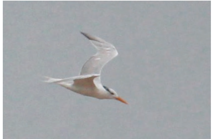
Royal Tern, Bristol, Bucks County. See pp. 212 and 230.