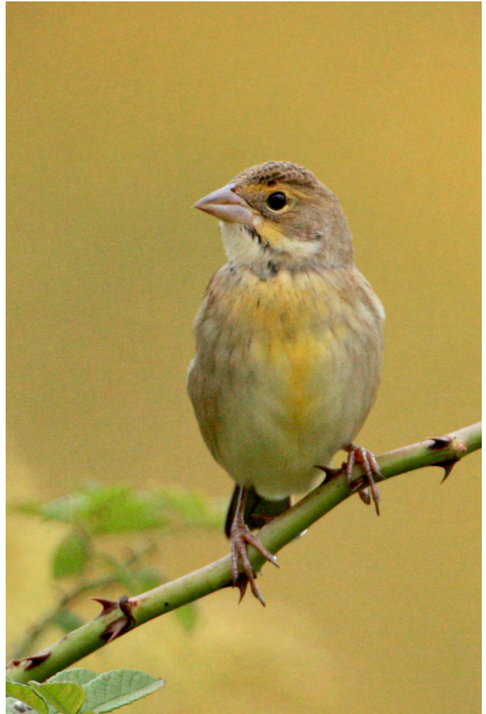
Dickcissel ( Spiza americana). This bird at Boyce-Mayview Park, Allegheny in the afternoon of 3 October 2011 proved to be a 10-minute wonder, as searches by several birders beginning just an hour later were all unsuccessful.