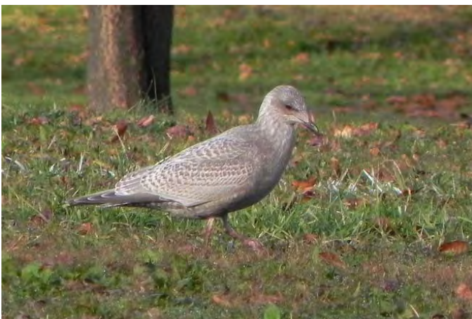
Thayer's Gull ( Larus thayeri). This first winter bird at Pleasant Hill Park, Philadelphia 29 November 2011 would represent a first for Philadelphia if accepted. The record is currently under review