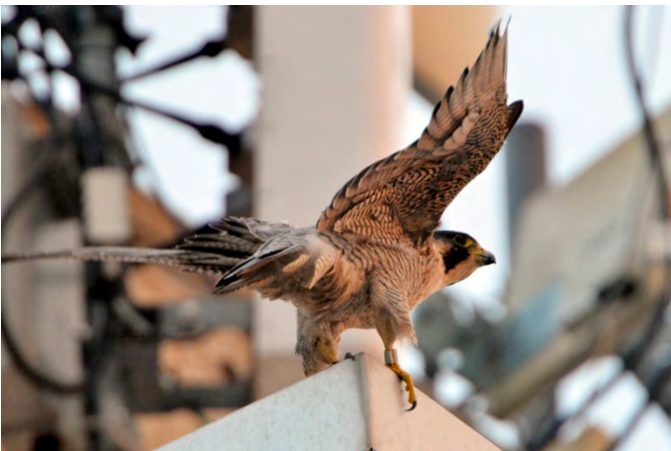
Peregrine Falcon ( Falco peregrinus ). This bird was one of two present in August 2011 at a potential new nesting location in downtown Scranton, Lackawanna . ( Jason Farmer )