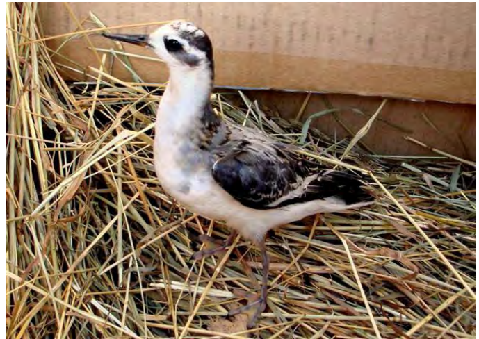
Red Phalarope ( Phalaropus fulicarius ). One of six found this season, this injured bird was found in a cow pasture 8 October 2011 in Salona, Clinton . The bird was rehabilitated but could not be rereleased; it was ultimately transferred into captivity at the Monterey Bay Aquarium in California. ( Wayne Laubscher )