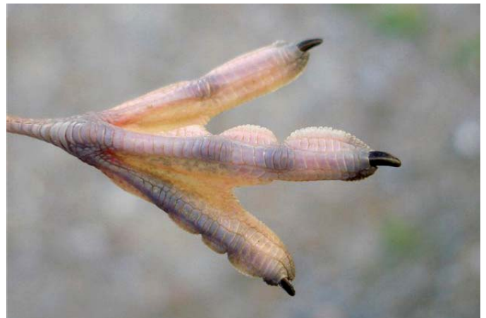
Red Phalarope ( Phalaropus fulicarius ). A close look at the lobed feet of the injured individual captured at Salona, Clinton 8 October 2011.