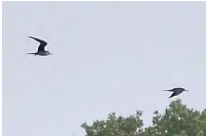
Sooty Tern ( Onychoprion fuscatus ). Hurricane Irene, which passed to the east of Pennsylvania 28 August 2011, will long be remembered for the fallout of terns it brought to the state. These two Sooties were photographed at Lake Nockamixon, Bucks. The species was reported in three counties that day. ( Don Freiday )