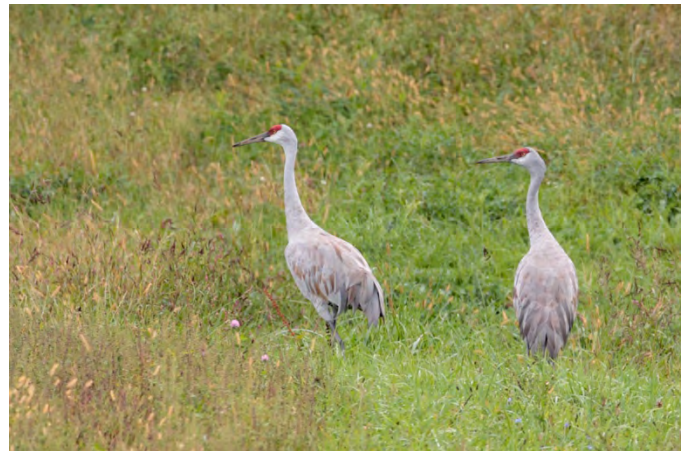
Sandhill Crane ( Grus canadensis ). These two birds were present in Peters Township, Washington (a suburb of the greater Pittsburgh area) 23 to 25 September 2011. ( Geoff Malosh )