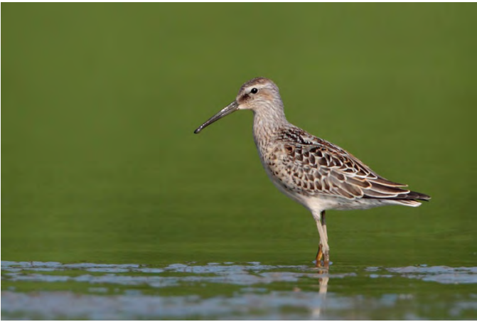
Stilt Sandpiper ( Calidris himantopus ). This beautiful juvenile was one of two at Independence Marsh from 5 (here 7) to at least 8 August 2011. ( Geoff Malosh )