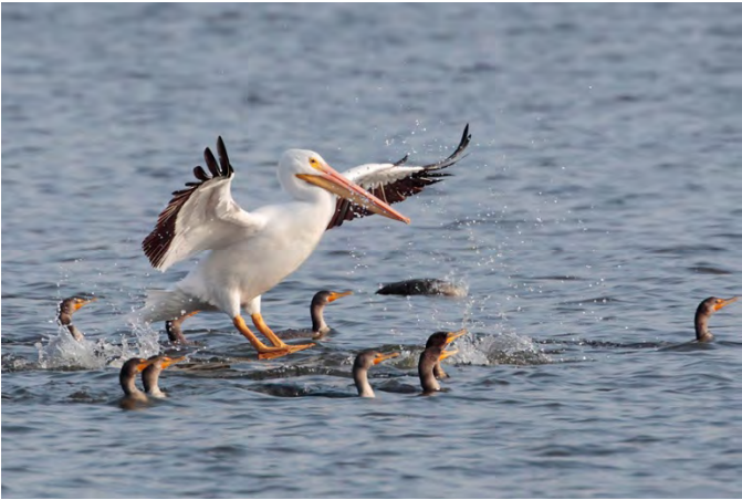
American White Pelican ( Pelecanus erythrorhynchos ). This bird was present near Ford Island, Crawford 17 October to 5 November 2011 (here 23 October) where it was usually visible but often very distant, yet at least a few observers were lucky enough to be afforded a close encounter. ( Geoff Malosh )