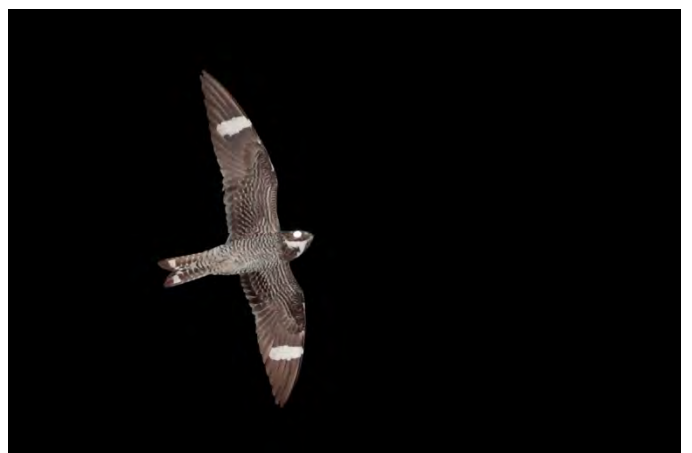
Common Nighthawk ( Chordeiles minor ). Often difficult to photograph, this bird was one of at least 30 that were cooperatively foraging fairly low and in the lights over a tennis court in Moon Township, Allegheny 22 August 2011. ( Geoff Malosh )