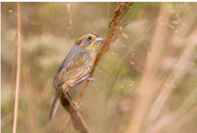
Nelson's Sparrow ( Ammodramus nelsoni). This dull Nelson's photographed at Pennypack on the Delaware, Philadelphia 18 October 2011 was thought to be of the subvirgatus population.