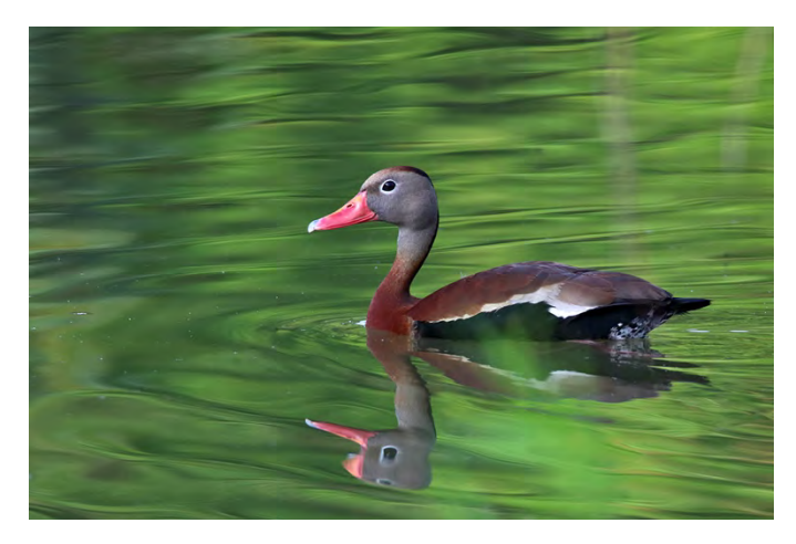
The first record for Clarion : Black-bellied Whistling-Duck at Reidsburg 16 June. ( Jeffrey Hall )