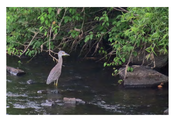
A juvenile Yellow-crowned Night-Heron, perhaps from the Harrisburg nesters, at Prince Gallitzin SP, Cambria 3-6 (here 6) July; first county record.