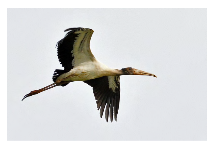
One of four immature Wood Storks at Octoraro Reservoir, Lancaster 23 (here 31) July into Aug; also recorded in Chester .