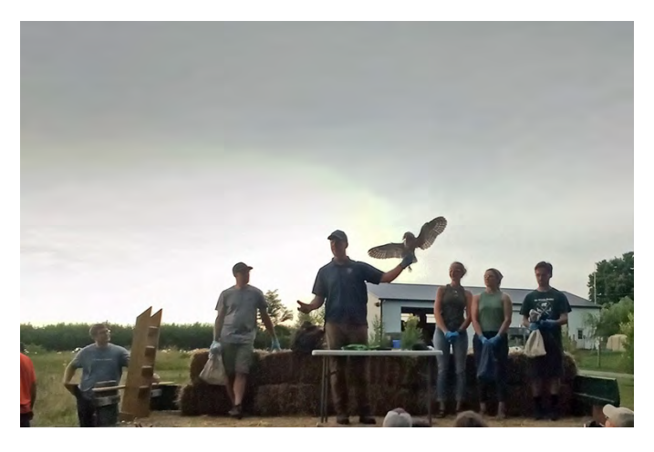
Barn Owl banding at Rinks, Montgomery 12 July.