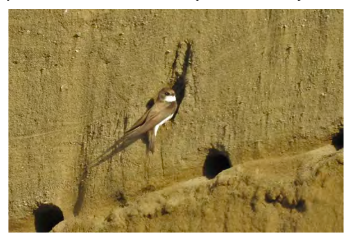
Bank Swallow Block detection dropped 36% from BBA1 to BBA2. Oakland Twp., Susquehanna 14 June 2022.

Two swallows, Purple Martin (-44%) and Bank Swallow (-36%) depend on aerial insects. Both also face challenges in finding suitable nesting sites. For martins, the decline in small family farms may mean fewer martin house colonies and they may also suffer from nest competition by House Sparrows and European Starlings. Bank Swallows depend on accessible banks, often along water ways, but also on mining and quarrying operations where large mounds of sand and related material may be left un-altered for years, a situation Bank Swallows exploit. Such active operations