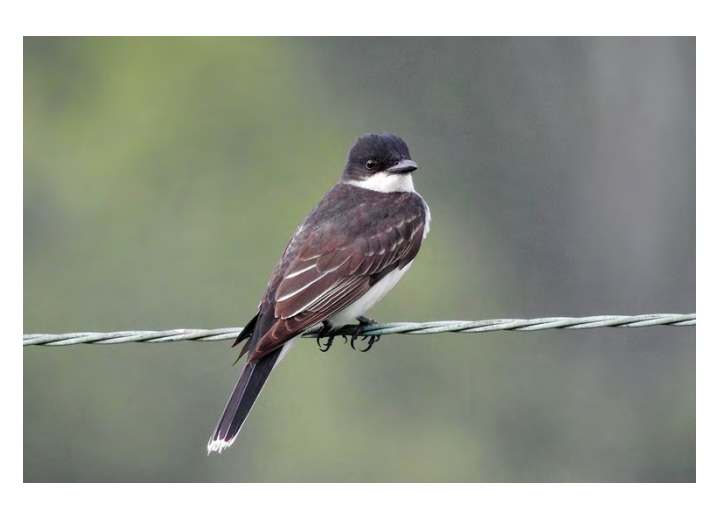
Eastern Kingbird at New Milford, Susquehanna 7 July.