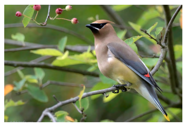
Cedar Waxwing feeding on serviceberries at Howard, Centre 5 June.