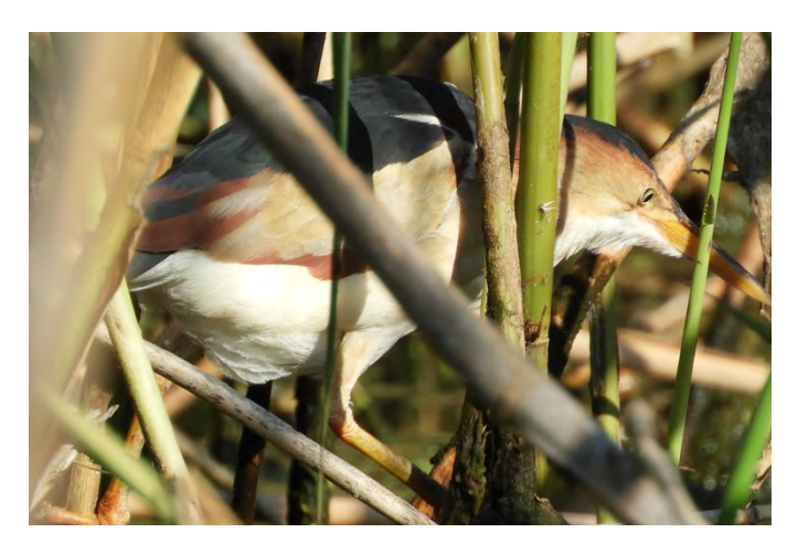
Least Bittern at Kahle Lake, Clarion 4 July, first county record during the nesting season.