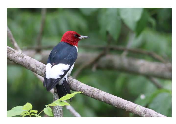
Not often seen in Venango , this Red-headed Woodpecker was at Seneca 26 June.