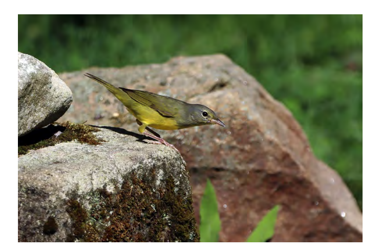
Mourning Warbler at Seneca, Venango , not far from the northern Pennsylvania breeding range, 28 July.