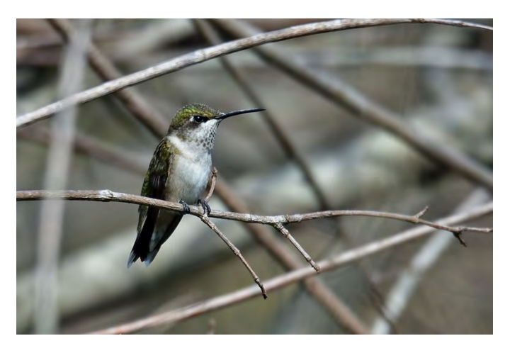
Ruby-throated Hummingbird at the Varden observation area, Wayne 30 July.