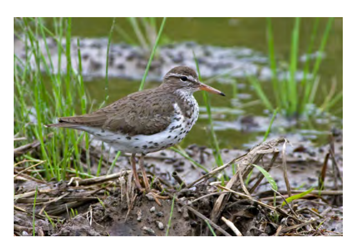
Spotted Sandpiper Block detection dropped 34% from BBA1 to BBA2. Barefoot Rd., Mifflin 11 May 2019. (Rob Dickerson)

Pennsylvania's official State Bird, the Ruffed Grouse (-33%) was found in about one-third fewer blocks during BBA2, a decline that has continued and is apparent in state Christmas Bird Count data. Forest maturation probably plays a role, as grouse require ground cover characteristic of a young forest. Losses from BBA1 to BBA2 were especially severe in southeastern and southwestern counties where loss of such habitat was most pronounced. A second