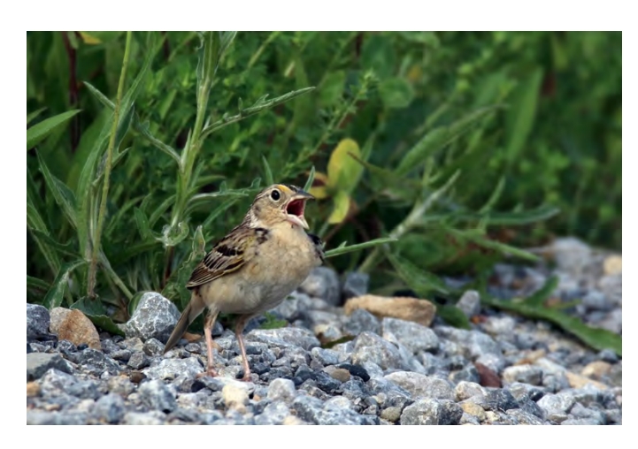
Grasshopper Sparrow at the Piney Tract, Clarion 16 June.