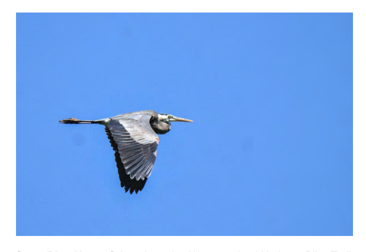
Great Blue Heron flying along the Westmoreland Heritage Bike Trail near Saltsburg 6 June. ( Tom Kuehl )