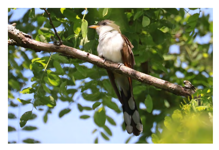
Yellow-billed Cuckoo at Spring Mills, Centre 5 June. (Debra Rittelmann)