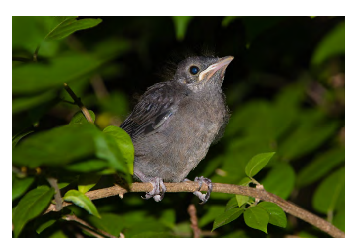
Gray Catbird newly fledged at Media, Delaware 15 June.