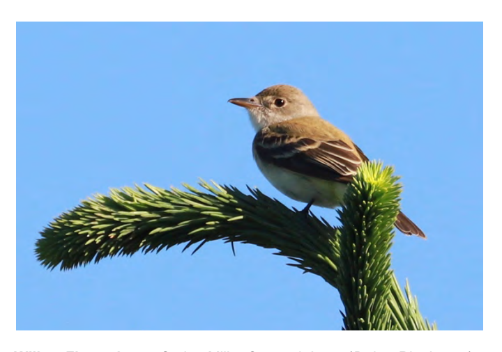
Willow Flycatcher at Spring Mills, Centre 4 June.