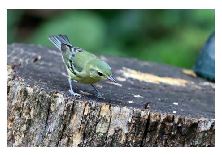
Female Cerulean Warbler at Seneca, Venango 31 July.