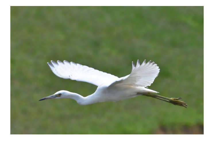
Immature Little Blue Heron in Palmer Twp, Northampton 27 July. ( Dave DeReamus )