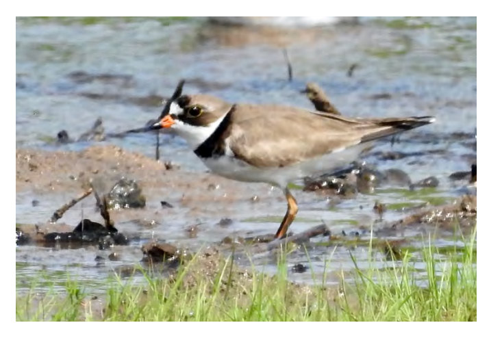
Semipalmated Plover at Hollister's Pond, Susquehanna 1 June. ( Barb Stone )