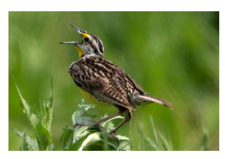
Eastern Meadowlark singing from a teasle stand in an overgrown field at Beech Creek, Clinton 9 June.