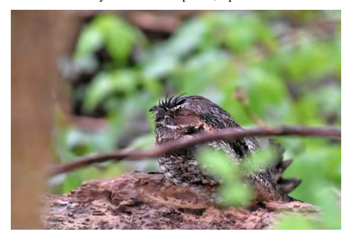
Eastern Whip-poor-will Block detection dropped 42% from BBA1 to BBA2. Haverford College, Delaware 13 May 2022.

but do much of their nocturnal foraging on the wing over areas without a high canopy, i.e. a relatively young forest, such as clearcuts. A further complication in deciphering population status of both Whip-poor-wills and Nighthawks is that special effort at night is needed to survey for these two species, a process not carried out