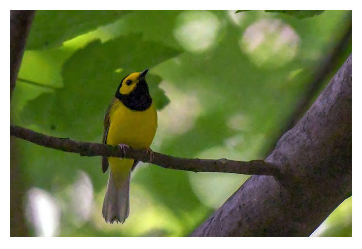
Hooded Warbler at Hellam Hills Nature Preserve, York 29 June.