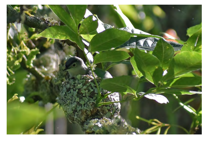
A male Blue-gray Gnatcatcher looking with confidence on the nearly completed nest at Haverford, Delaware 4 June; both parents worked on construction and feeding of the young.