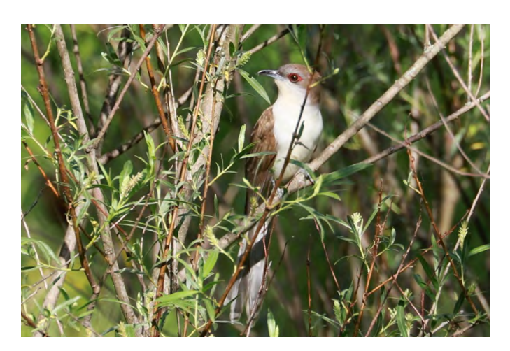
Black-billed Cuckoo at Spring Mills, Centre 3 June.. (Debra Rittelmann)