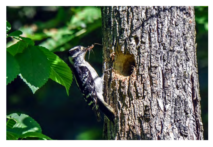
Female Downy Woodpecker delivering what appears to be a spider to unseen young at Murrysville, Westmoreland 4 June. ( Tom Kuehl )