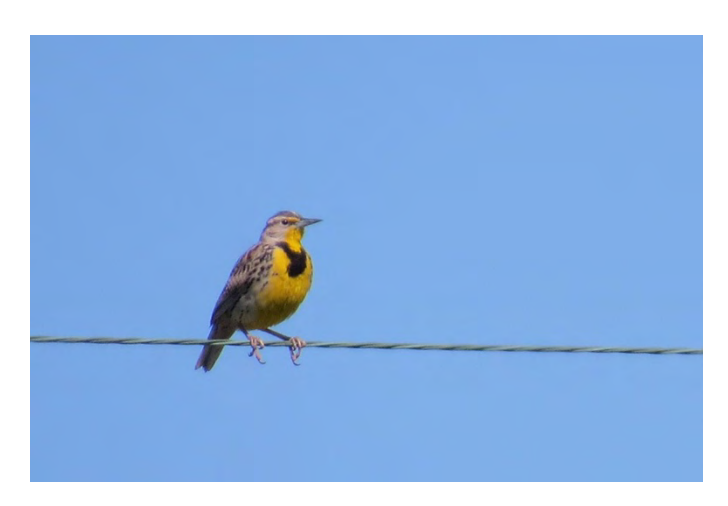
This Western Meadowlark at Howard Eaton Reservoir, Erie 1-11 (here 4) June represents a probable second county record.