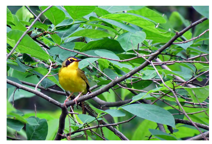
Kentucky Warbler in Tuscarora SF, Perry 9 June. (Chad Kauffman)