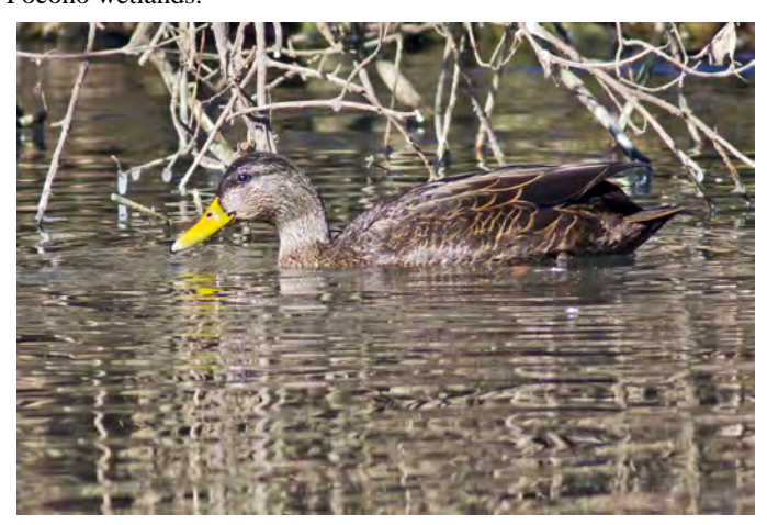
American Black Duck Block detection dropped 63% from BBA1 to BBA2. Centre Furnace Pond, Centre 5 January 2016. (Rob Dickerson)

population estimates for the Atlantic flyway. Principle cited reasons are degradation of wetland quality and hybridization with the closely related, widespread, and more adaptable Mallard. Losses were especially notable in the former Black Duck stronghold in the Pocono wetlands.