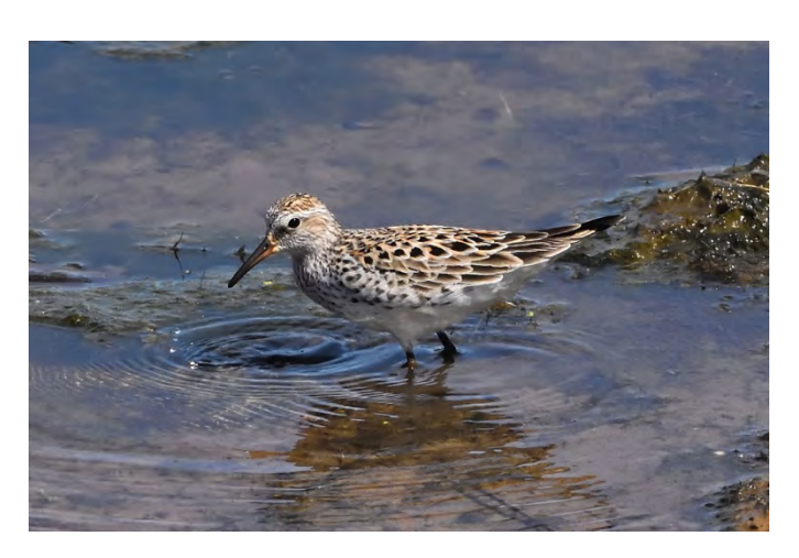
Migrant White-rumped Sandpipers are still migrating through Pennsylvania into June, like this bird in East Allen Twp., Northampton 14 June.