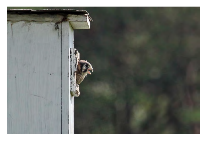
This young American Kestrel is not quite ready for fledging at Swissdale, Clinton 1 July.