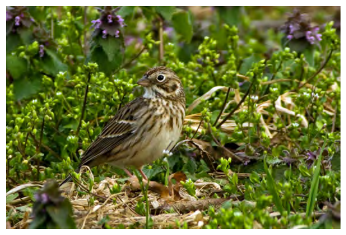
Vesper Sparrow Block detection dropped 19% from BBA1 to BBA2. Kanagy Rd. Mifflin 11 April 2017. (Rob Dickerson)

Vesper Sparrow (-19%) and Henslow's Sparrow (-37%) are part of the group of grassland nesters that collectively are in decline in Pennsylvania. These two species have overlapping, but not identical, habitat requirements. Vesper Sparrows require bare ground for foraging. Henslow's require more vegetation density