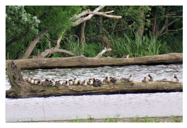
One adult and 23 juvenile Common Mergansers at Green Lane Reservoir, Montgomery 18 June. ( August Mirabella )