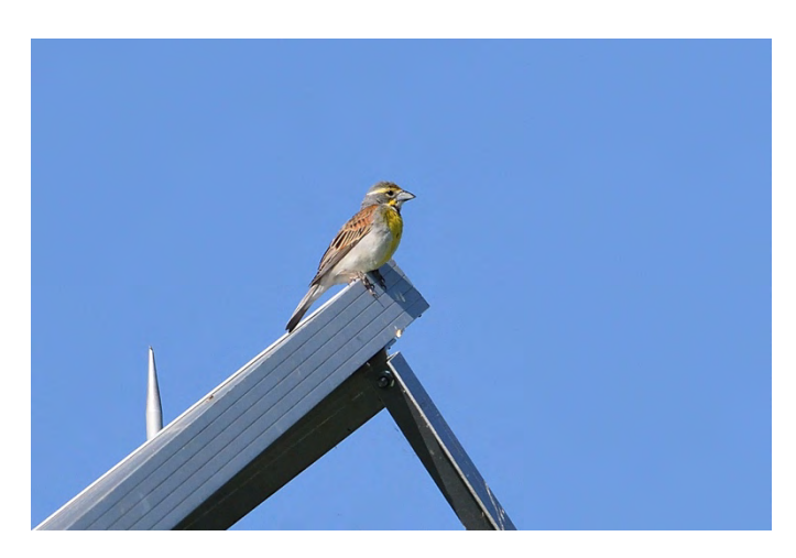
Dickcissel at Honeybrook, Chester, 4-24 (here 6) June.