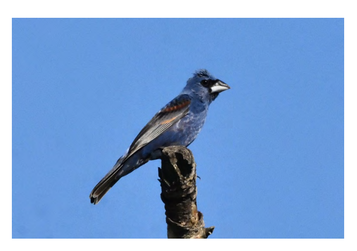
Blue Grosbeak in Plainfield Twp., Northampton 20 July. ( Dave DeReamus )