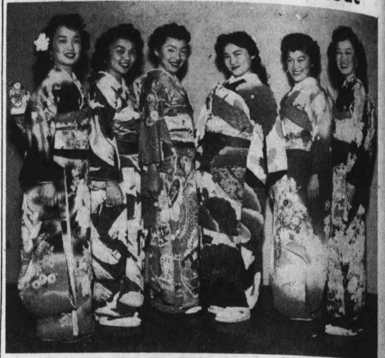
A Nisei girl who will ride in the City of Long Beach float in the annual Tournament of Roses parade in Pasadena on New Year's day will be selected on Dec. 12 when finals in the float attendants contest are held in the Long Beach Municipal Auditorium.

Among the semi-finalists are the six Nisei girls (above) who are vying for the right to represent the Japanese ethnic group on the "Miss Universe" float. Girls from six racial groups will ride the Long Beach float.