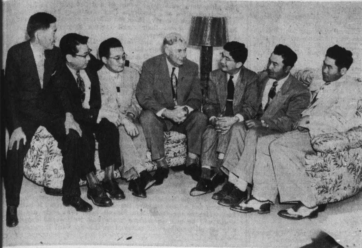
FLORENCE, Ariz.—A delegation of National and Arizona Chapter JACL officials met with Senate Majority Leader Ernest W. McFarland, D., Ariz., at the Senator's ranch in Florence on Dec. 2.

Sen. McFarland assured the group that he supported the JACL ADC's legislative objectives for equality in immigration and naturalization.