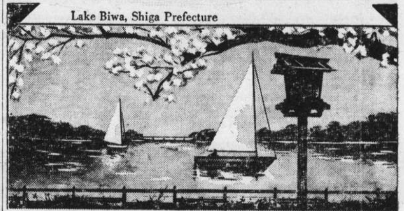
Lake Biwa, Shiga Prefecture