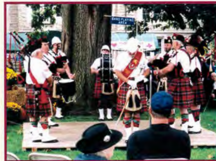
Above - Zembo Highlanders entertain the crowds.