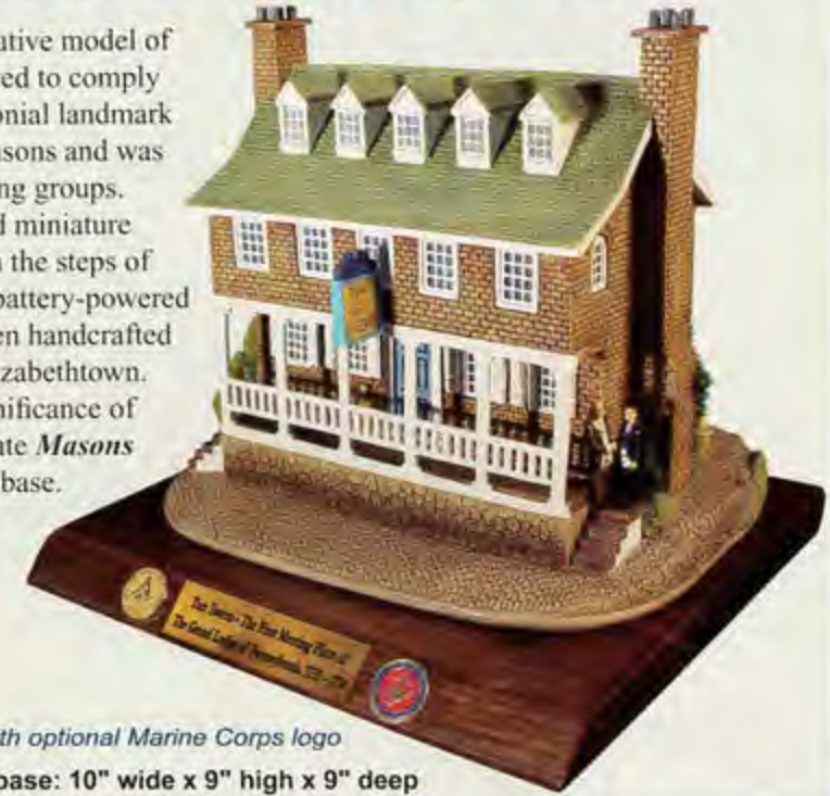
Shown with optional Marine Corps logo

Actual size with base: 10" wide x 9" high x 9" deep