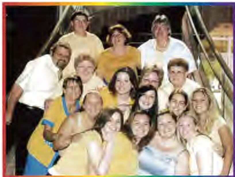
Right: The Pennsylvania delegation (including some DeMolay brothers) pause for a picture during the July Biannual Supreme Assembly of the International Order of the Rainbow for Girls held in Oklahoma City, Okla.

Call today to learn how you can get involved in leading our Masonic youth groups toward success! (717) 367-1536