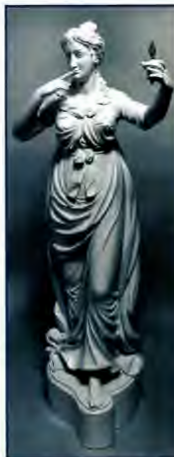
"Silence." William Rush. 1820-21. Wood, painted white. 66" x 32" x 29".

Make your reservation today! Saturday, Nov. 11, beginning at 10 a.m., The Masonic Library and Museum of Pennsylvania will host three scholarly lectures on William Rush and two curatorial tours featuring his works in the Masonic Temple. (215) 988-1909