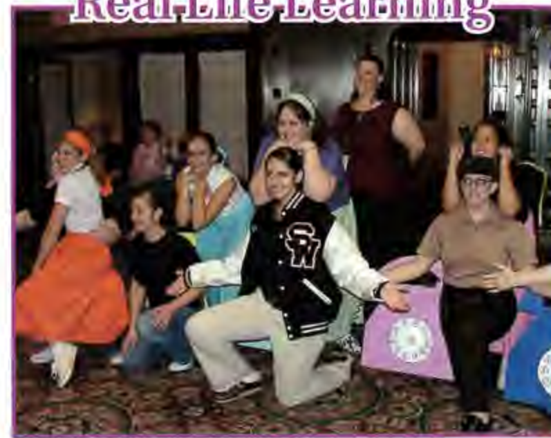
The choir members of Bethel 1, York, Pa., pose with costumes and props after performing their novelty number.