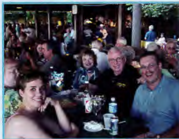
5 th Annual Evening at the Vineyard

Throughout the summer, many of the lodges held golf tournaments, road rallies, chicken BBQs and white elephant auctions, raising more than $25,000 for various charities or scholarships.