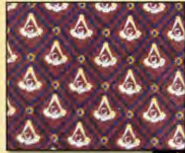
close-up of logos

This 100% silk burgundy tie, adorned with gold and royal blue Square and Compasses, is perfect for any occasion!