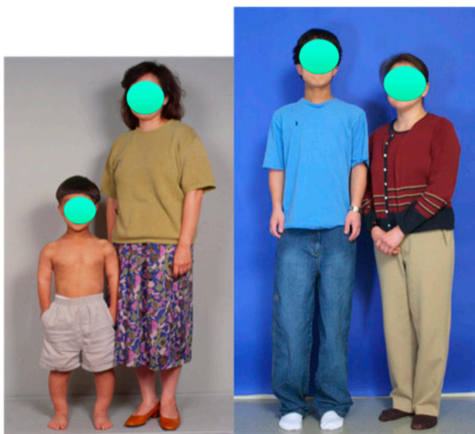
Figure 2. Photograph of male patient with achondroplasia standing beside his mother at age 10 ( left ) and age 16 ( right ). His height increased from 3'9" (114 cm) before lengthening to 5'5.5" (165 cm) after three 4-segment lower-limb juvenile-onset lengthenings totaling 15.75" (40 cm). He also had 12 cm lengthening of his humeri.

The usual goal in the tibiae was 15–16 cm and the goal in the femurs was 10–12 cm. Since 1997, the author switched to simultaneous 4-segment lengthening of both femurs and both tibiae at the same time using external fixation [5] (Figures 2–7). The femurs were lengthened to a maximum goal of 8 cm and the tibiae to 7 cm, for a total gain in height of 15 cm. This method was later modified to do bilateral femoral lengthening with implantable lengthening nails simultaneous with bilateral tibial lengthening with external fixation (Figure 8 left). This was referred to as 4-segment hybrid lengthening (Figure 8 middle). Since 2014, with the advent of shorter and smaller diameter implantable lengthening nails, 4-segment femur and tibia all implantable nail lengthenings were performed (Figure 8, right) [6,7].