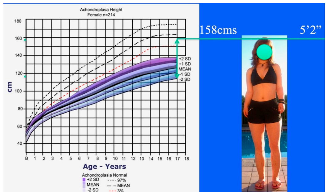
Figure 5. Achondroplastic female height growth chart (lower shaded) compared to normal female height growth chart (upper dashed). Achondroplastic girl from Figure 3 standing to the right of the growth chart showing her 15.75" = 40 cm lengthening added to her preoperative predicted height at maturity (115 cm). Final adult height after three 4-segment leg lengthenings is 5'2" = 157.5 cm, which is in the normal height range for an adult female.