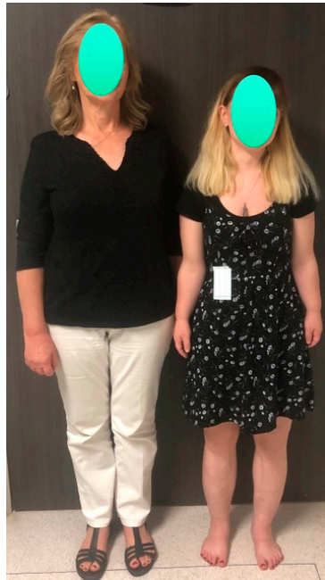
Figure 7. Same patient as in Figures 4–6 standing next to her mother at the age of 28. She began the juvenile-onset ELL at age 7 years. The patient is 5'2" compared to her mother who is 5'9".