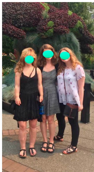
Figure 6. Same patient as in Figures 4 and 5 standing to the right of both of her friends (left side of picture), all of whom are of normal height.