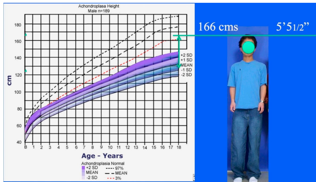
Figure 3. Achondroplastic male height growth chart (lower shaded) compared to normal male height growth chart (upper dashed). Achondroplastic boy from Figure 1 standing to right of growth chart showing his 15.75" = 40 cm lengthening added to his preoperative predicted height at maturity (120 cm). Final adult height after three 4-segment lower limb lengthenings is 5'5.5" = 166.3 cm which is in the normal height range for an adult male.