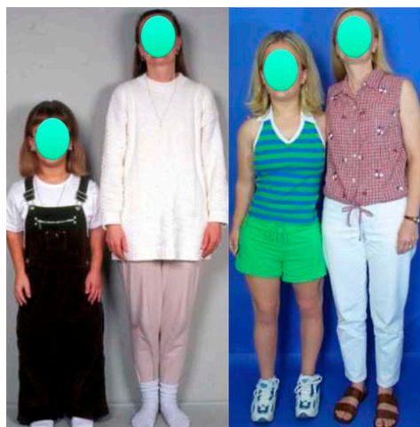
Figure 1. Photographs of a female patient with achondroplasia standing beside her mother at age 13 ( left ) and at age 17 ( right ). Her height increased from 4' (122 cm) before lengthening to 5'1.5" (156 cm) after two lower-limb 2-segment lower-limb adolescent-onset lengthenings totaling 10.25" (26 cm). She also had 10 cm of lengthening of her humeri.

The usual goal in the tibiae was 15–16 cm and the goal in the femurs was 10–12 cm. Since 1997, the author switched to simultaneous 4-segment lengthening of both femurs and both tibiae at the same time using external fixation [5] (Figures 2–7). The femurs were lengthened to a maximum goal of 8 cm and the tibiae to 7 cm, for a total gain in height of 15 cm. This method was later modified to do bilateral femoral lengthening with implantable lengthening nails simultaneous with bilateral tibial lengthening with external fixation (Figure 8 left). This was referred to as 4-segment hybrid lengthening (Figure 8 middle). Since 2014, with the advent of shorter and smaller diameter implantable lengthening nails, 4-segment femur and tibia all implantable nail lengthenings were performed (Figure 8, right) [6,7].