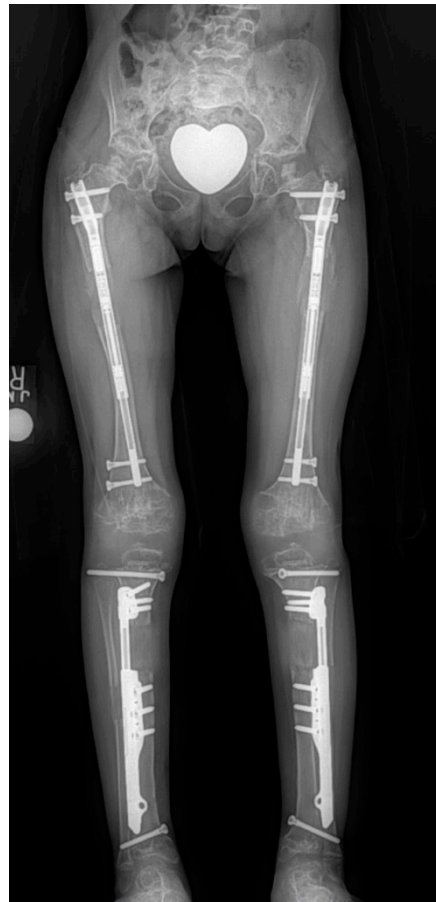
Figure 9. Radiograph showing InFix lengthening in a 12-years-old child with pseudo-achondroplasia using two implantable lengthening nails in the femurs and two implantable lengthening plates in the tibias.

one time. When the nails are exchanged for a second lengthening, the bones do not have to be reamed again, and therefore, all four rods can be inserted in one surgery. Most recently, the extramedullary lengthening with Precice nail or Precice plate has allowed us to use implantable lengthening nails in the femurs and lengthening plates in the tibias (Figure 9) [30].