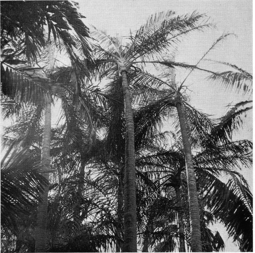
11. A Chrysalidocarpus from Madagascar, probably C. madagascariensis or its variety lucubensis but called Dypsis pinnatifrons in the garden, raises crowns that look very similar to the much more familiar Arecastrum Romanzoffianum .