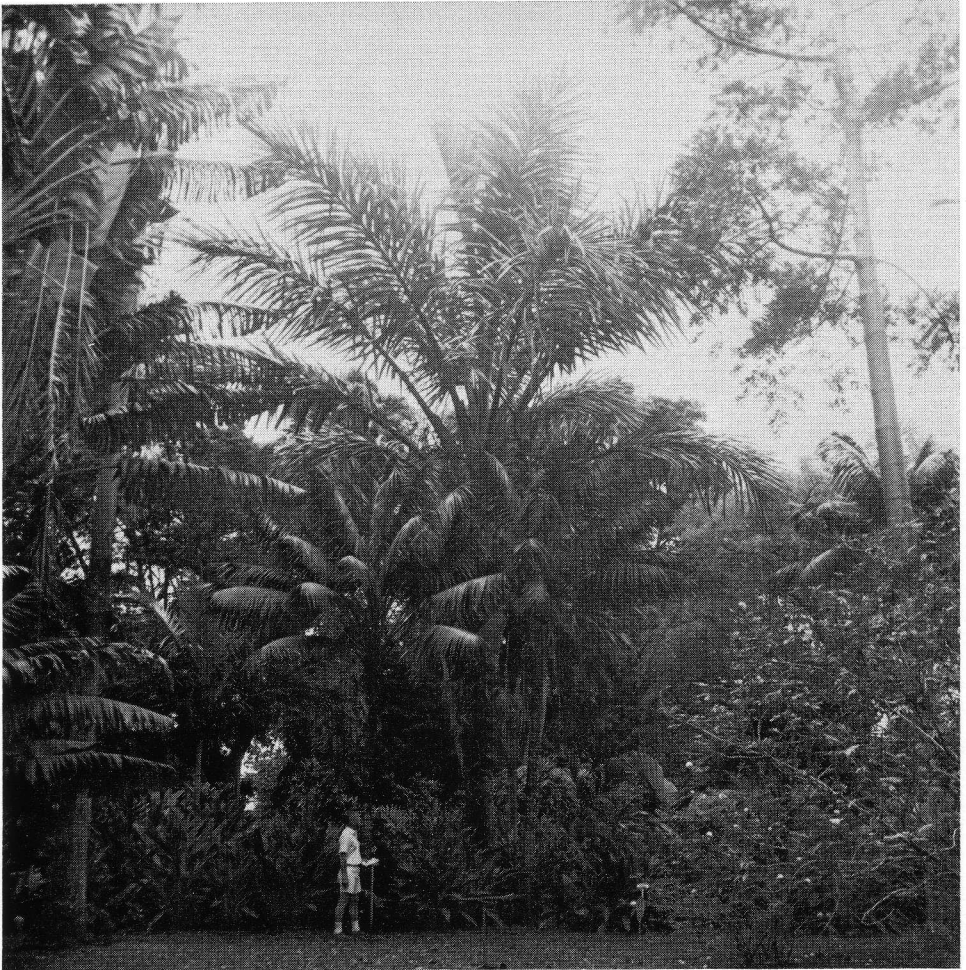
17. The massiveness of Metroxylon amicarum (formerly Coelococcus carolinensis ) is felt as much as it is seen. Next to the figure in the foreground are two Howeia , behind them is M. amicarum . Note the huge tree at the far right towering over everything else. These great trees are found throughout the garden.

a larger concept known as Honolulu Botanic Gardens which is being developed into an unusual and commendable garden complex. This complex when completed will consist of five sites located in five different climate and ecological environments: Foster Garden in the warm humid zone, Wahiawa Garden in the cool humid tropics at 1,000 feet elevation, Koko Crater Garden for plants