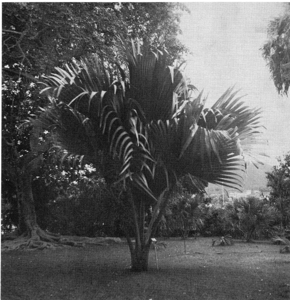
4. At the rear of the garden where the giant trees give way to an area devoted solely to palms, one finds the coco-de-mer, Lodoicea maldivica . Note the extensive surface root system of the tree at the left, Ficus Benjaminia .

here to see the palms so focus attention on the Chrysalidocarpus madagascariensis growing near the bromeliads. As the name implies, the palm comes from Madagascar. It is pinnate with a slender but tall bamboo-like stem. Directly in front of the orchid house grows an old Pritchardi Hillebrandii , one of an extensive collection of this genus of tropical fan palms that is found in the garden.