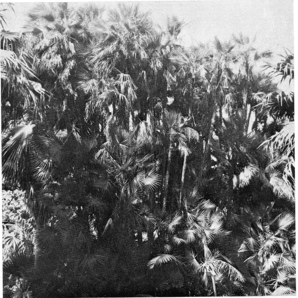
7. An amazingly tall and dense stand of Acoelorrhaphe Wrightii creates its own little forest.

found nowhere else in the world. They are found from sea level to over 4,000 feet elevation, and some may be confined to a single island or even to a single valley. The Foster collection contains all but a few of the described species. A visitor to Hawaii cannot help but wonder as he surveys the acres and acres of sugar cane and pineapple how many unique plant species were lost forever in the wanton clearing of native vegetation for commercial agriculture.