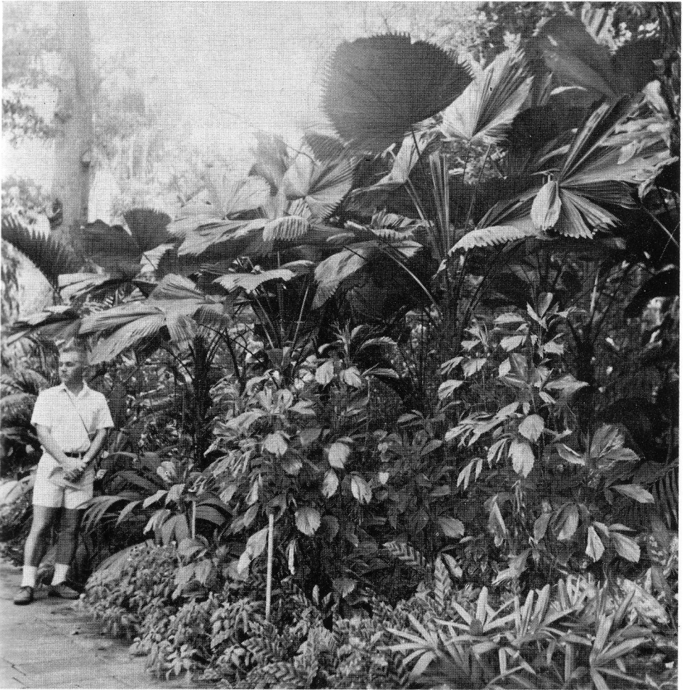
16. This group of Licuala grandis in the rainforest section is one of the loveliest plantings in the entire garden.

by its spines and thorns and projections at the end of its leaves. Contrasting sharply to these smaller species—almost as a shock—is a massive specimen of Metroxylon amicarum from the Caroline Islands. It dwarfs all else around it with a spread equal to that of the largest Phoenix canariensis , yet with an open crown like an Arecastrum and with a relatively smooth trunk proportionate to the crown. This rainforest section of the