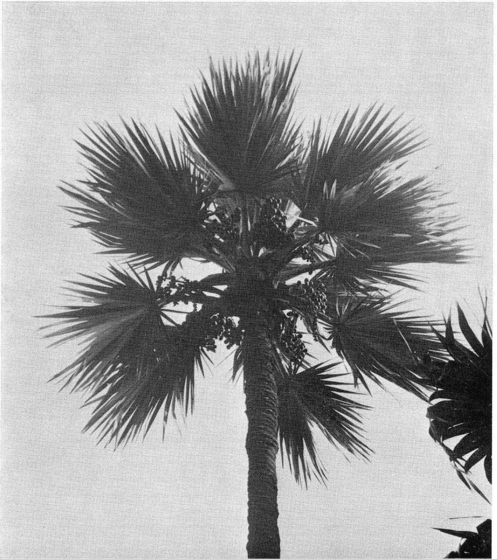
10. The fruit of Latania Loddigesii is interesting, looking deceptively like large bunches of green grapes.