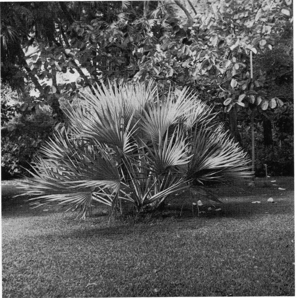
15. This young specimen of Hyphaene thebaica shows the costapalmate leaf, similar to that of many of the Sabal species.

a short distance away. Most of this part of the garden is very informally planted, although in some sections there appropriately are concentrated plantings of related species, for example, a ginger terrace. Of particular interest is the collection of Chamaedorea species and other understory palms which thrive in this section of the garden. Probably the most breathtaking palm planting of all is in this area, consisting of a group of perhaps a dozen Licuala grandis , their great