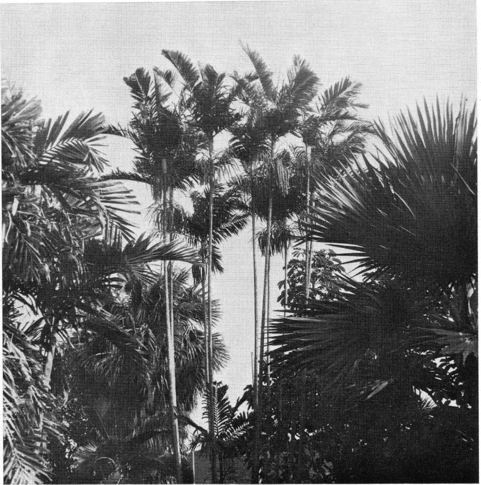
9. These ten soaring trunks of Ptychosperma Macarthurii are loaded with ripening fruit, held in pendulous clusters below the crownshaft.

section apparently devoid of palms, but containing many flowering trees. There he encounters what at first appears to be just one more tree with a main trunk dividing into four ascending secondary trunks and branches. It appears to be an ordinary tree, that is, until the eye reaches the top and finds a crown composed of seventeen beautiful separate heads of grey-green palm leaves. The tree is the branching palm from Egypt