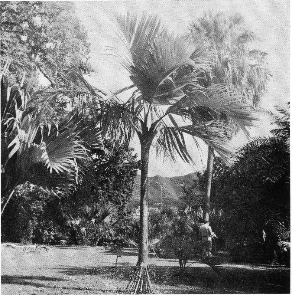
5. Adjacent to the Lodoicea grows this interesting stilt-rooted palm, Verschaffeltia splendida . In the background is a new planting of young palms. The collection of suckering or clumping palms is to the right of the picture.

greater heights than the limits usually accorded this palm. They, along with Archontophoenix Alexandrae , are encountered mainly as trunks with crowns lost high in the treetops. A surprise in this part of the garden is the discovery that one of these tall slender trunks is that of a Sabal , S. mauritiaeformis , a palm with none of the gross characteristics so frequently associated with the sabals.