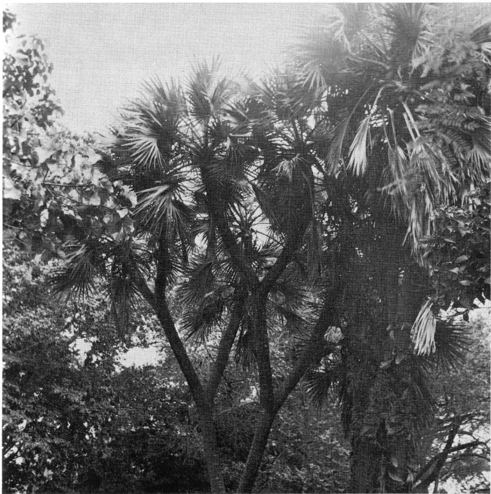
14. The curious branching palm from Africa, Hyphaene thebaïca , is planted apart from the other palms, among the dicotyledonous trees. It is a startling discovery to look up and find a crown composed of palm leaves.