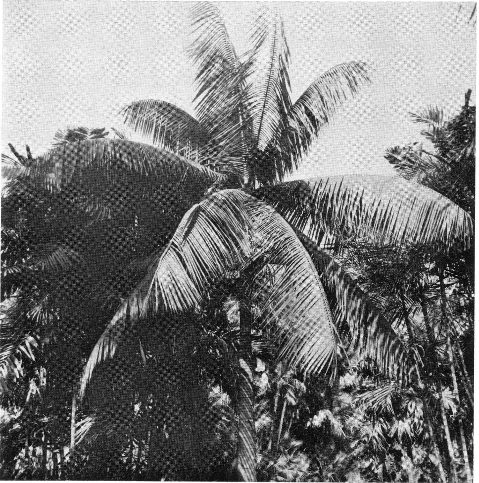
6. Ptychoraphis augusta from Nicobar Island at first glance looks like a Howeia . This palm fruits heavily in Hawaii.

robust aspect is already befitting the tree that will bear the fifty-pound seed, the largest and heaviest seed of any plant, said to require ten years to ripen. The garden is proud of this palm and keeps a double coconut seed on the registration desk at the entrance.