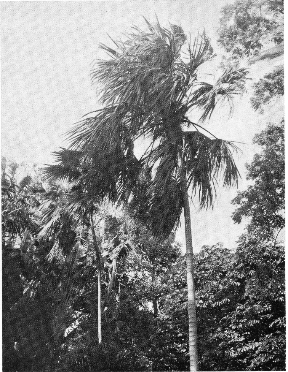
3. It is surprising to discover that this tall, slender palm is a Sabal — S. mauritiaeformis . The trunk is attractively ringed and a light grey in color. During a December visit to the garden, the ground beneath this palm was heavily littered with small black seeds, removing any doubt that this was indeed a Sabal .