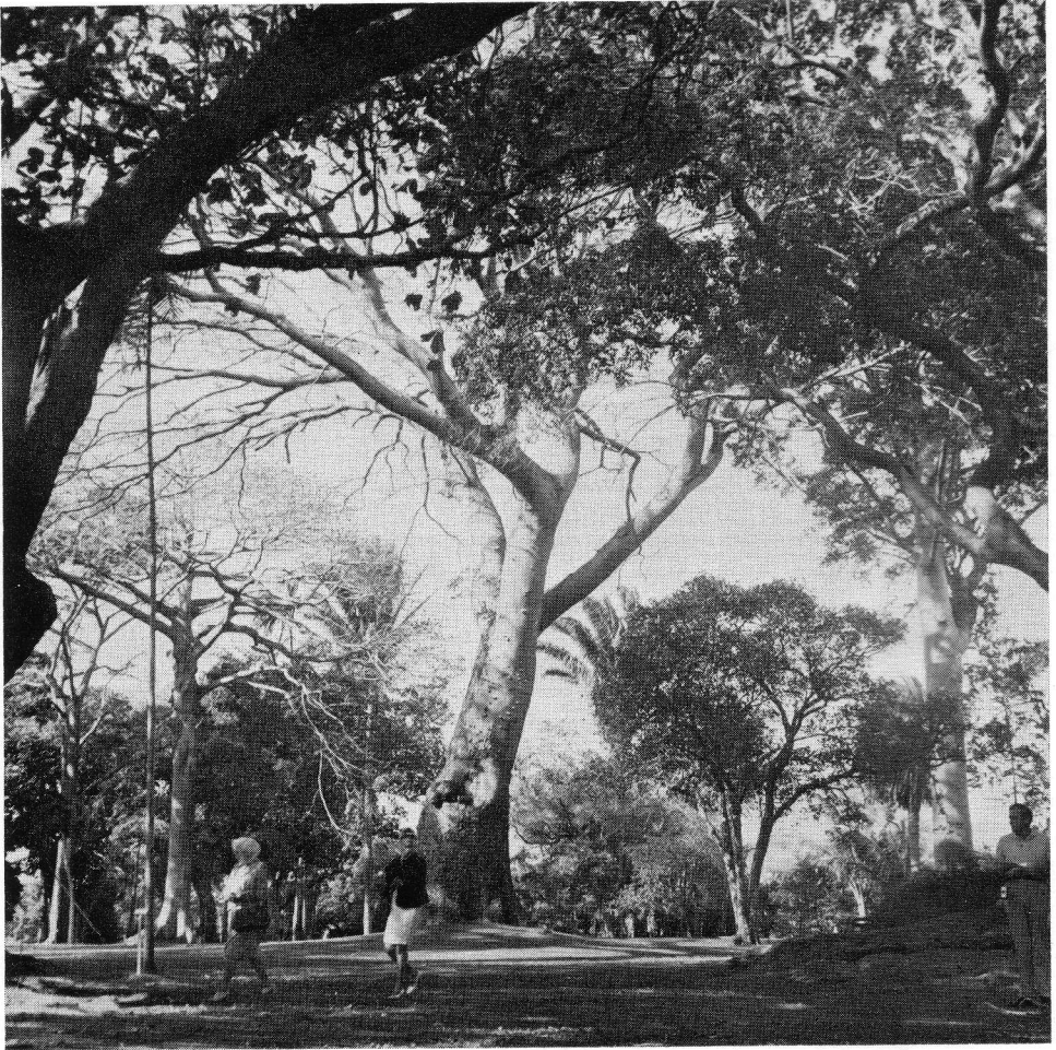
1. Foster Garden is dominated by huge old trees which give a special character to the garden. Note the very tall Dictyosperma album on the left which reaches up through the treetops for light.

The garden is dominated by huge tropical trees of great age such as the banyan, Ceiba , Adansonia and lesser known trees such as Cavanillesia , and Enterolobium . These giants create a feeling or mood that only a very old garden can provoke. What were undoubtedly planned as open spaces are now almost covered by great tents of foliage. Palms are found throughout the garden, but three main areal divisions become apparent to the visitor: those