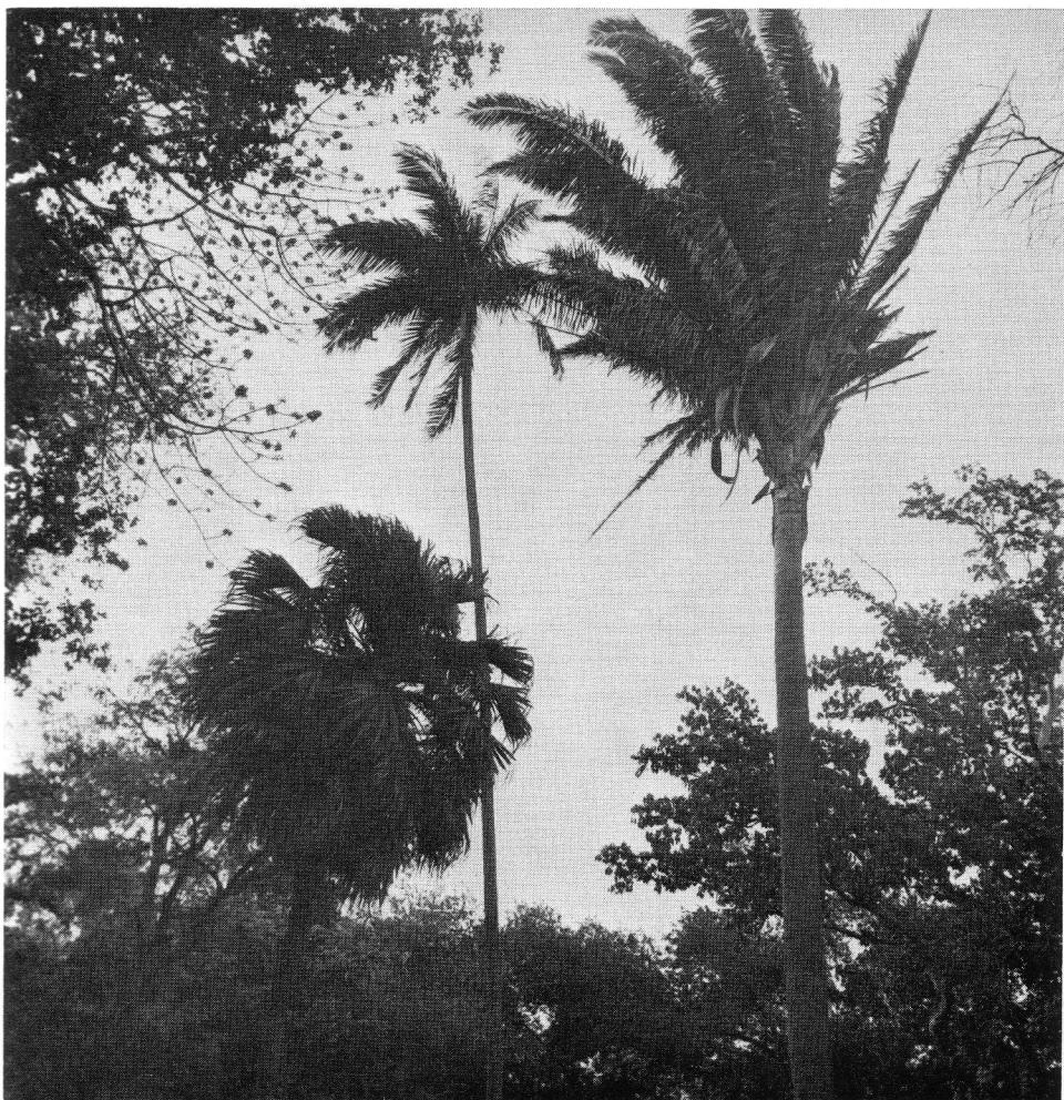
2. Many palms planted among the large trees have developed leaning trunks as the Livistona species in the lower left. The slender palm in the center is a Dictyosperma album and the palm at the right is Orbignya Cohune (formerly known as Attalea ).

own trunks. On close examination one of these trunks turns out to be that of a royal palm whose identity has been lost in the overwhelming crown of the banyan tree. Ahead and beyond this tree lies the rain forest, a kind of core in the center of the garden that is gradually developed and introduced by a planting of Pritchardia . To one's left opens the shady lawn area canopied with the giant trees.